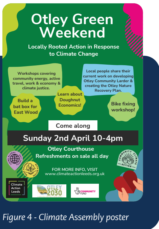
Figure 4 - Climate Assembly poster

CAL has developed an annual cycle of assembly meetings which have built a rhythm and momentum to the programme.