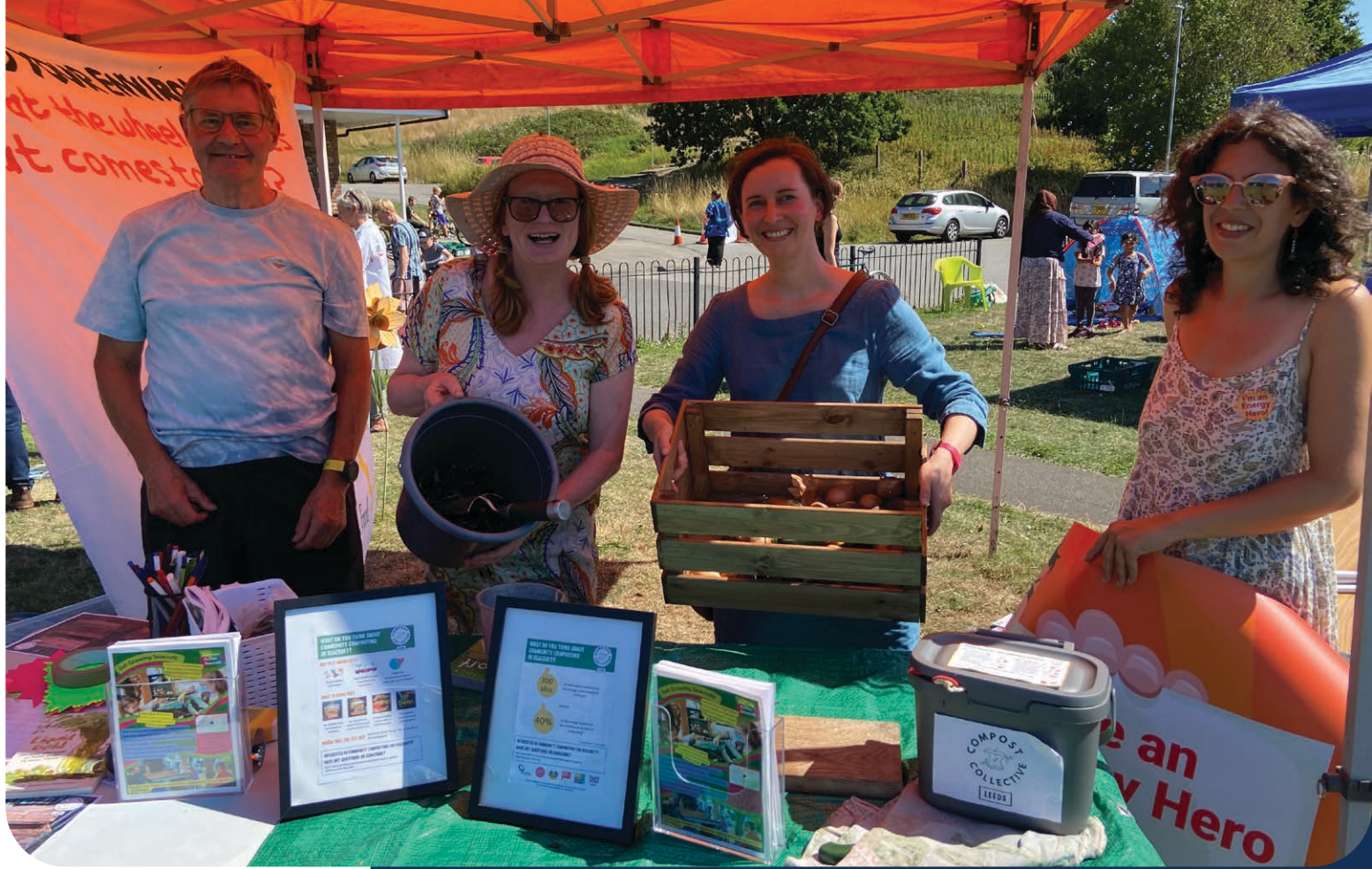
Figure 6 - Composting stall, Seacroft Community Hub, Climate Action Leeds