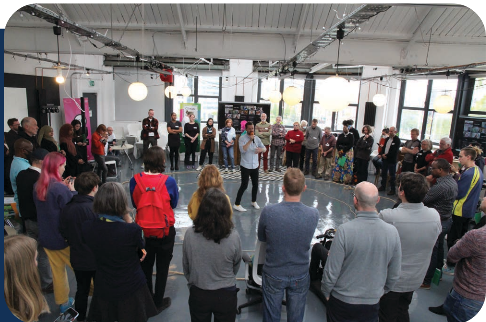
Figure 7 - Launch of the Leeds Doughnut, Climate Action Leeds

Evidence collected during the annual programme assessments suggests that more work is needed to increase the diversity of people engaging in the programme.