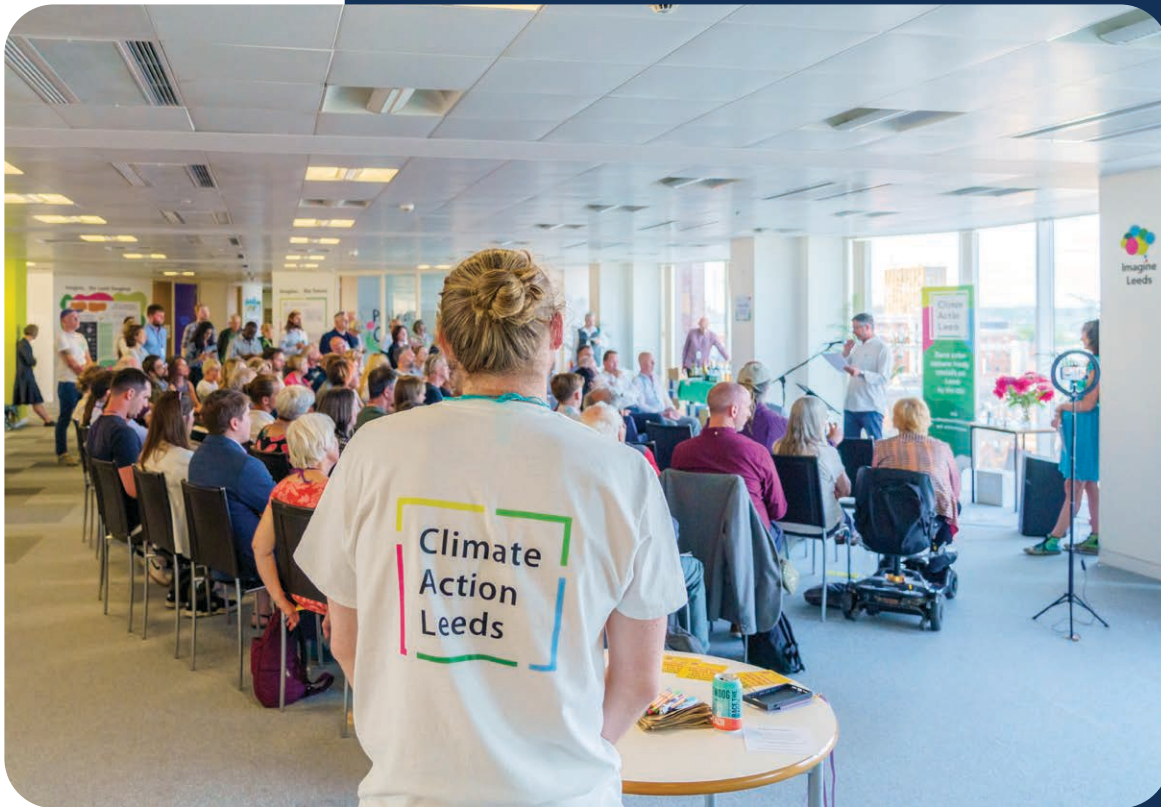
Figure 2 - The launch of Imagine Leeds: climate action hub, Climate Action Leeds