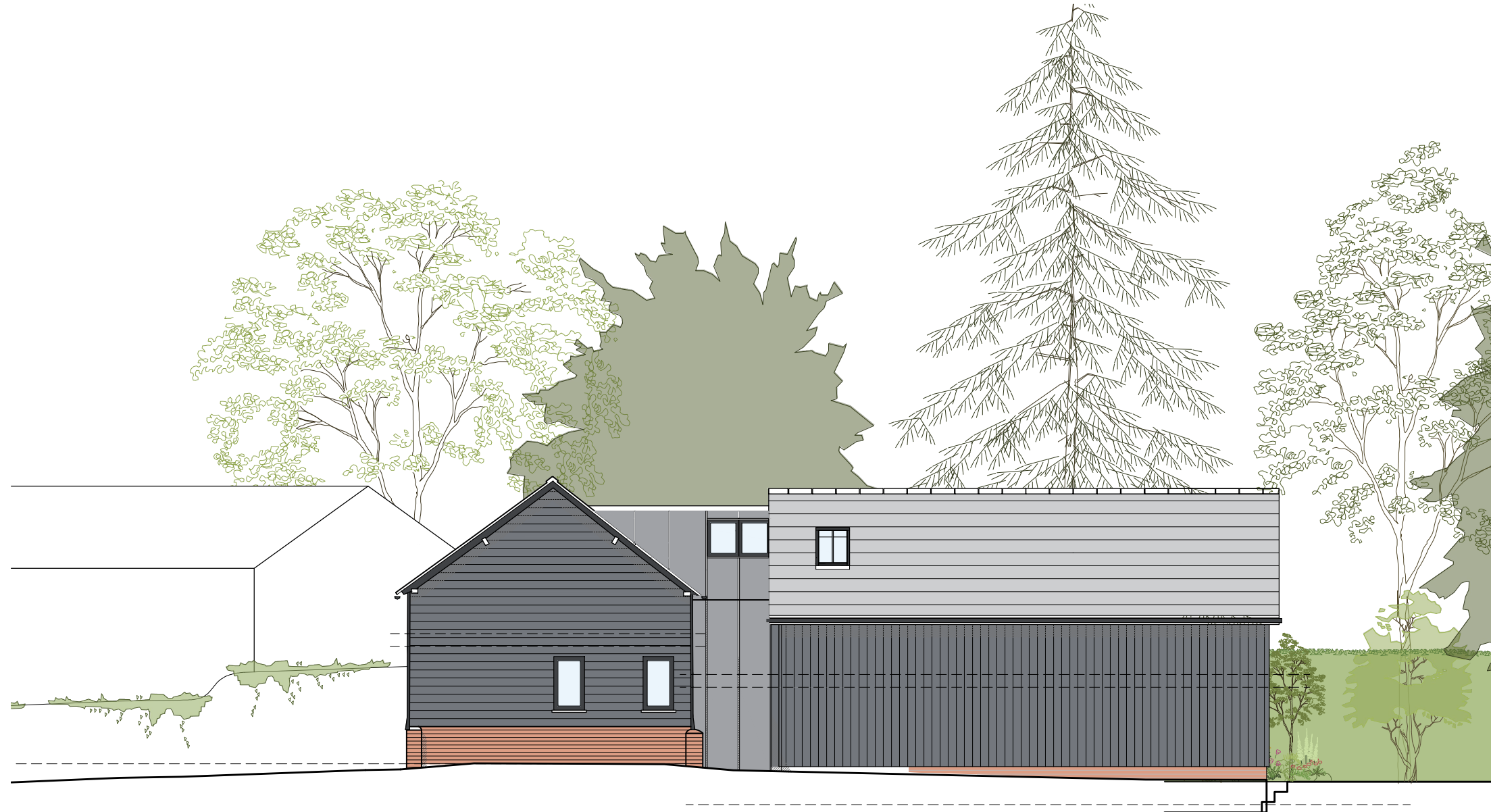
02 South East Elevation

This drawing is copyright and is not to be reproduced. The contractor will be held responsible for the accuracy of works involving the setting out and checking of all dimensions on the drawing and on site. Dimensions must not be scaled from this drawing.