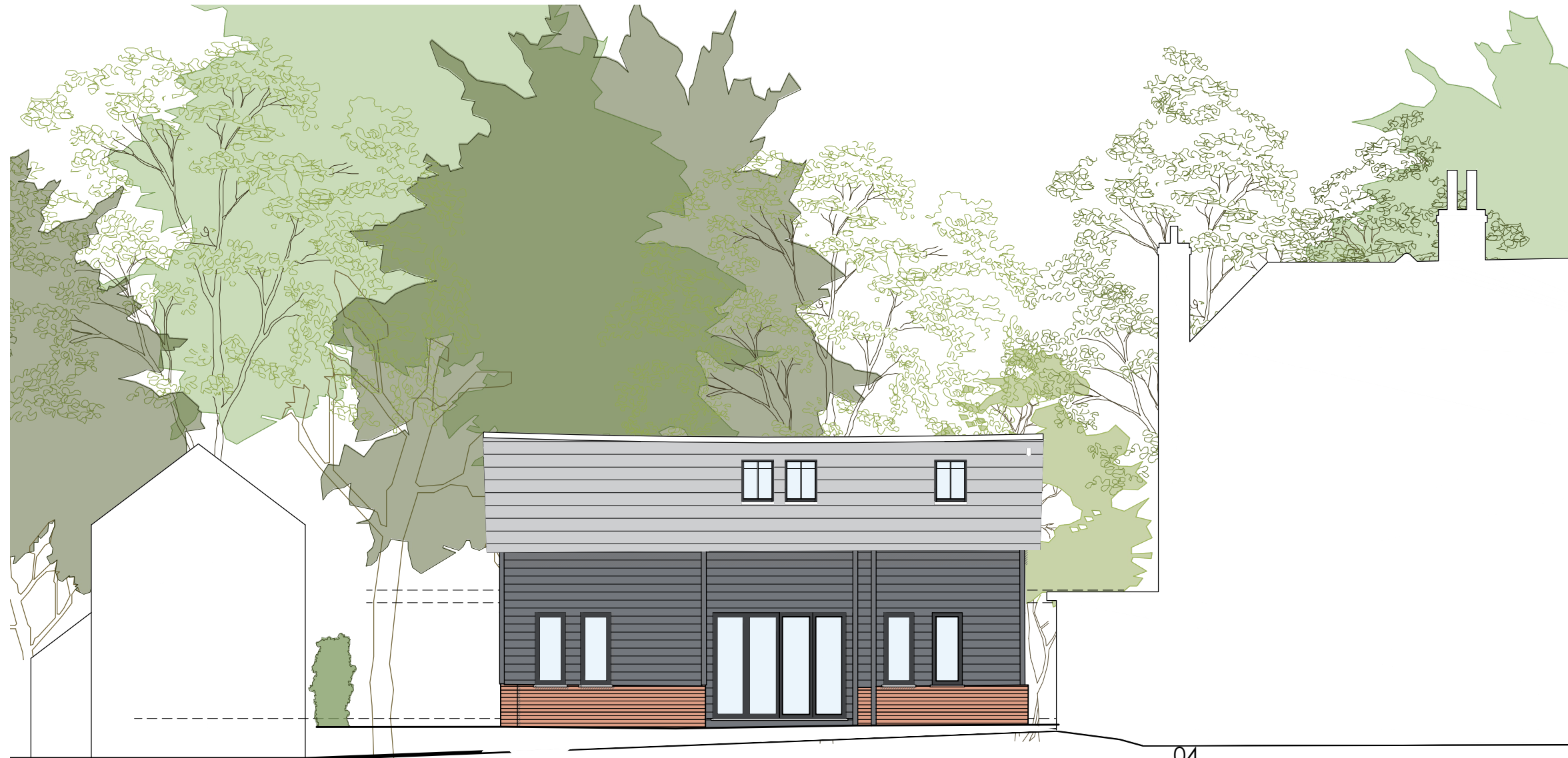
01 South West Elevation

This drawing is copyright and is not to be reproduced. The contractor will be held responsible for the accuracy of works involving the setting out and checking of all dimensions on the drawing and on site. Dimensions must not be scaled from this drawing.