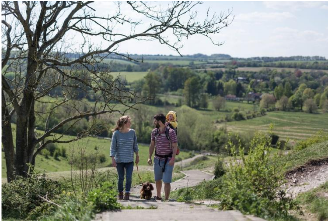
Family walks at St Catherine's Hill, Winchester