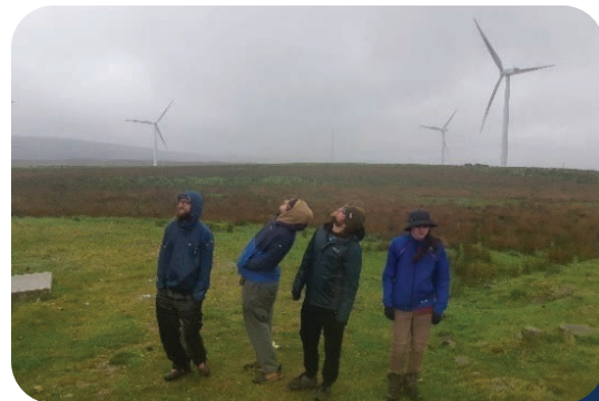
Figure 6 - Climate Challenge College, Visiting a wind farm