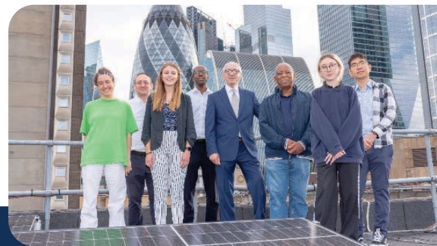
Figure 2 - Urban Sustainability Accelerator, ASP panel on the Middlesex Street Estate.

"We have recently completed the first rooftop solar project of our newest co-operative Aldgate Solar Power. We have secured grant funding from the Mayor of London and the City of London Corporation and taken out a loan from the Esmée Fairbairn Foundation to cover the remaining project costs. The solar panels were installed in April, and in August we completed a community share offer to pay back our loan and bring the solar panels into community ownership. The volunteers, Directors and our Community Champion worked together on the community