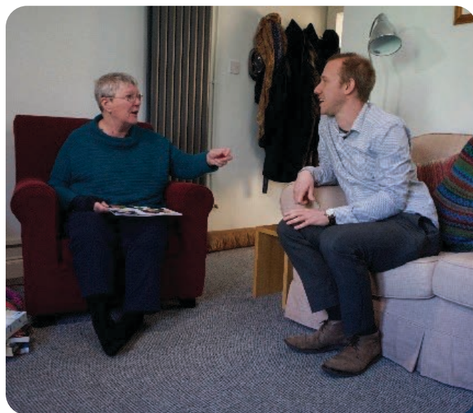
Figure 4 - Future Fit Homes, plan being delivered and explained to the client