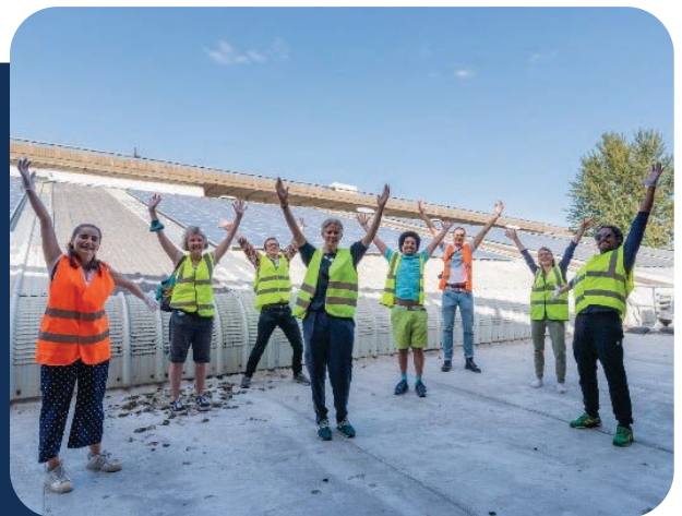
Figure 1: Urban Sustainability Accelerator NKCE celebrates a solar installation on the Westway Sports Centre.

More recently, significant increases in energy bills have highlighted the challenges of our dependence on global fossil fuel markets for power and heat; partly driven by energy supply shortages as countries recovered from the COVID-19 pandemic in late 2021/early 2022. This was exacerbated by renewable energy sources, such as wind and solar, producing less power and experiencing increased demand for heating