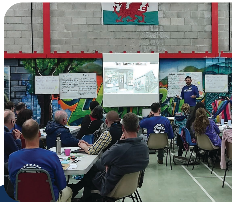
Figure 2 - GwyrddNi, Cyflwyniad Assembly

Once people had registered interest, the team made sure that there was representation from all facets of the community at the assemblies. This did not mean matching percentages of the population, since ethnic diversity in this area is low, and this would have resulted in less than one person on the assembly. As you cannot have part of a person, it meant ensuring there was someone to represent all communities, from refugees and asylum seekers to homeless people and those with poor health. They spent time figuring out how to make the assemblies accessible to all. In some cases, however, an individual may be the only representative of a group in their area, whether that individual was asked to be a representative was dependent on the relationship and the context.