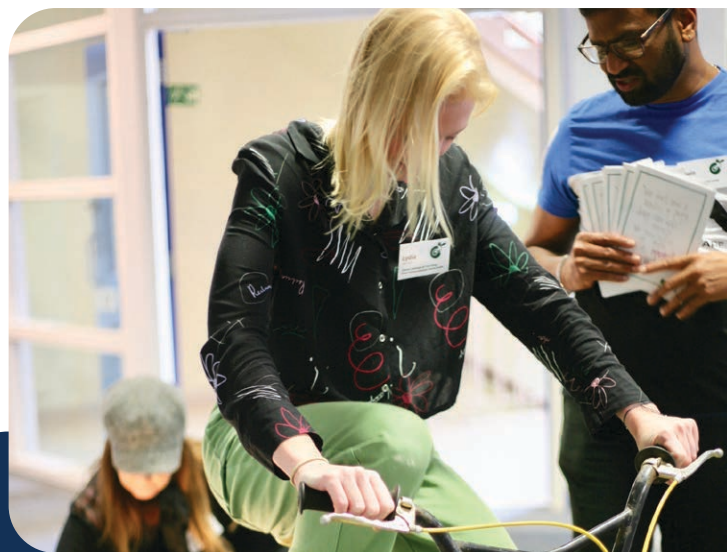
Figure 3: All 1 Collective and Lab workshop