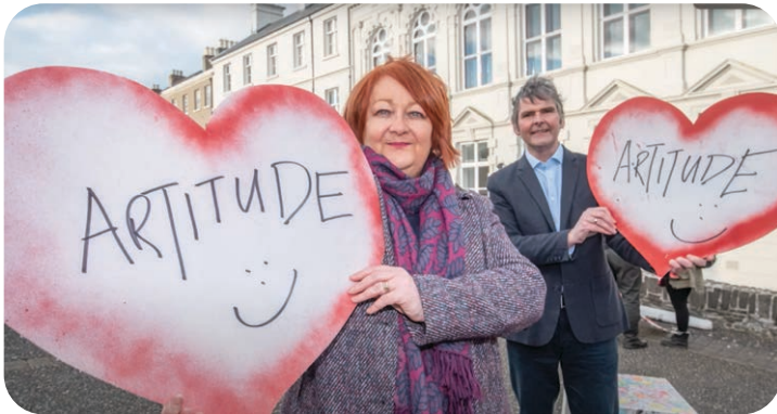
Figure 4 – Artitude, Climate, Culture, Circularity

Artitude: Climate, Culture, Circularity is a partnership involving The Derry Playhouse, Zero Waste Northwest, Northern Ireland Resources Network, Queens University Belfast and Derry/Londonderry City and Strabane District Council. The Partnership co-ordinates and delivers a programme of creative activities grounded in the circular economy, using the arts and creative practice to encourage behaviour change and challenge attitudes to waste, consumption, and climate action.