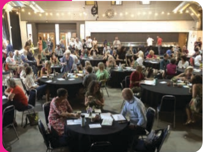
Figure 2 - Green and Healthy Frome, Health & Climate Conference, July 2022