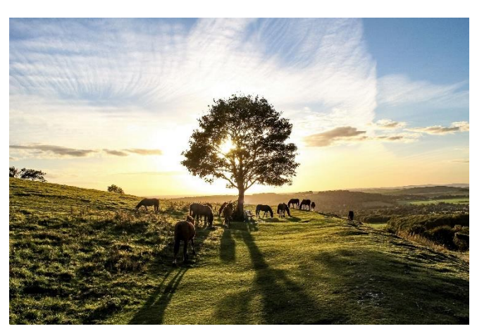
A picture of a tree at Cissbury Ring