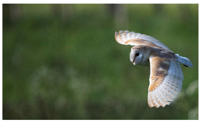
Grants of up to £25,000 can be applied for as part of a new funding initiative to help kickstart habitat creation for wildlife.

ReNature Grants will help projects that showcase positive management for nature in the community. Projects could creating wildflower meadows, heathland, hedgerow, areas managed as chalk grassland, more natural rivers or dewponds.