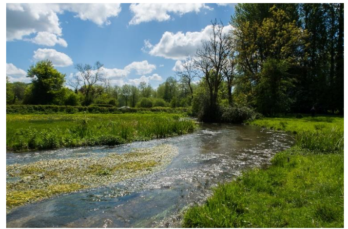
The South Downs is internationally-renowned for its quintessentially English countryside, pretty chocolatebox villages, flower-rich chalk grasslands and stunning white cliffs.

Perhaps less known are the network of rivers and streams that crisscross this amazing landscape – yet they really are the beating heart of a complex ecosystem that relies on flowing freshwater!