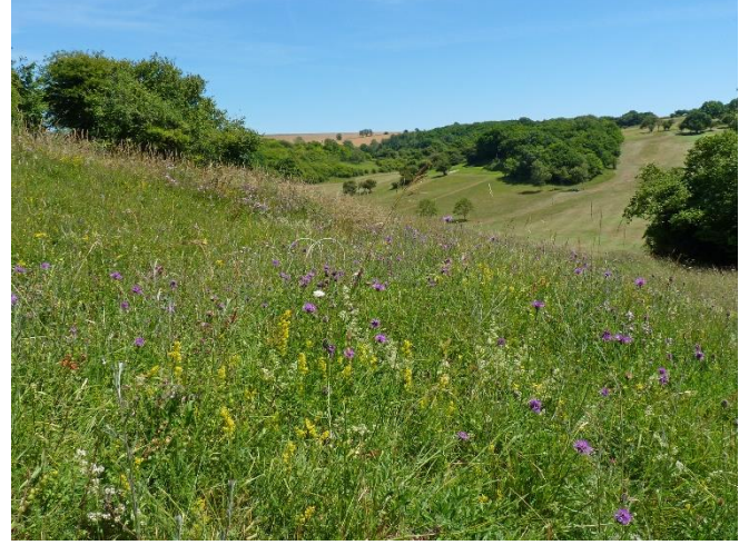
Pyecombe Golf Club is one of the best courses in the UK for butterflies and chalk grassland flowers, new research has found.

Consultant ecologist Neil Hulme performed three detailed surveys of the course and found an impressive total of 34 species of butterfly, including rare species such as the Adonis Blue, Brown Hairstreak and Grizzled Skipper.