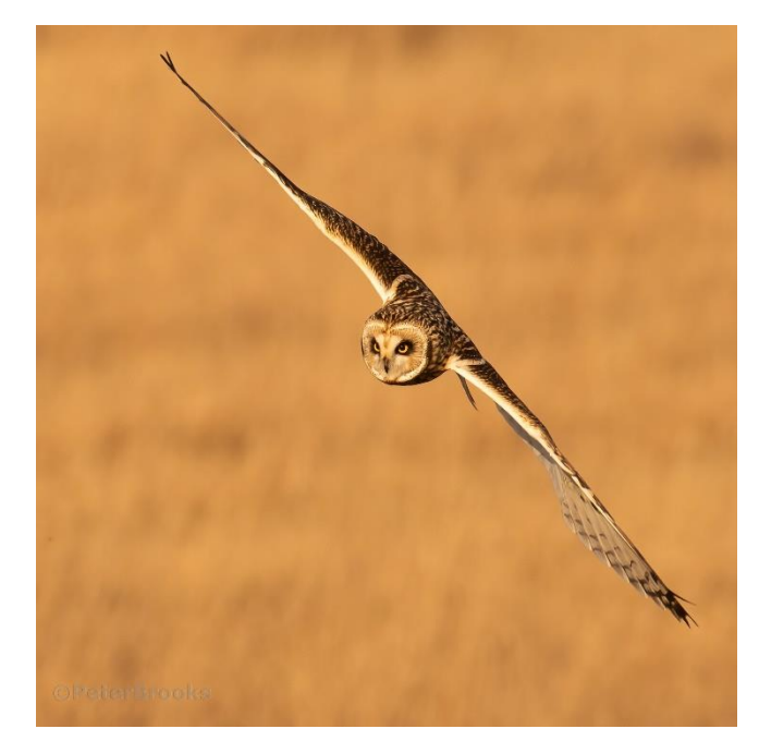
A short-eared owl at Seven Sisters Country Park

"There are fewer of them and they are found in fewer places.