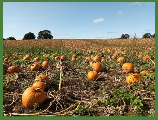
Pumpkins in the field at Rogate, West Sussex

Please follow the links as booking may be necessary. Find these and more events across the National Park and submit your own events at <u>southdowns.gov.uk/events/</u>