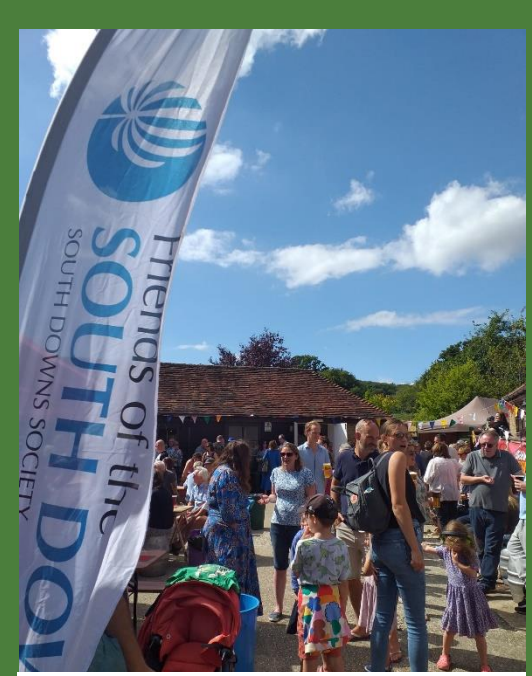
The popular Live at Langhams returns

Please follow the links as booking may be necessary. Find these and more events across the National Park and submit your own events at <u>southdowns.gov.uk/events/</u>