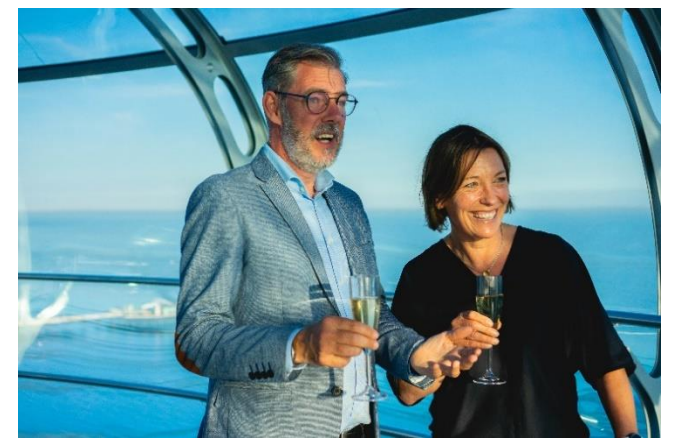
Where can you enjoy panoramic views of the South Downs from 450ft?

It's the Brighton i360 Viewing Tower, of course!