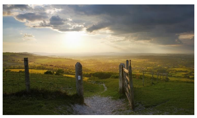
A stormy Steyning Bowl

Find out more and submit your entry at <a href="http://www.southdowns.gov.uk/care-for/photo-comp-2023/">www.southdowns.gov.uk/care-for/photo-comp-2023/</a>