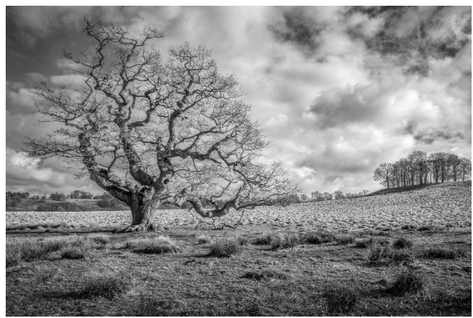
An incredible shot by Bill Brooks of Capability Brown-designed grounds at Petworth Park