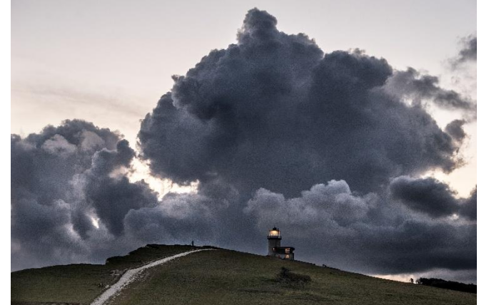
"I Wandered Lonely as a Cloud" by Gavin Parrott, capturing Belle Tout lighthouse under a rising storm cloud