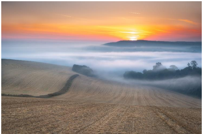
Cloud inversion over the Arun Valley by Lloyd Lane