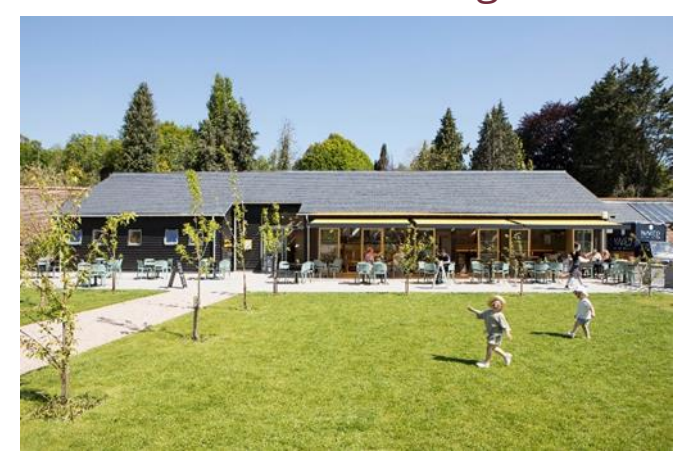
One Garden Brighton, winner of last year's South Downs Award