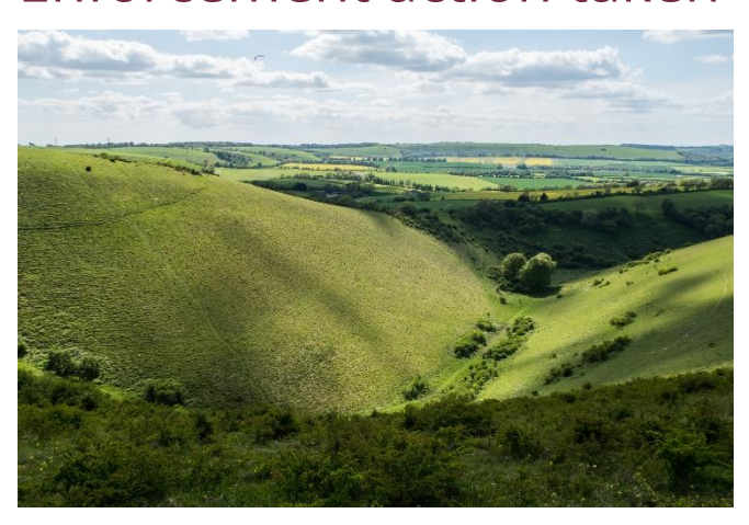
Butser Hill in East Hampshire

An alpaca farmer has been ordered to remove his mobile home from a sensitive site in the South Downs National Park after a protracted legal battle with East Hampshire's Planning Enforcement team.