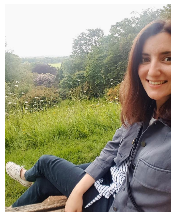
Three words that sum up your job in planning?