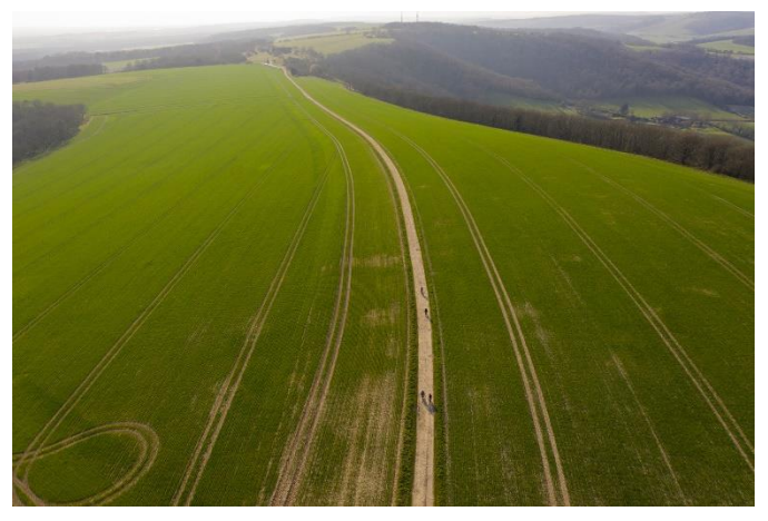
The South Downs Way near Amberley in West Sussex