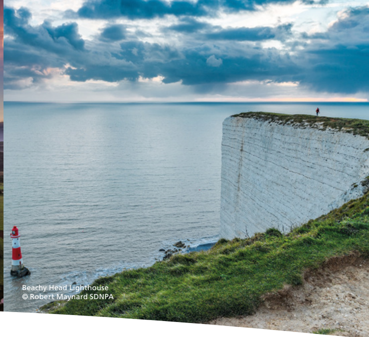
Beachy Head Lighthouse