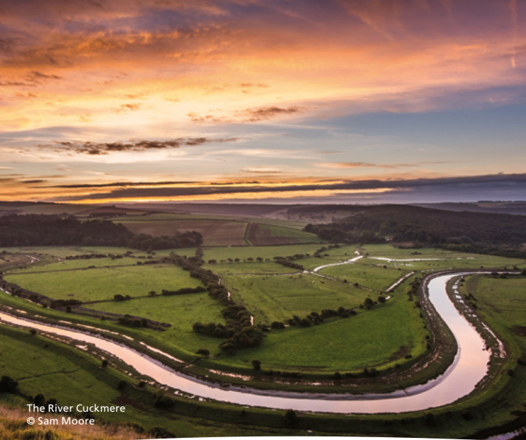
The River Cuckmere © Sam Moore