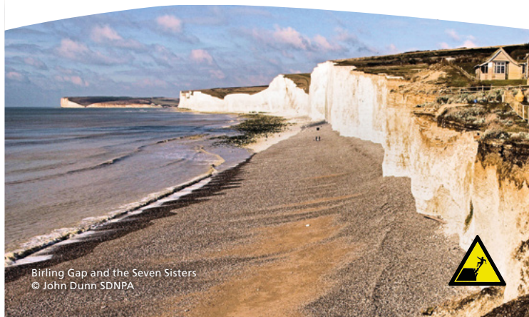
Birling Gap and the Seven Sisters

If you see anyone in danger or witness someone who has fallen do not to attempt to rescue them. Dial 999 and ask for the Coastguard.