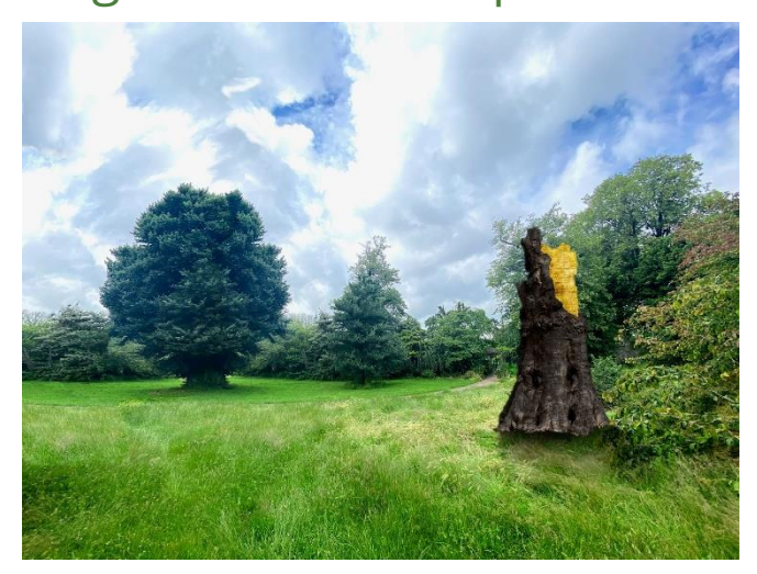
An artist's impression of the Gilded Elm