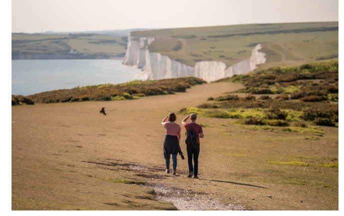
With the Easter holidays on the horizon, people are being reminded of the dangers of cliff falls on the East Sussex coast.

Without warning, large chunks of chalk cliff can fall hundreds of feet to the ground below, and, if you're on the edge, you'll be in danger.