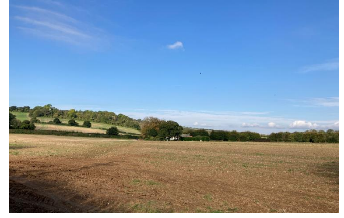
A picturesque view of the National Park has been restored thanks to the undergrounding of electricity infrastructure.

The £150,000 programme of works by Scottish and Southern Electricity Networks (SSEN), which started in late summer of last year, has been completed and restores an historic view from the medieval Hampshire market town of Bishop's Waltham (before view below).