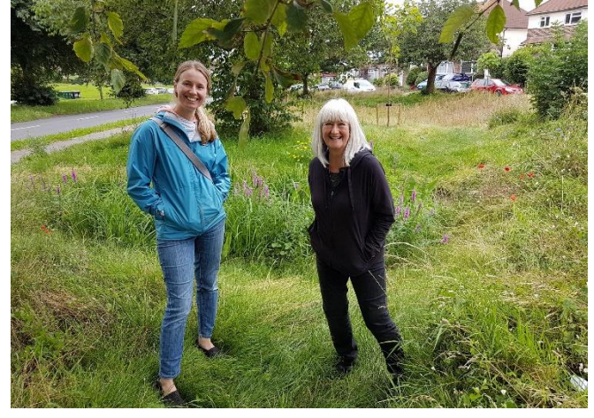
Hundreds of rain gardens to help protect the South Downs aquifer around Brighton and encourage wildlife are set to be created as part of a new initiative.

The theme for World Water Day on 22 March was groundwater and The Aquifer Partnership (TAP) launched a major campaign to create as many rain gardens as possible across the Brighton, Hove and Lewes area by 2025.