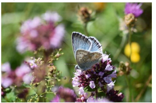
A chalkhill blue butterfly

The hill is internationally important for its ground-hugging plant communities, including mosses, liverworts, and lichens and also for its chalk grassland plants, such as cowslips, which provide food for caterpillars that later metamorphose into butterflies.