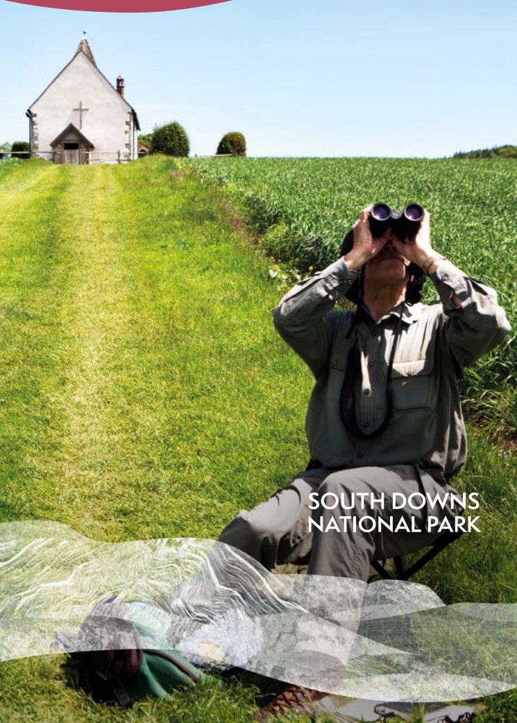
SOUTH DOWNS NATIONAL PARK