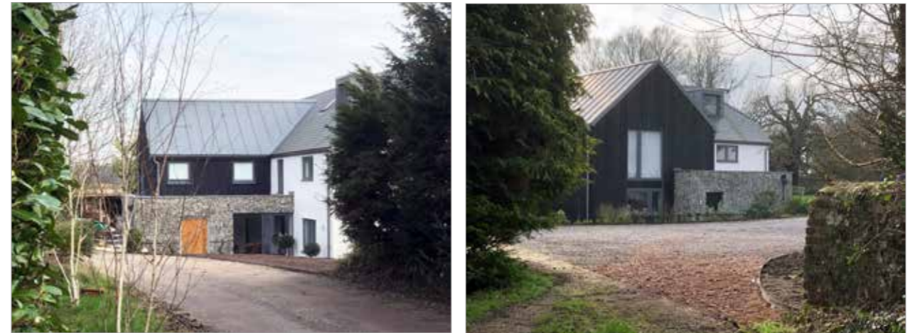
Above: Old Rushmere by Rushmere Pond. This contemporary dwelling is built around what were probably farm workers' cottages in the grounds of a Tudor farmhouse that stood nearby until the end of the nineteenth century.

Beyond Speltham Hill the house known as Old Rushmere has been almost completely re-built in a contemporary style (2019), retaining an old core which is not visible from the public highway.