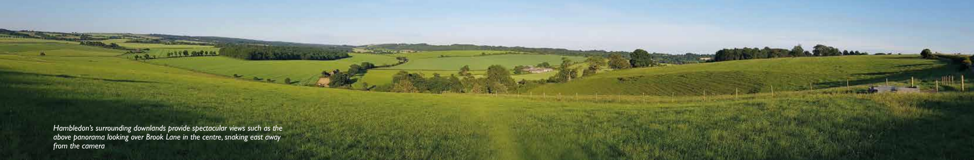
Hambleton's surrounding downlands provide spectacular views such as the above panorama looking over Brook Lane in the centre, snaking east away from the camera