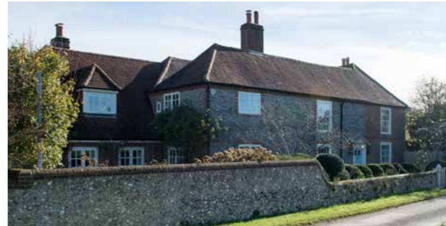
Left: Lower Chidden view looking southeast.

Not strictly agricultural but heavily dependent on agriculture, and in that sense part of the same industry, are malshouses and breweries. Mornington House had a malthouse and the house called The Malthouse nearby (plain workman-like Georgian) is what it says it is. Orchard House in West Street is a brewery reworked in the vernacular domestic half-timbered style. Both styles are familiar in the Hambledon townscape.