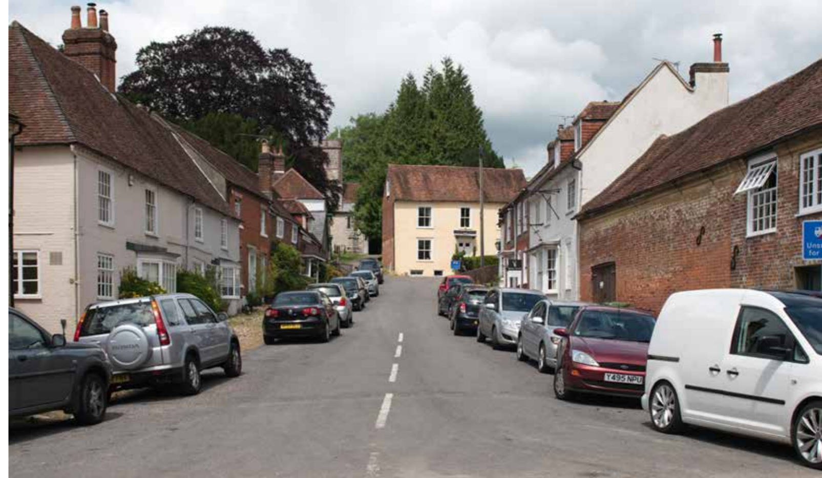
Above: High Street looking north towards the church of St Peter and St Paul

There are a few wrought iron lamp brackets (presumably for oil lamps) still to be seen in the village but these have long been out of use. Thirty years ago there was a single light on the pedestrian refuge at the Green Man junction. That gave way to an illuminated bollard which in turn gave way to a pair of unlit, reflective bollards. Finally these have been removed along with the pedestrian refuge itself. In many ways this progression is representative of the wish to achieve a simpler, timeless ambience to the village which drives this village design statement. Today the village has no street lighting and there is a strong desire to keep it that way. [HVDG52]