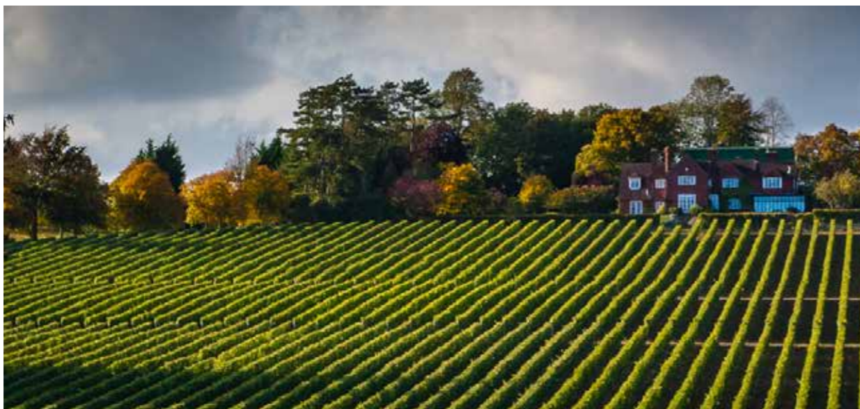
Top left: Hambledon’s rural character is well served by the lanes that surround it