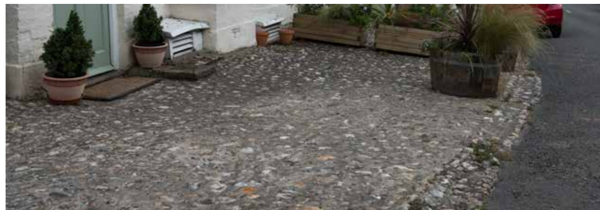
Top: flint cobbled road margin, High Street

Hambledon is a dry valley bottom village and the main route through the village is characteristic of the wider landscape, running along the valley