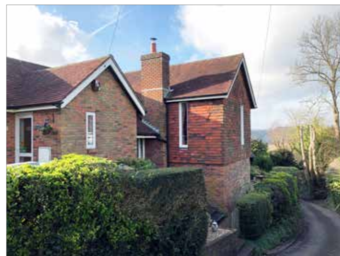
Below and opposite bottom right: Oldfield House and Homelands display a variety of rooflines and gables, breaking up the mass of the buildings to give them a less monolithic feel than would otherwise be the case.

the new space has a thoroughly modern sculptural quality. It is planned that it will be complemented in due course by a new stairway in a matching style which will be an important feature in the church for the long term.