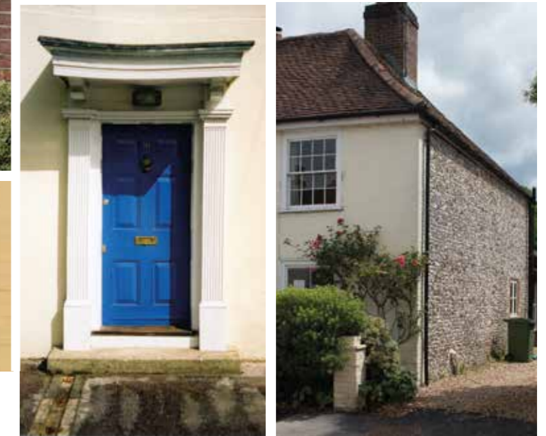
Below left: Georgian doorway, East Street Below right: Brick frontage and flint side elevation, East Street Bottom: Flint wall with brick coping

In East Street and the High Street sliding sash windows predominate, usually with small panes in eight-over-eight or six-over-six pattern. These are often a later insertion, sometimes when a Georgian facade has been added to a timber-framed building. There is a small cluster of ground floor oriel windows with two double sashes in each. Elsewhere timber casements are the norm, typically one fixed and one side-hung and having two panes each. Occasionally a triple or even quadruple casement window is seen, usually indicating previous use as a shop. There are several good quality Georgian door cases, and a number of four or six-panelled doors of the same date. Typically, this is where a house also has Georgian sash windows; elsewhere the doors tend to be planked. [HVDG28] [HVDG29] [HVDG30] [HVDG31]