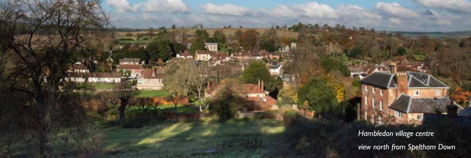
Hambledon village centre view north from Speltham Down