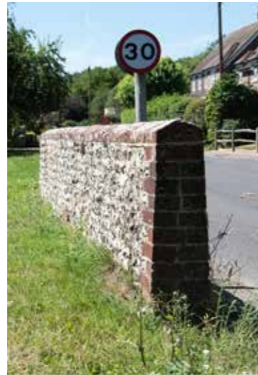
Left: Flint and brick wall Old Barn Crescent – good repair showing tapering profile of flint wall