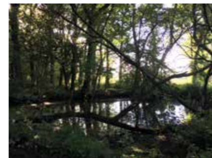
Bottom: Chidden Pond photographed around 1910 giving an idea of the size and importance of the ponds to the rural community