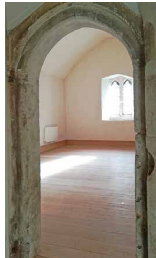
Left: the newly-created room above the south porch of the church.

All that said, there are examples within the village where the contemporary ethos has been making itself felt. For one, the Village Hall was built in the early 1980's to a somewhat utilitarian design that no doubt reflected cost constraints. It has however proved a popular facility which is extremely flexible and well used. It does not violate the village-scape. For another, a new modern space has been created in the village church by re-instating the upper floor of the 14th century south porch. Traditional materials (much oak, lime plaster) have been used, but in a contemporary way, and