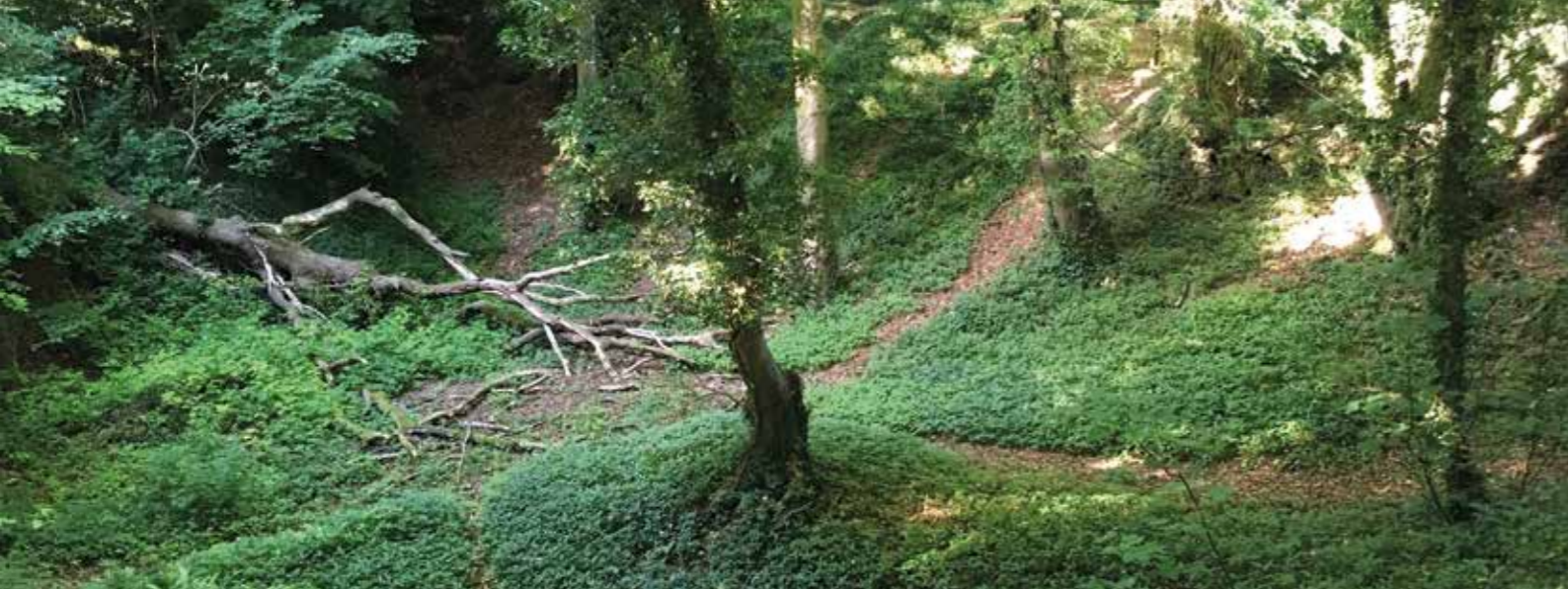
Above: remains of a flint quarry in Lithey's Hanger