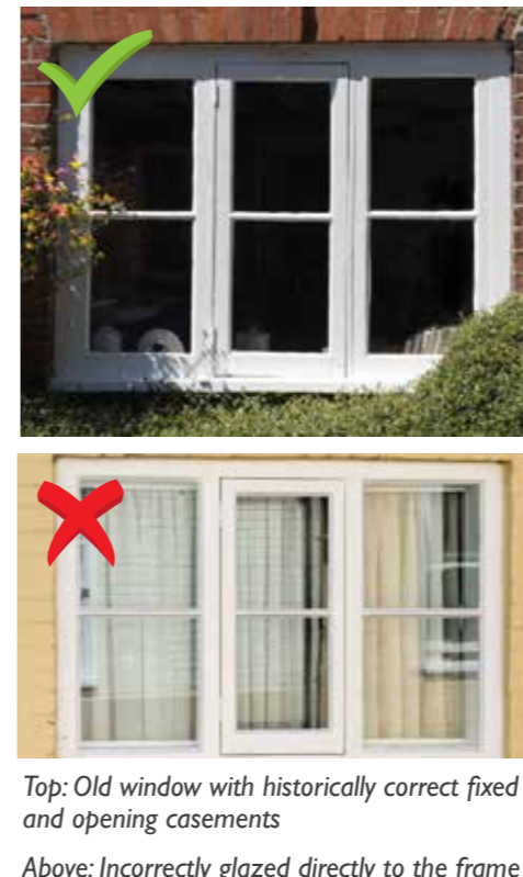
Top: Old window with historically correct fixed and opening casements Above: Incorrectly glazed directly to the frame

There is some limited use of thatch in the village, which traditionally would have been long straw, and rather more examples of slate roofing. Otherwise the use of handmade clay tiles is almost universal; some of it replacing earlier thatch. These provide the steeply pitched, undulating roofs which characterise the parish. Some have half or full hips where they do not adjoin another building. There are a few examples of dormers, which are small and traditionally detailed with tiled cheeks and hipped, tiled roofs. [HVDG21] [HVDG22]