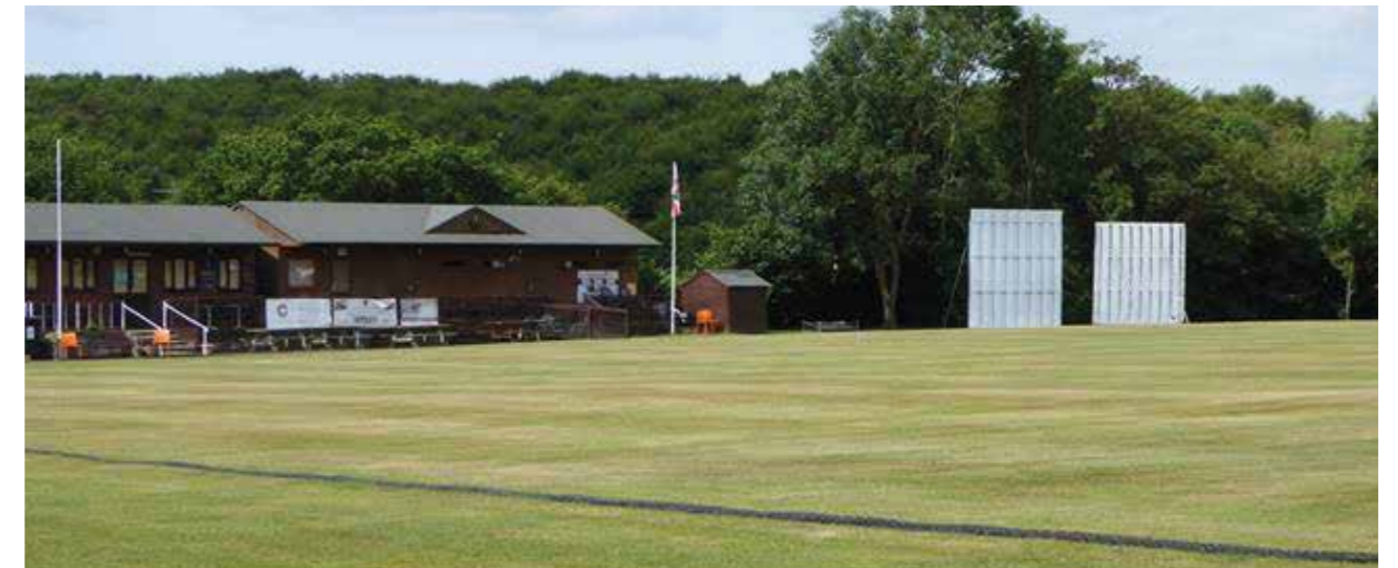
Above: Ridge Meadow on Brook Lane is the current home of Hambledon Cricket Club

Around Hambledon, and partly attributable to geology, land is of Grade 3 and 4 agricultural quality and the large open downland fields are typically used to grow arable crops. Further down slope and in the valley bottom land is more typically used for grazing, often dairy cattle or sheep. A vineyard is located on the eastern margin of the village, planted in 1952 – prior to which it was recorded on historic maps as ‘allotment gardens’.