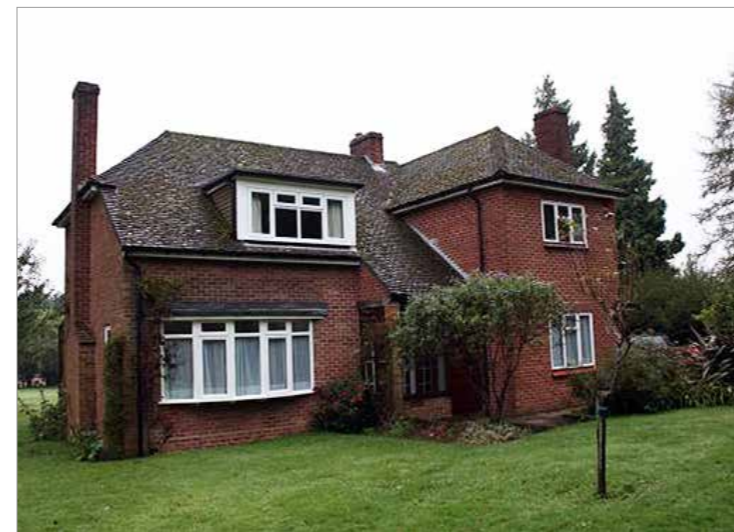
Below: Homelands before and after renovation and extension in 2018. The chimney on the left and the cat slide roof allow one to appreciate how the old building has been absorbed into the new."

At the top of Cams Hill, Homelands is an early twentieth century house built on farmland prior to the 1948 planning act. It was an unremarkable brick building which did not seem at ease in the landscape. It has been extended very recently and re-faced in a contemporary manner which sits more easily in its location. [HVDG49]