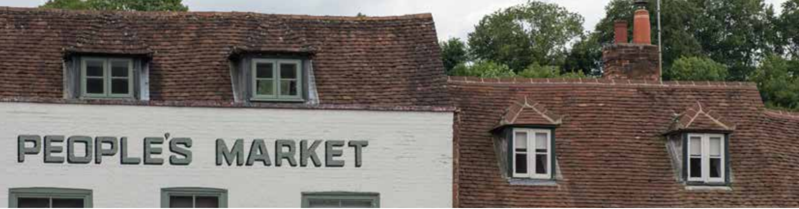
The People's Market has been in place at the centre of the village and its life since the second half of 19th century, remaining a bustling grocers and general store