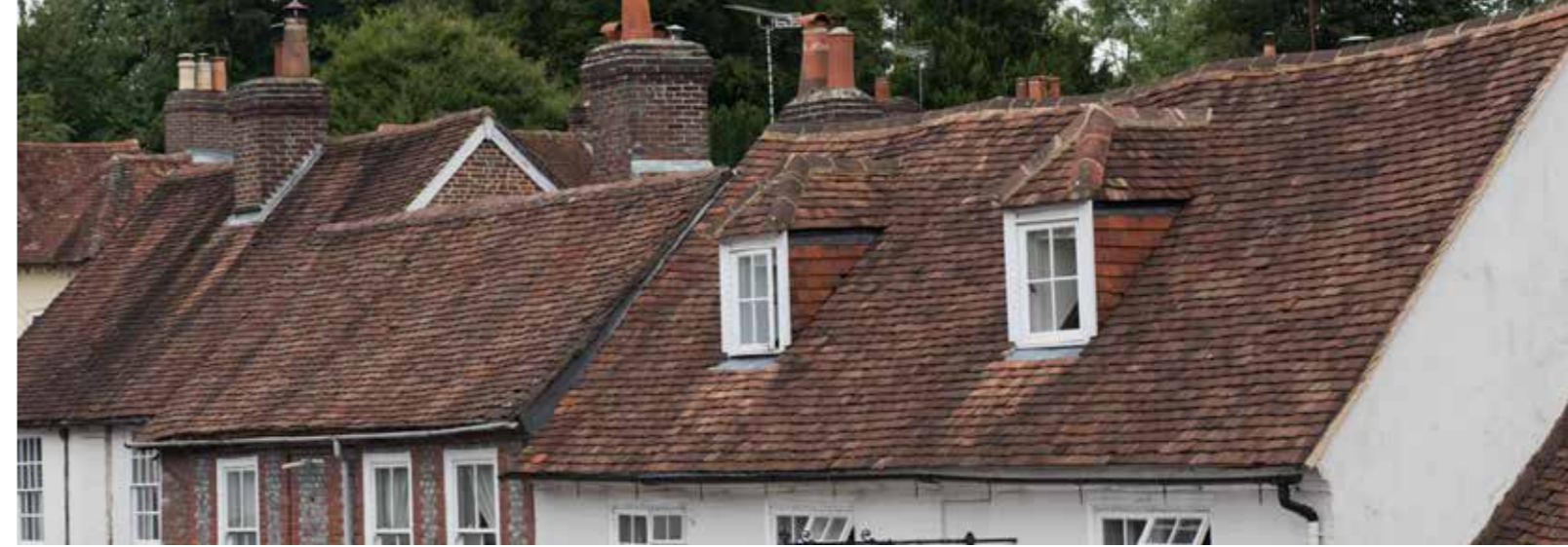
Top: Roof line of houses on the east side of High Street

City Council Local Plan was first drawn up in 1989. This gave the village a tightly drawn development boundary, but it nevertheless allowed considerable scope with around 70 new dwellings and conversions taking place over the next 25 years or so. The last major development took place when Hartridges Soft Drinks Factory was replaced by The Maltings, a small housing estate of 28 homes; half of the area being outside of Winchester City Councils Local Plan settlement policy boundary. [HVDG39] [HVDG40] [HVDG48]