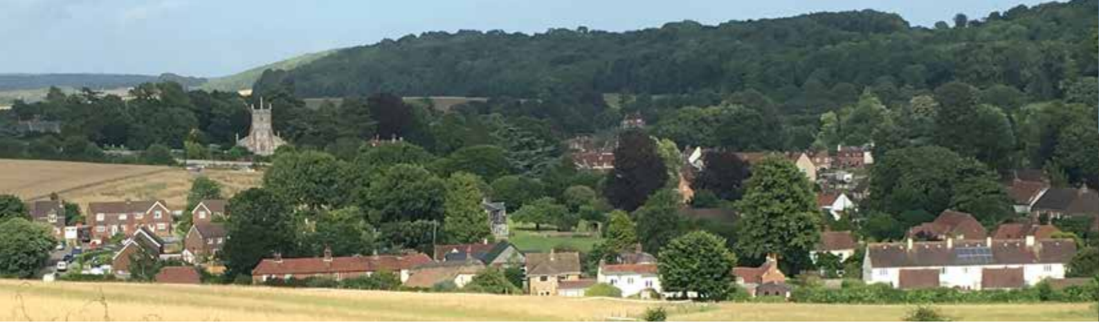
View from Boarhuts Copse looking east over Green Lane and Stewarts Green towards the church in the distance