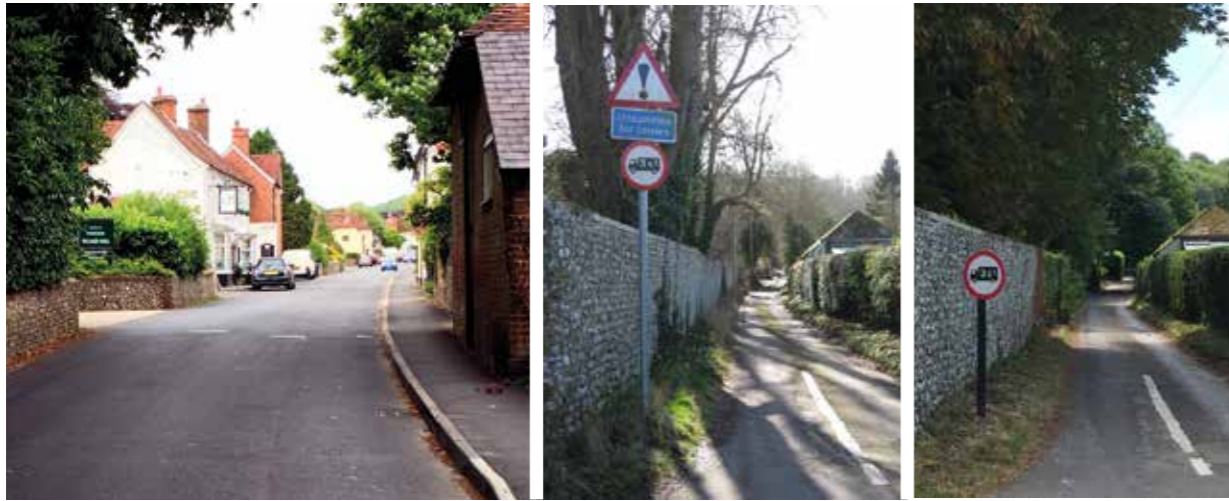
Above left: West Street by the Village Hall and The Vine to the left showing the absence of road lining