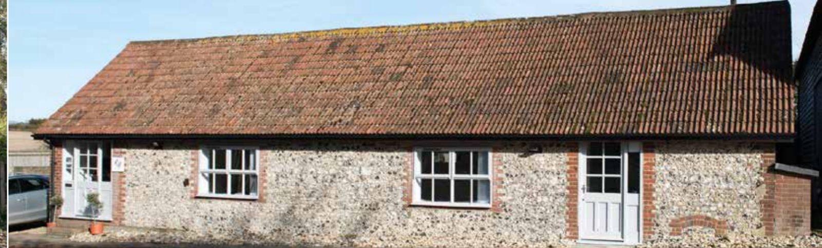
Above left: Former Pigeon Loft, Chidden