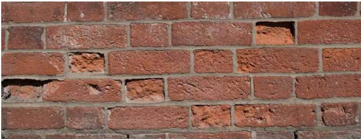
Below: Brickwork – damage from re-pointing with Portland cement mortar in place of the original lime mortar

Many flint walls have a coping course of brick, usually a simple ridged shape though The Cottage in West Street has an unusually elaborate design. Occasionally brick is used as the only material, for example on Speltham Hill just south of George House. Wall heights vary from around one metre at Manor Farm to over two metres at the northern end of Vicarage Lane. A few cast iron railings can be seen, such as the ones outside Myrtle Bank in East Street, where they are set into a stone coping on a brick plinth wall in the traditional manner. [HVDG18] [HVDG27]