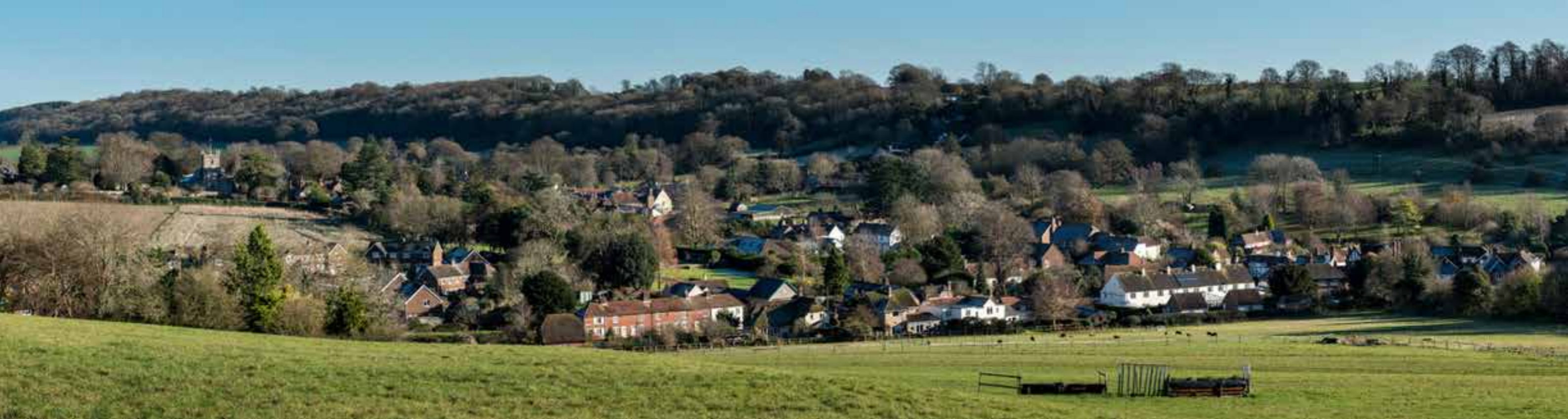
Hambledon from the West. Green Lane and its houses lie in the middle distance.