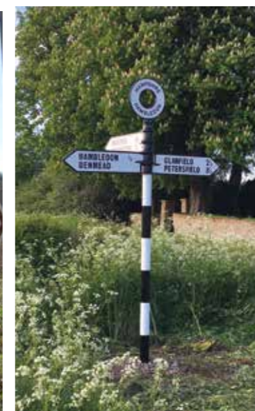
Left: Modern and traditional style signposts at the junction of East Street and Brook Lane. The traditional (black and white) fingerpost offers a considerable enhancement