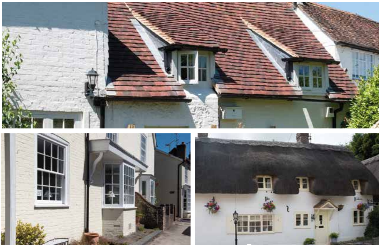
Top: Dormer windows on Green Lane Top and above left: Approved slimline double glazing in listed buildings. Above left: Sliding sash and bay windows on East Street Above right: Thatched cottage, Rosemead

Ridge lines generally run parallel to the frontage with steeply pitched roofs and large brick stacks, many of which are topped by distinctive chimney pots known as “Fareham Reds”. Two storeys is the norm, although several houses in East Street and the High Street have gables to the rear with a third, attic storey. A few, particularly clustered near the centre, indicate a third storey by dormer windows in the front roof slopes. Traditional materials and building methods predominate. [HVDG19] [HVDG20] [HVDG22] [HVDG23] [HVDG25] [HVDG42] [HVDG43] [HVDG44] [HVDG45] [HVDG49]