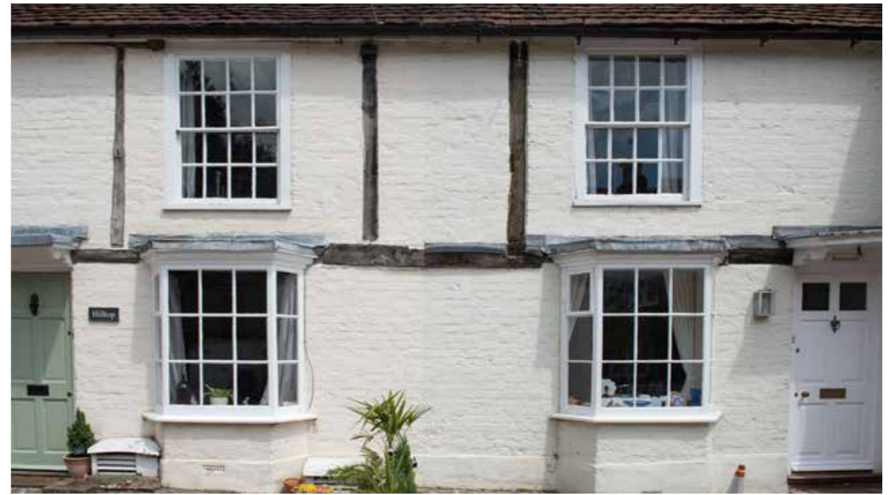
Well-preserved frontage in High Street

HVDG27 Boundary walls should match existing or nearby walls in style and construction, including the details of battering and coping.