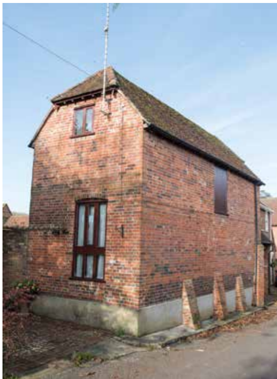
Top: Manor Farm view from West Street looking south Middle: and looking east.