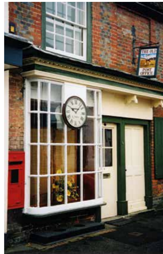
Top: The Old Post Office, West Street

In 1970 Hampshire County Council designated the centre of the village a Conservation Area; this was greatly extended in 2012 to include most of the village. The Winchester