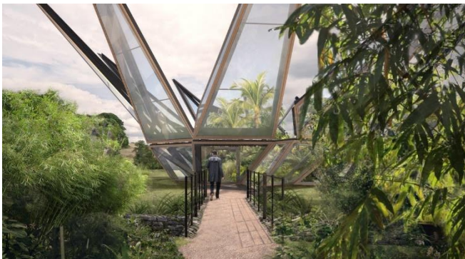
Artist's impression of the approved glasshouse and gardens at Woolbeding, National Trust

As anyone involved in creative design knows, while codes, storybooks and design parameters set a framework, it's through iterative work, often engaging with local communities, that many truly inspiring works are created.