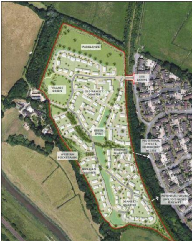
The Design Brief masterplan for Old Malling Farm at Lewes.

Moving forward, the Design Brief will be an important consideration in the determination of any planning applications at the site.