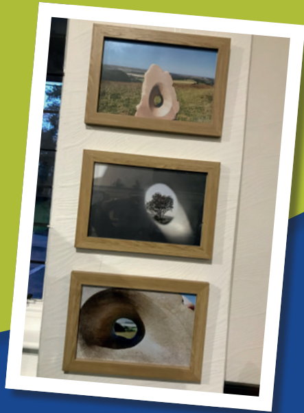
Artscape Project 2019