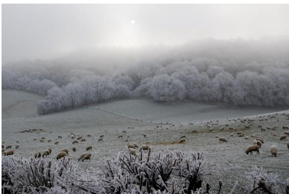
Sheep grazing on the north slope of the South Downs at Ditchling.

https://southdownsnationalparkauthority.adventcalendar.com/