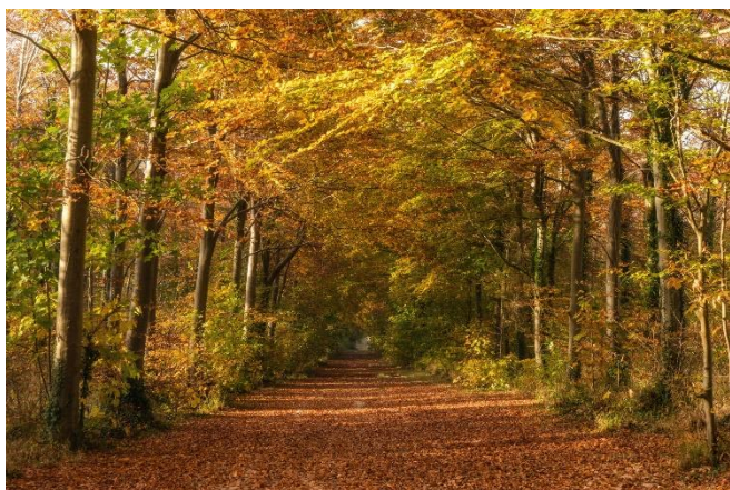
Friston Forest in the autumn

This expansive beech woodland makes a perfect family trip out for those who love exploring the countryside. With walking and cycling trails, great views of the Cuckmere and the sweeping South Downs, Friston Forest has something for everyone!