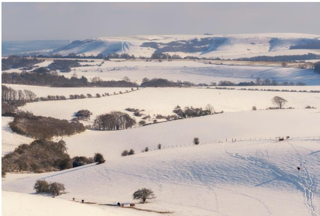
Ditchling Beacon

The first day of December will see the return of our popular Advent Calendar quiz – and we have some great prizes on offer!