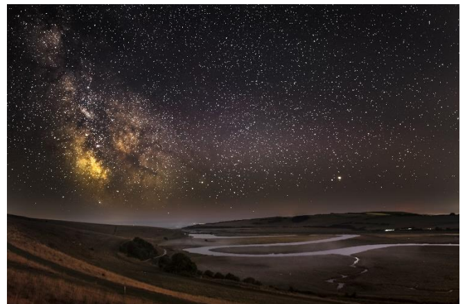
The Milky Way over the Cuckmere by Jamie Fielding

The South Downs Dark Skyscapes category must be taken in the South Downs, but there is no geographical limit on the two other categories and it's hoped people living in towns and cities around the National Park will take part.