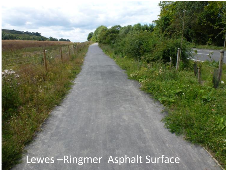
Lewes –Ringmer Asphalt Surface