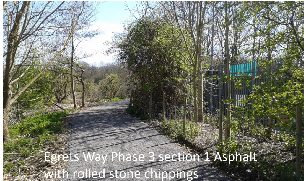
Egrets Way Phase 3 section 1 Asphalt with rolled stone chippings