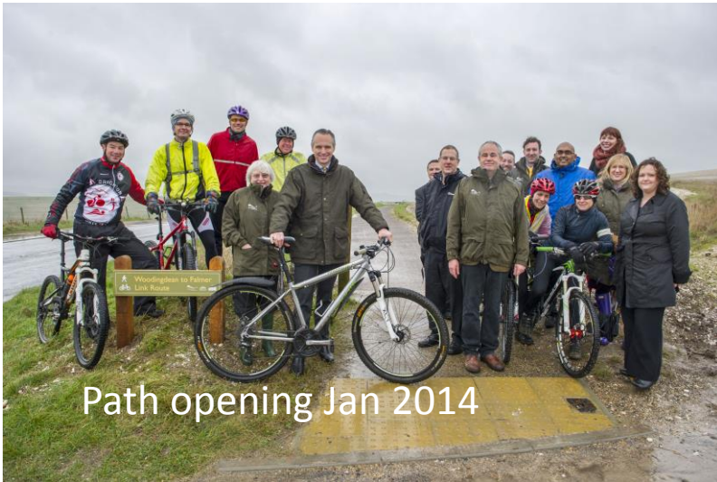
Path opening Jan 2014