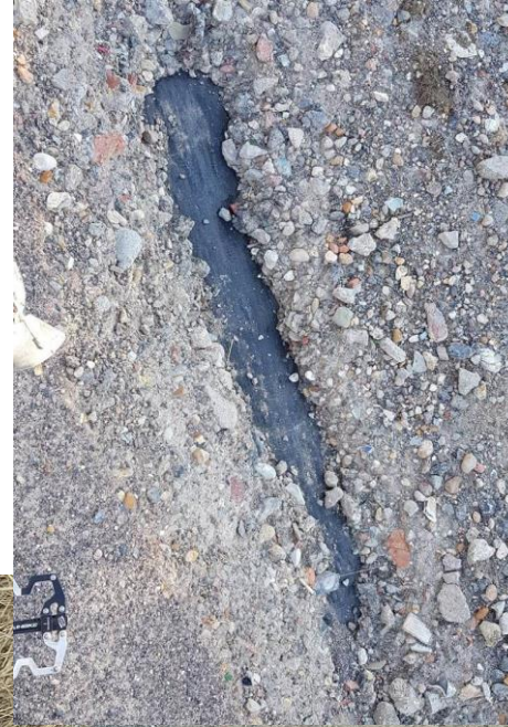
Surface with exposed sub base July 2019