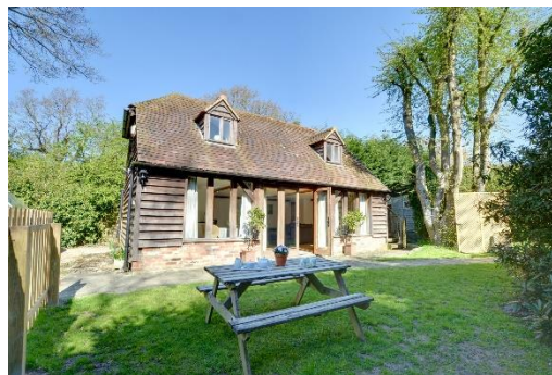
A £300 voucher with Best of Brighton Holiday Lettings will be won on 23 November

Each ticket has a 1 in 50 chance to win a prize each week.