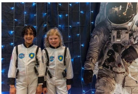
The National Park's Dark Skies Festival 2019 engaged with a record number of young people

www.gov.uk/government/publications/designated-landscapes-national-parks-and-aonbs-2018-review