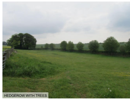
HEDGEROW WITH TREES