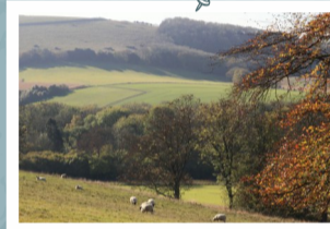
Old Winchester Hill