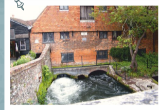
City Mill Start of the South Downs Way

True to its name, the South Downs Rambler takes the scenic route from Winchester to Petersfield and back again via the