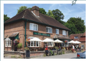
"The Shoe" at Exton