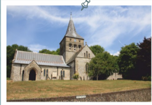
All Saints church at East Meon