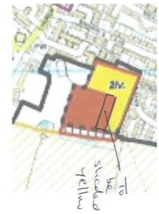
In a) Replace "some" with "At least"