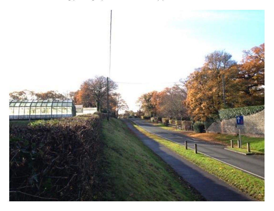
Image A – from north corner of the site, on raised bank, on Petersfield Rd, looking south. The site is on higher ground than the road, and is 'open' in character along this side, with only a hedge along this boundary and no mature trees at this end. The greenhouses do not extend to the northern edge of the site. Single storey greenhouses are an agricultural use, and form a typical view in rural areas.

Please see following photographs to illustrate my points;