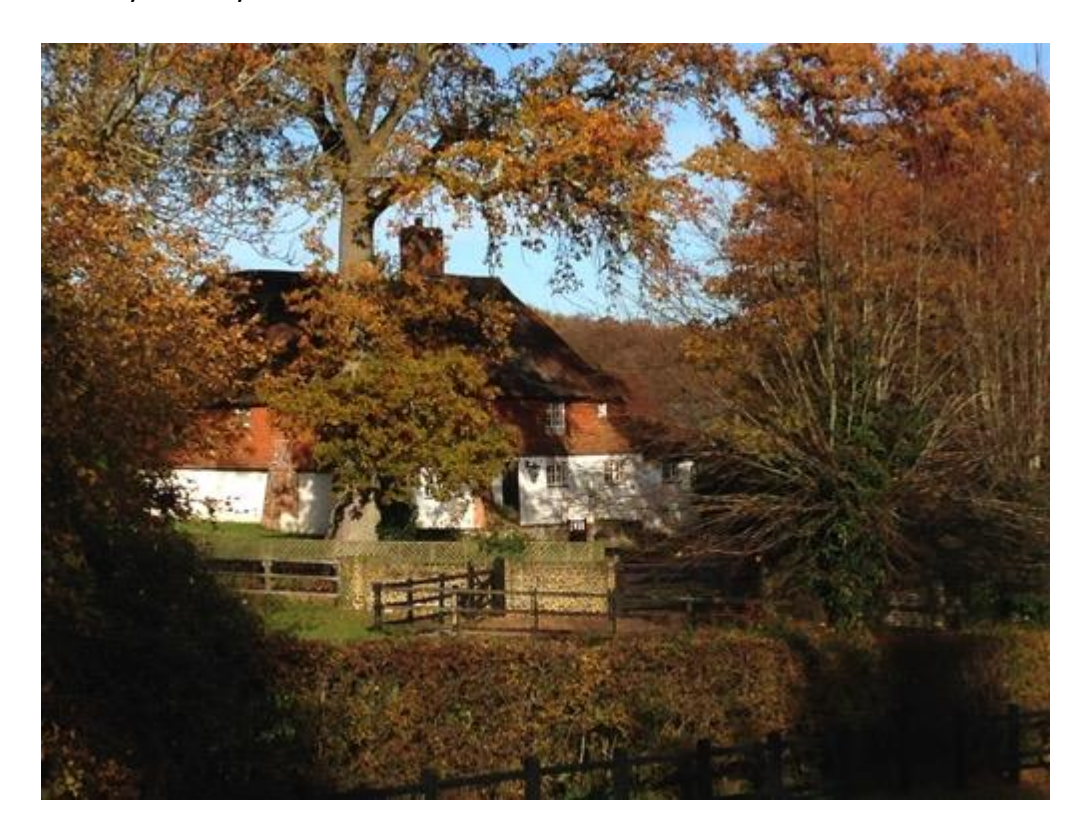
Image C shows Deal Farm (grade II listed) set in its own grounds, surrounded by farmland, directly opposite the site.