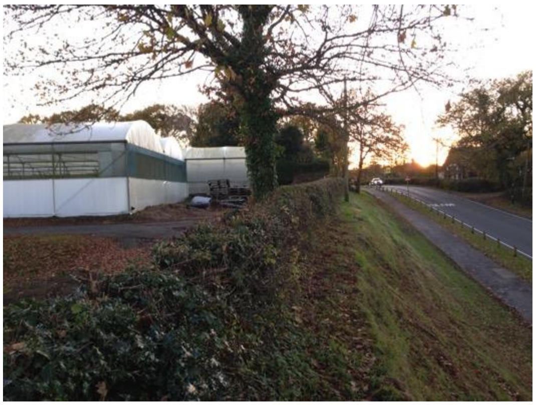
View into site from north along Petersfield Road, showing lower level of road, and temporary polly tunnels. Note single tree and low hedge along boundary.