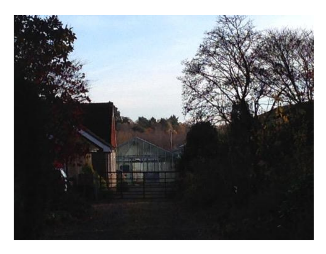
Image F - From the driveway into the site (Liss Nurseries), showing the bungalow on the left, and greenhouses ahead. This view looks east and Longmoor Inclosure can be seen in the distance beyond the greenhouse roof.