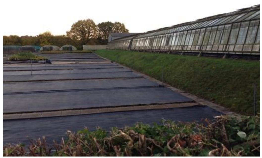
Interior of site at lower level, showing 'open' character of site with varying land levels. See black plastic sheeting for plants, and single storey greenhouses – a typical agriculture use. This is NOT previously developed land.