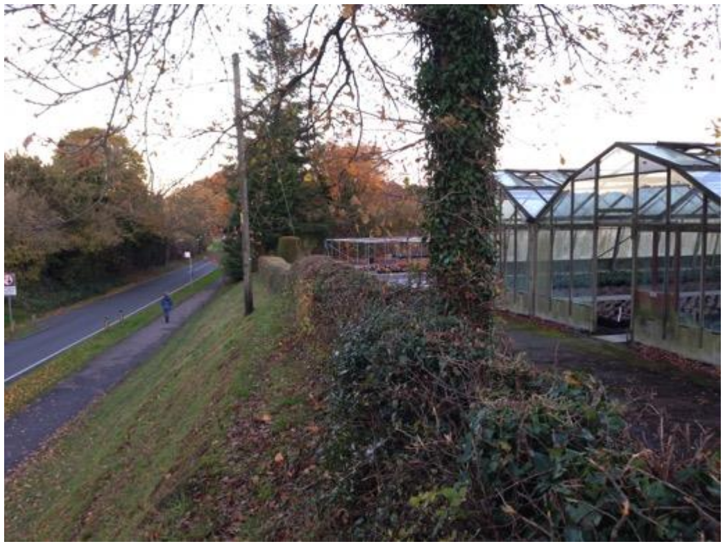
From southwest corner along Petersfield Road, showing single storey greenhouses and how land falls away down to the road level.