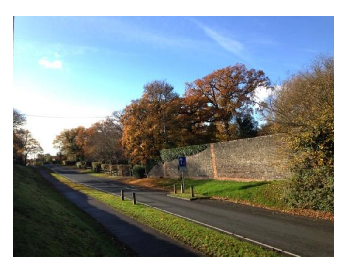
Image D - looking south along Petersfield Rd, shows fine local ironstone listed boundary wall to Deal Farm, directly opposite the site.