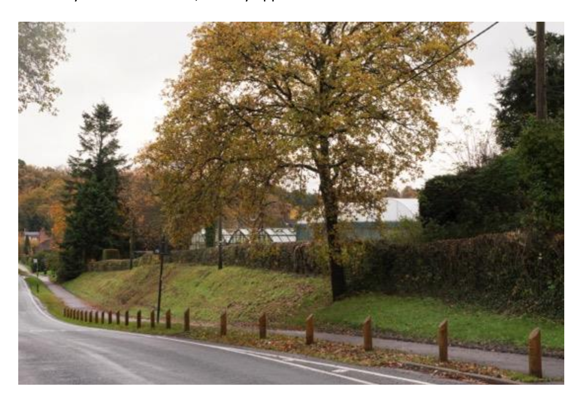
Image E – view along boundary of site from Petersfield Road, looking north east with Wolmer Forest behind. Nursery greenhouses visible above hedge.