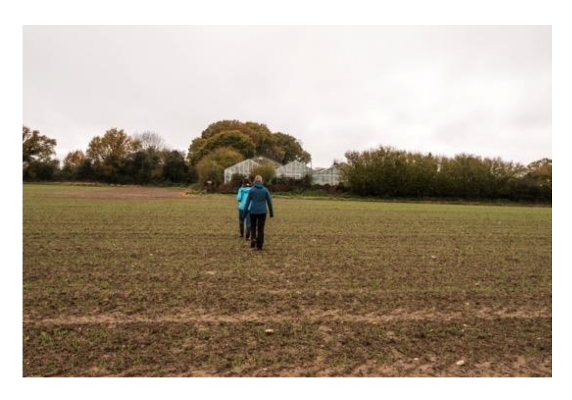
Image H - Walkers on the footpath across an open field to the east of site. Greenhouses on site behind, and hazel hedge to right.