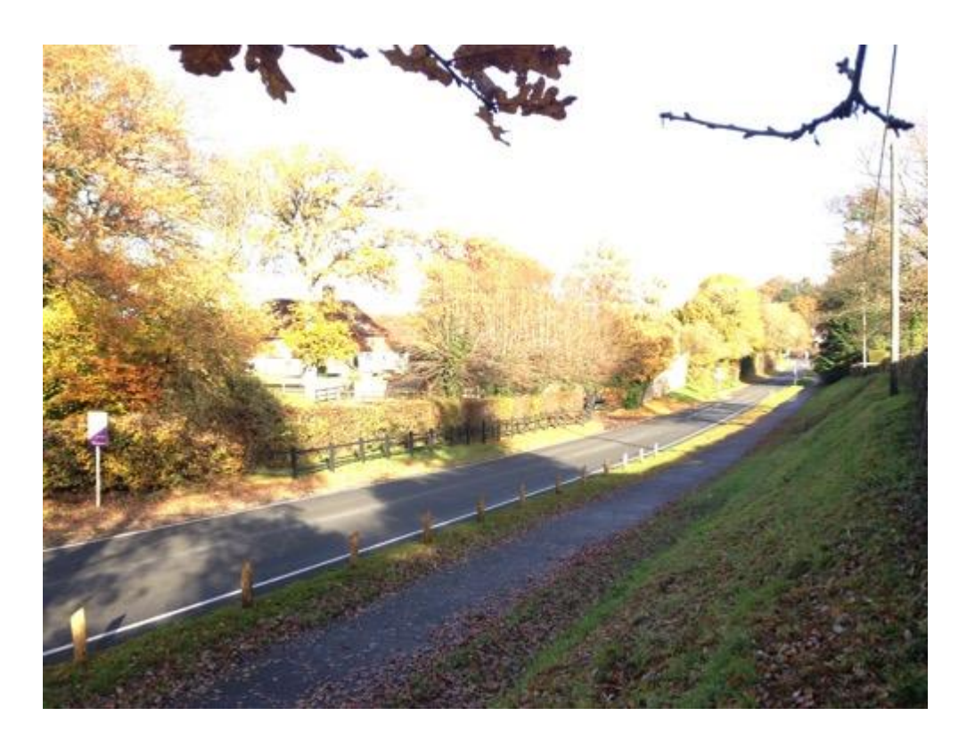
Image B - from south looking north along Petersfield Rd, shows Deal Farm on opposite side of road, facing the site. A footpath leads past Deal Farm to the open countryside beyond.