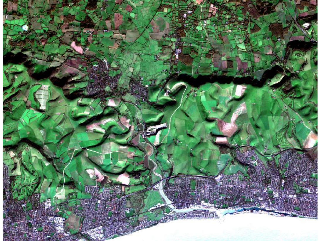
European space agency Copernicus-Adam Brown