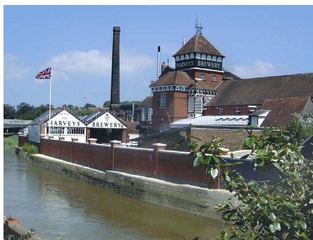
Harveys Brewery, Lewes, East Sussex