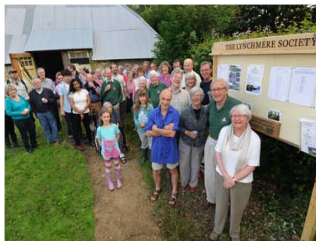
The Lynchmere Society, West Sussex

Many of these settlements contain strong and vibrant communities with much invested in the future of where they live, and a sense of identity with their local area, its culture and history. Across the South Downs there are also communities of people who come together through common interests, for example, farming, conservation and recreation. These communities dedicate time and resources to enhancing community life, conserving what is important to them and planning for future generations.