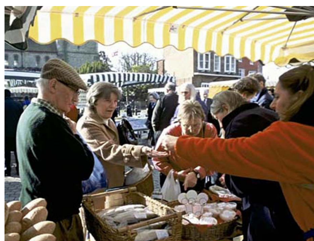
Farmers' Market, Petersfield, Hampshire