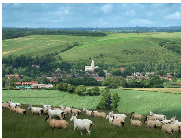
Sheep in the Meon Valley, Hampshire