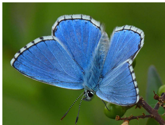
Adonis blue butterfly

The river valleys intersecting the South Downs support wetland habitats and a wealth of birdlife, notably at Pulborough Brooks. Many fish, amphibians and invertebrates thrive in the clear chalk streams of the Meon and Itchen in Hampshire where elusive wild mammals such as otter and water vole may also be spotted. The extensive chalk sea cliffs and shoreline in the East host a wide range of coastal wildlife including breeding colonies of seabirds such as kittiwakes and fulmars.