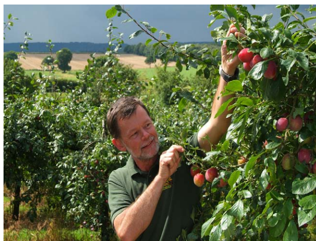
Durleighmarsh Farm & Orchard, West Sussex

However, the economy of the National Park is by no means restricted to farming. There are many popular tourist attractions and well-loved local pubs which give character to our towns and villages. The National Park is also home to a wide range of other businesses, for example new technology and science, which supports local employment.