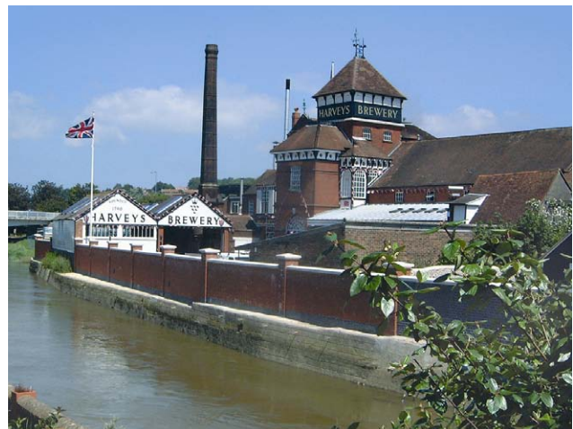
Harveys Brewery, Lewes, East Sussex