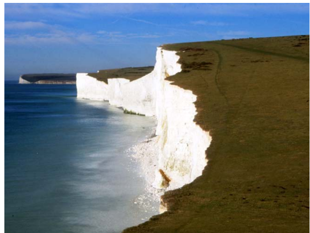
Seven Sisters, East Sussex