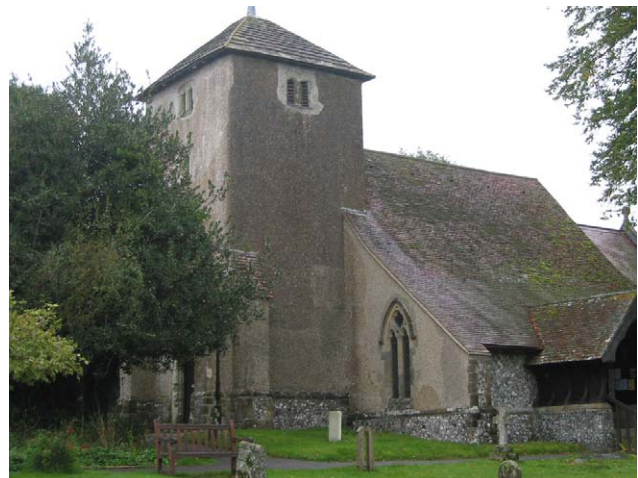
Saxon Church, Singleton, West Sussex