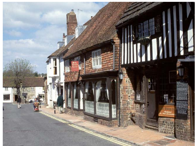
Alfriston, East Sussex