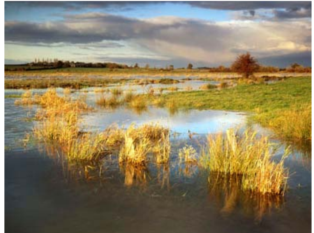
Amberley Wildbrooks, West Sussex

The South Downs National Park is in South East England, one of the most crowded parts of the United Kingdom. Although its most popular locations are heavily visited, many people greatly value the sense of tranquillity and unspoilt places which give them a feeling of peace and space. In some areas the landscape seems to possess a timeless quality, largely lacking intrusive development and retaining areas of dark night skies. This is a place where people seek to escape from the hustle and bustle in this busy part of England, to relax, unwind and re-charge their batteries.