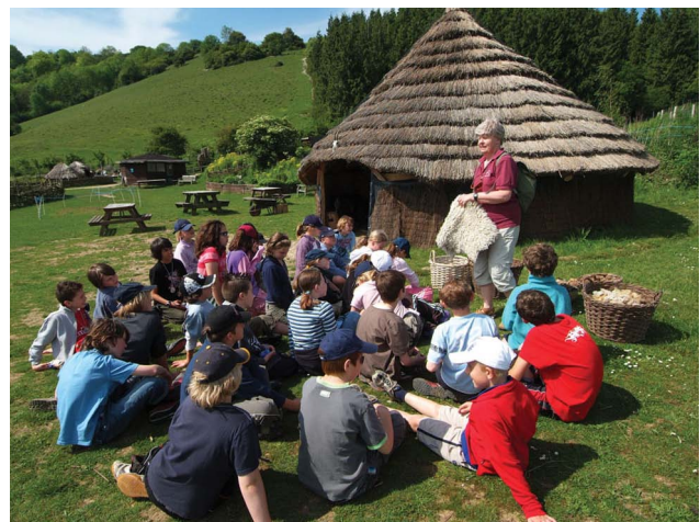
Butser Ancient Farm, Chalton, Hampshire