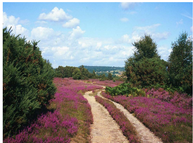
Heathland habitat, Iping Common, West Sussex