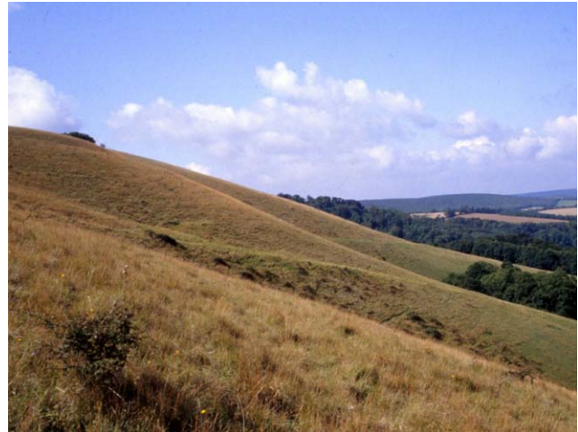
Harting Down, West Sussex

There are stunning, panoramic views to the sea and across the Weald as you travel the hundred mile length of the South Downs Way from Winchester to Eastbourne, culminating in the impressive chalk cliffs at Seven Sisters. From near and far, the South Downs is an area of inspirational beauty that can lift the soul.