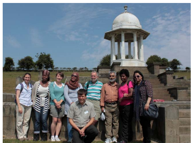
The Chattri, above Brighton, East Sussex