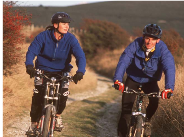
Cycling on the South Downs Way

The variety of landscapes, wildlife and culture provides rich opportunities for learning about the South Downs as a special place, for the many school and college students and lifelong learners. Museums, churches, historic houses, outdoor education centres and wildlife reserves are places that provide both enjoyment and learning. There is a strong volunteering tradition providing chances for outdoor conservation work, acquiring rural skills, leading guided walks and carrying out survey work relating to wildlife species and rights of way.