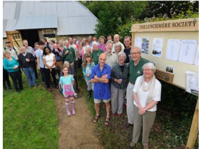
The Lynchmere Society, West Sussex

Many of these settlements contain strong and vibrant communities with much invested in the future of where they live, and a sense of identity with their local area, its culture and history. Across the South Downs there are also communities of people who come together through common interests, for example, farming, conservation and recreation. These communities dedicate time and resources to enhancing community life, conserving what is important to them and planning for future generations.