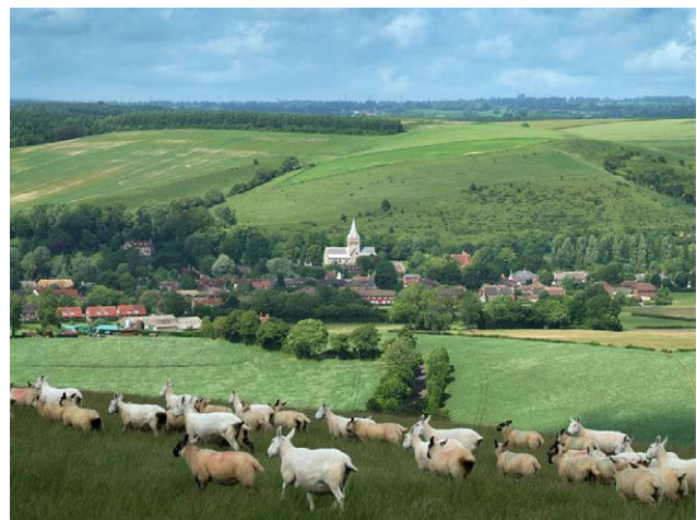
Sheep in the Meon Valley, Hampshire