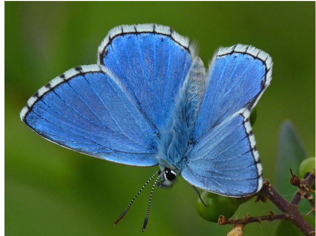
Adonis blue butterfly

The river valleys intersecting the South Downs support wetland habitats and a wealth of birdlife, notably at Pulborough Brooks. Many fish, amphibians and invertebrates thrive in the clear chalk streams of the Meon and Itchen in Hampshire where elusive wild mammals such as otter and water vole may also be spotted. The extensive chalk sea cliffs and shoreline in the East host a wide range of coastal wildlife including breeding colonies of seabirds such as kittiwakes and fulmars.