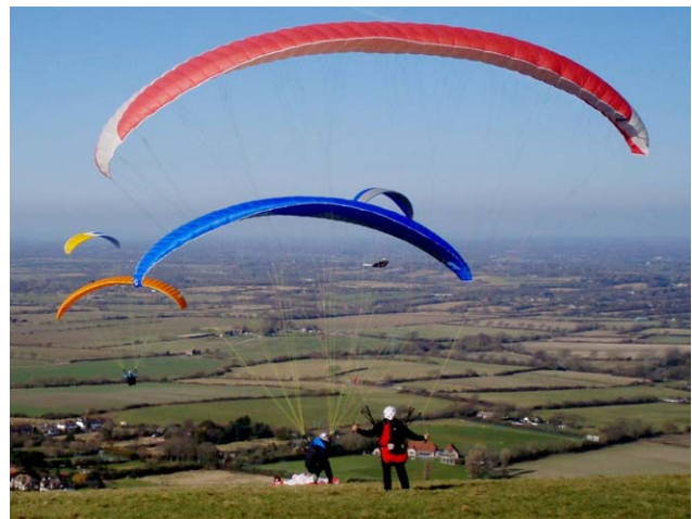
Paragliding near Lewes