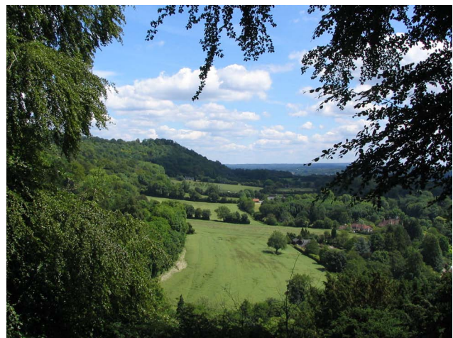
The Hangers from Stoner Hill, Hampshire