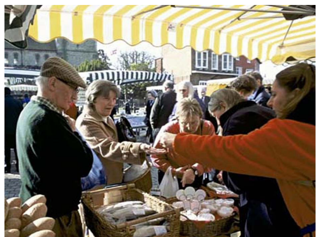
Farmers' Market, Petersfield, Hampshire