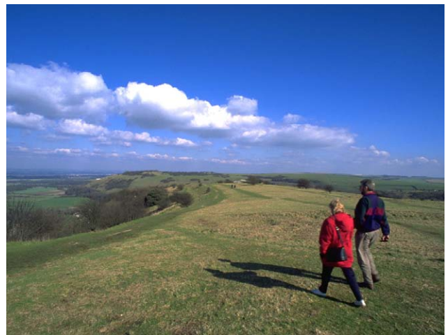
Walkers on the South Downs Way, Devil's Dyke