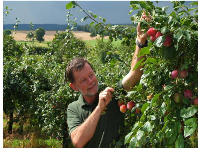
Durleighmarsh Farm & Orchard, West Sussex

However, the economy of the National Park is by no means restricted to farming. There are many popular tourist attractions and well-loved local pubs which give character to our towns and villages. The National Park is also home to a wide range of other businesses, for example new technology and science, which supports local employment.