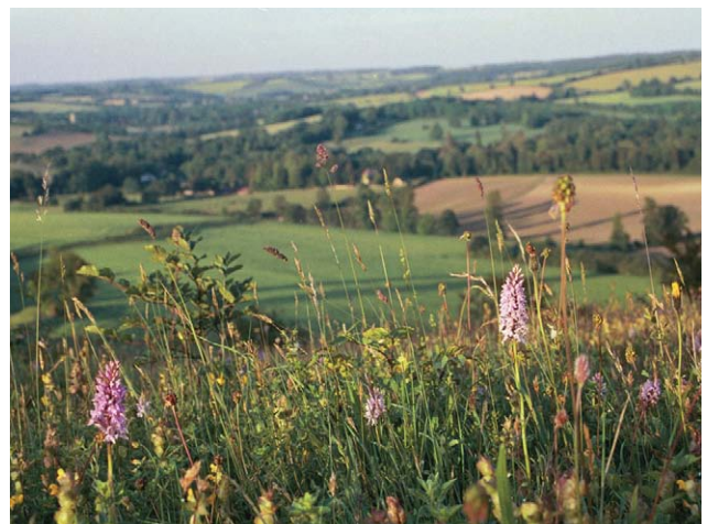
Orchids on Beacon Hill, Hampshire