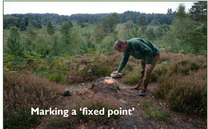
Marking a 'fixed point'

Partners include: Amphibian and Reptile Conservation, Butterfly Conservation, Ministry of Defence Estates, Forestry Commission, Hampshire County Council, Hampshire and the Isle of Wight Wildlife Trust, the Lynchmere Society, the National Trust, Natural England, RSPB and the Sussex Wildlife Trust.