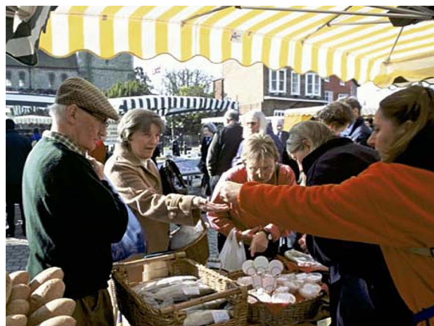
Farmers' Market, Petersfield, Hampshire