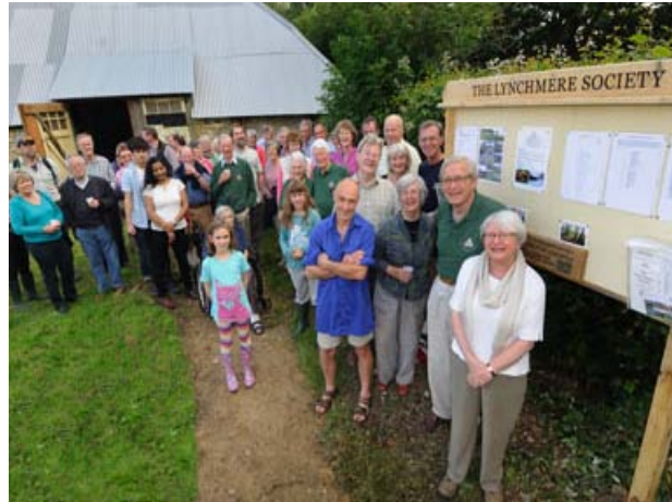
The Lynchmere Society, West Sussex

Many of these settlements contain strong and vibrant communities with much invested in the future of where they live, and a sense of identity with their local area, its culture and history. Across the South Downs there are also communities of people who come together through common interests, for example, farming, conservation and recreation. These communities dedicate time and resources to enhancing community life, conserving what is important to them and planning for future generations.