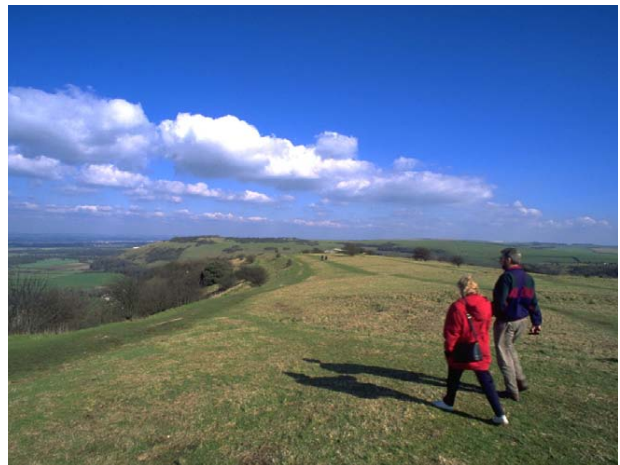
Walkers on the South Downs Way, Devil's Dyke