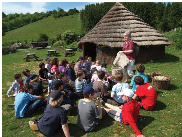
Butser Ancient Farm, Chalton, Hampshire