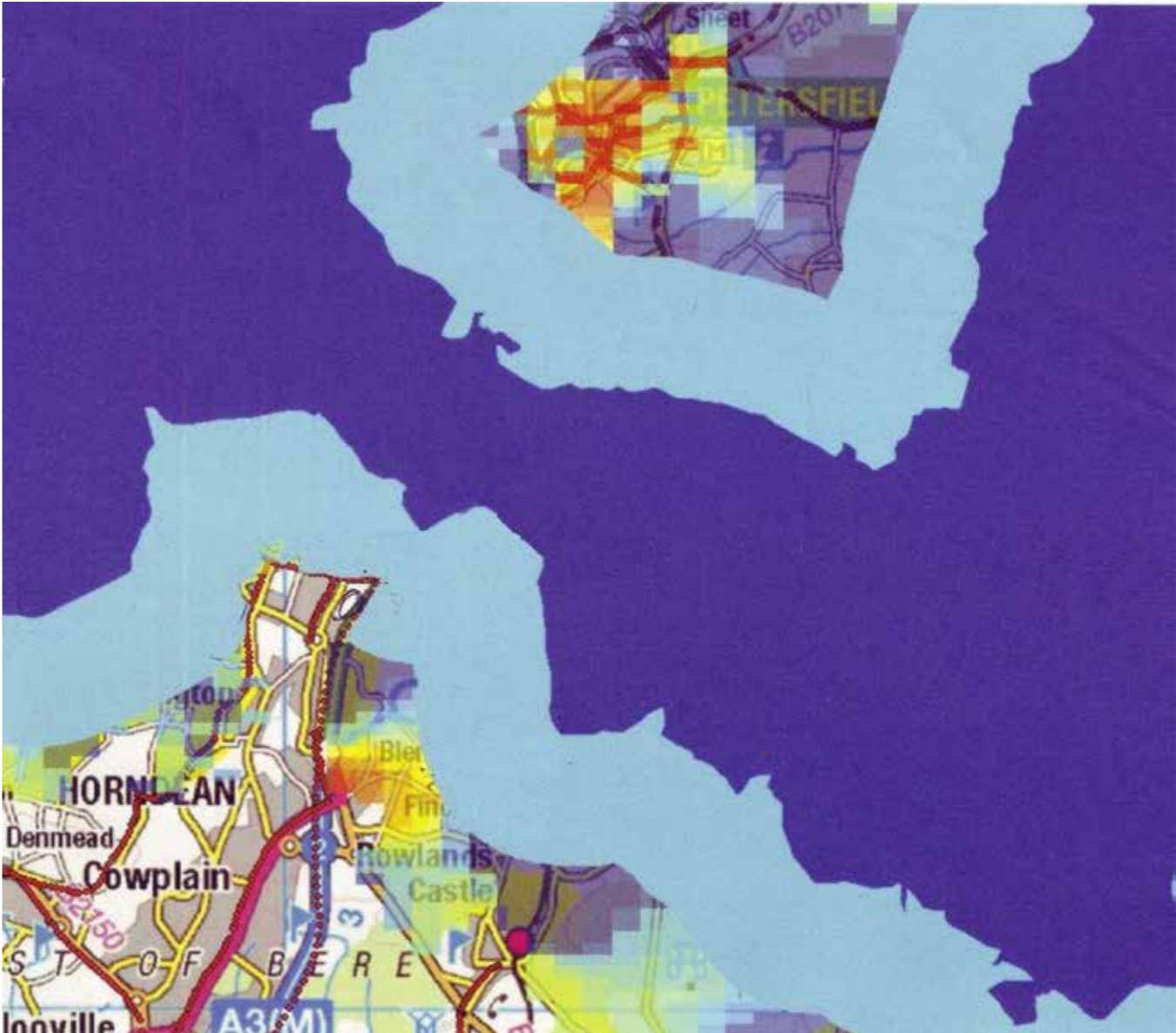
The parish of Buriton forms an important pinch-point in the South Downs International Dark Skies Reserve