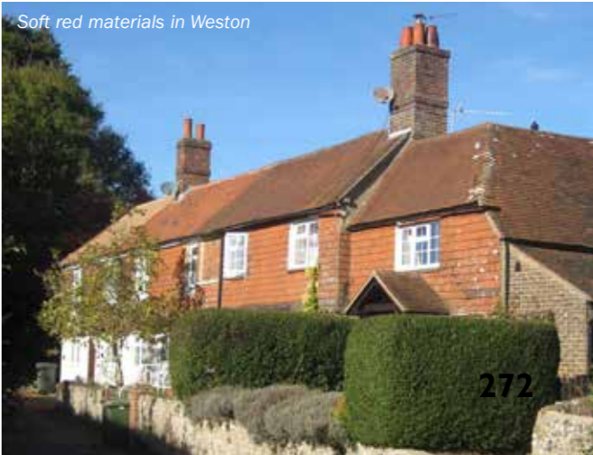
Soft red materials in Weston

Within the National Park, the Planning Authority already accepts that significant development is not appropriate. New development is, therefore, likely to be confined to small numbers of new buildings on infill plots, redevelopments and conversions. Given the challenges facing the farming community, support should be given to ideas for farm diversification as long as proposals can be achieved without adverse effects. There are, therefore, guidelines here for new buildings, alterations to existing properties and agricultural developments.