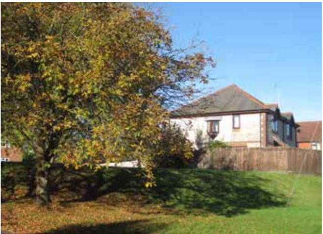
New houses fit in with old

Any new developments should include a good variety of house sizes and should include adequate off-street parking as on-street parking can be