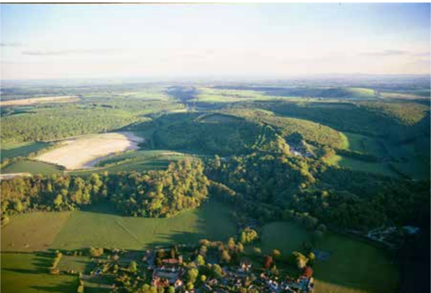
Wooded scarps provide a sense of enclosure for Buriton

● the architectural style, materials and design details of individual buildings add to the local characteristics and qualities that people appreciate.