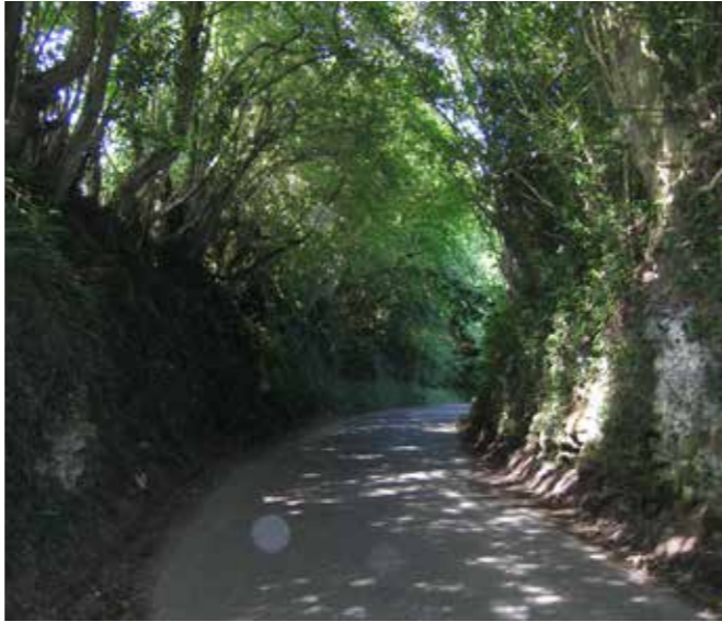
Ancient sunken lanes provide the way into Buriton, Nursted and Weston

Sunken lanes form important landscape features in the parish, are valuable as wildlife habitats and are historically