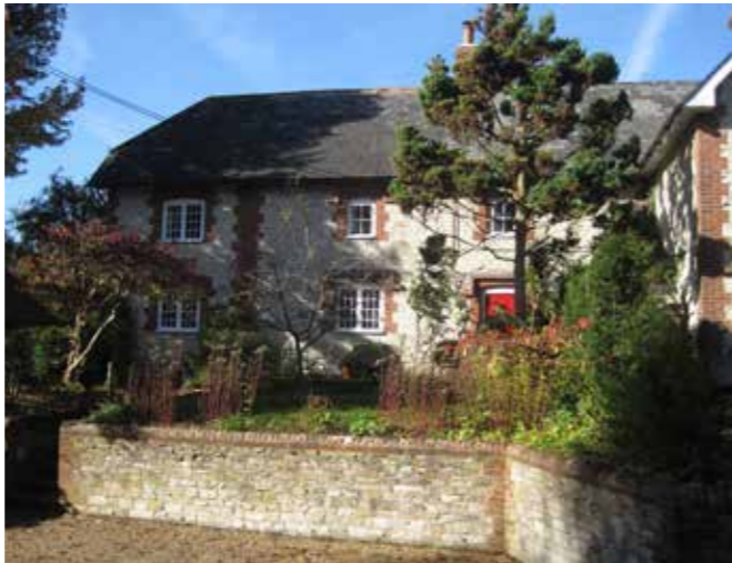
Attention to detail contributes to harmonious extensions

Whilst new developments should not necessarily attempt to replicate the local traditional styles, they should be designed to respect and reflect nearby colours, textures, materials, shapes, styles, proportions and components. The use of flat roofs, roof-lights, stained timber and UPVC components are not generally appropriate and, when proposed, need to be considered with great care both in terms of elegance of intrinsic detail and site context. With materials, blends of compatible colours can avoid single, monochrome