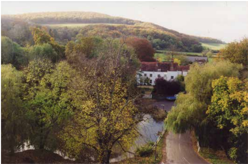
Attractive landscapes surround the villages

LS1: Any new development should respect the character of the countryside, be in harmony with landscape features and setting, take account of all the important biodiversity in the parish and not be visually detrimental to vistas which are available from many parts of the parish