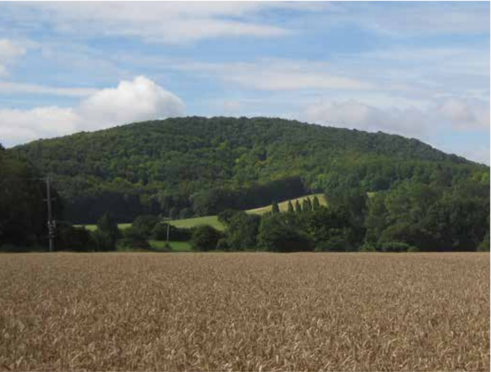
War Down – once downland, now forested

national and regional resource for informal quiet recreation. Any planning proposals for the area need to respect the quality of the landscape and its tranquillity so that this function can continue.