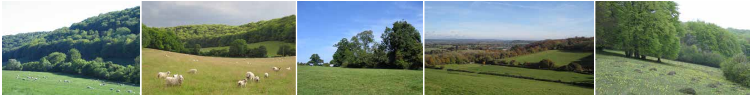
Designations recognising the special character of the area

The detailed Landscape Character Assessment for the parish of Buriton (which forms an appendix to this document) includes SDILCA character descriptions, key sensitivities and future considerations for the three landscape character areas in the parish, amplified by supplementary local comment and analysis from the community-led exercise. Due regard must be paid to these issues in the consideration of any proposals for development in the area.