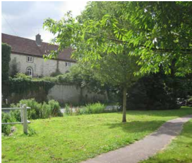
Pond Green – one of a number of important open spaces

The open spaces with which Buriton parish is so richly endowed, provide both memorable views and a sense of peace. Two different ‘types’ of open space are significant: rural gaps between settlements; and important open spaces within each settlement.