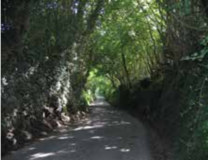
Sunken lanes are a particular local feature

There are problems with the capacity of water supplies and drainage in the parish which could be affected by development in the future but there is a rich and valued network of Public Rights of Way which allows access to the countryside.