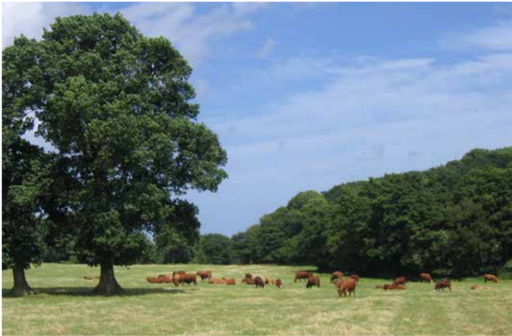
Strips of woodland form important features

We have also used the University of Portsmouth ‘Landscape Watch’ database for the parish of Buriton to identify changes to our local landscapes drawing upon detailed aerial photographs held by Hampshire County Council for 2005 and 2013. Analysis of the data shows only relatively small, localised changes in cultivated and woodland areas over the period along with small increases in buildings outside the main settlements. It will be important for these trends, with little or no adverse effects on the landscape, to be continued.