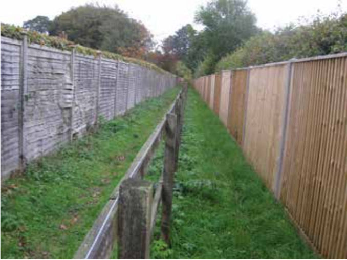
Fence panels can spoil public paths and views

P10: There is a substantial network of Public Rights of Way within the parish which allows access to the countryside and: a) footpaths and bridleways should be kept open, free from motorised traffic and in good repair b) any diversions should be carefully planned with the Parish Council c) proposals to close any Public Rights of Way should be resisted d) opportunities for new Rights of Way should be considered.