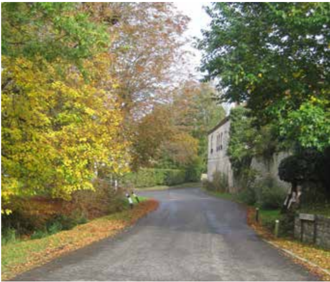
Narrow curving lanes characterise the historic settlement patterns

Only the houses in Sumner / Glebe Roads and in Heatherfield have a uniform character. Even here, mature gardens and hedged boundaries soften the effect and extensive views to open countryside remain. In Heatherfield, deliberately uneven building lines and an irregular distribution of dwellings help to create interesting visual relationships. A footpath from Heatherfield to Bones Lane helps physically to integrate this development into the village.