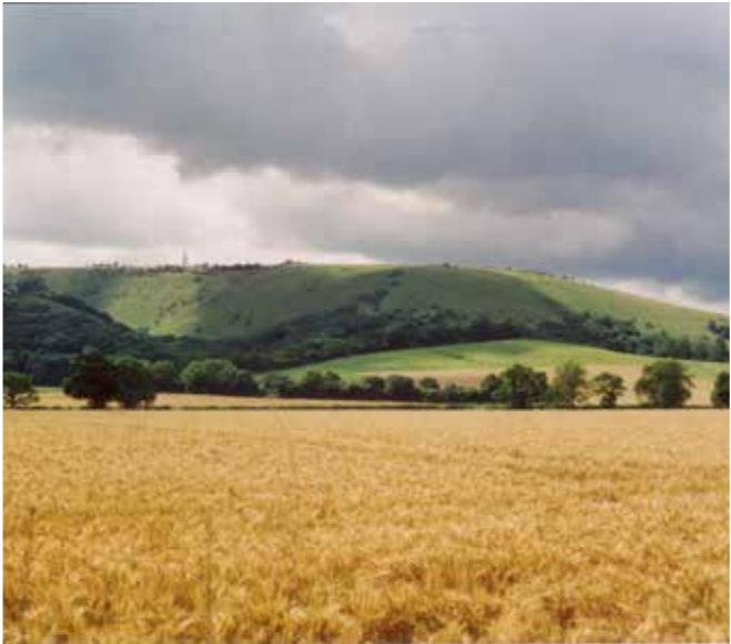
Butser Hill – the magnificent backdrop for Weston

Virtually all the buildings in Buriton and Weston are hidden from view on approach routes into the settlements and from long distance vantage points