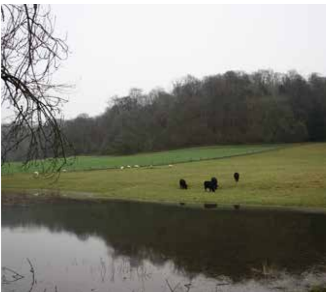
Flooding can be a challenge

SP8: New buildings should reflect both the size and scale of existing buildings and their position within the building plot