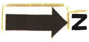
Legend Extent of Article 4 Direction