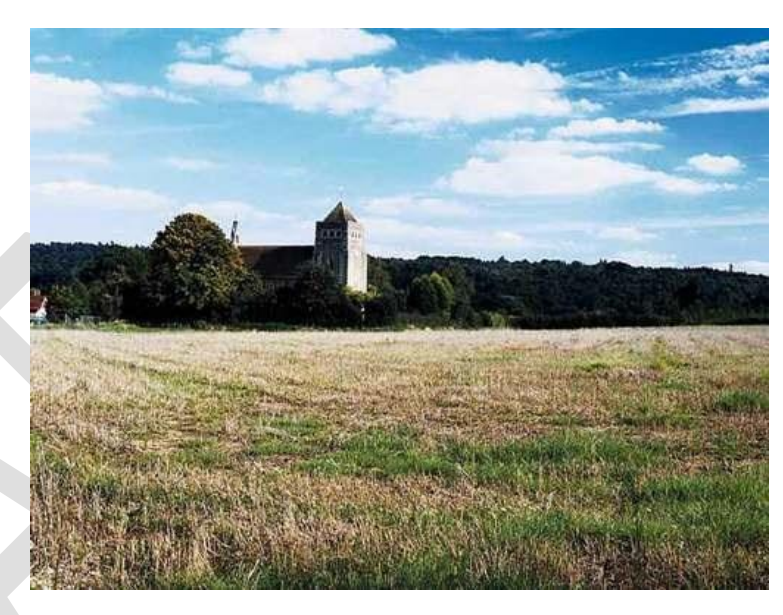
Pre-Submission CONSULTATION DRAFT March 2016 lissnp.org.uk