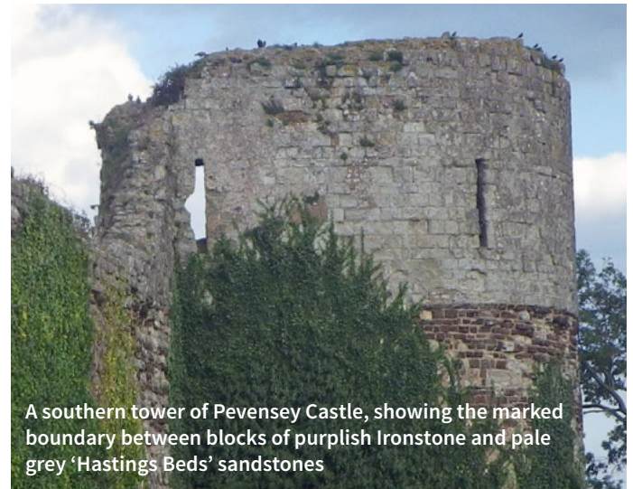
A southern tower of Pevensey Castle, showing the marked boundary between blocks of purplish Ironstone and pale grey 'Hastings Beds' sandstones

into ashlar, but upon exposure to air it quickly hardens. It has been only very occasionally employed as a building stone in East Sussex, but where used it is typically seen as roughly cut or rubble stone blocks in old walls and Medieval churches, as for example in Brighton, West Blatchington, Wilmington and Kingston.