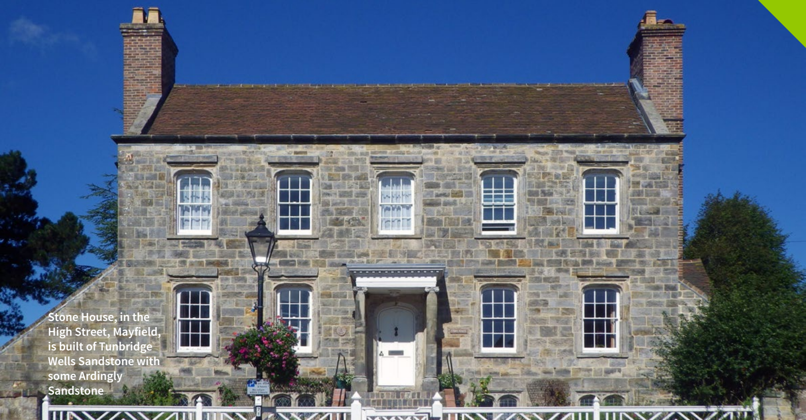
Stone House, in the High Street, Mayfield, is built of Tunbridge Wells Sandstone with some Ardingly Sandstone

as building stone are described individually below.