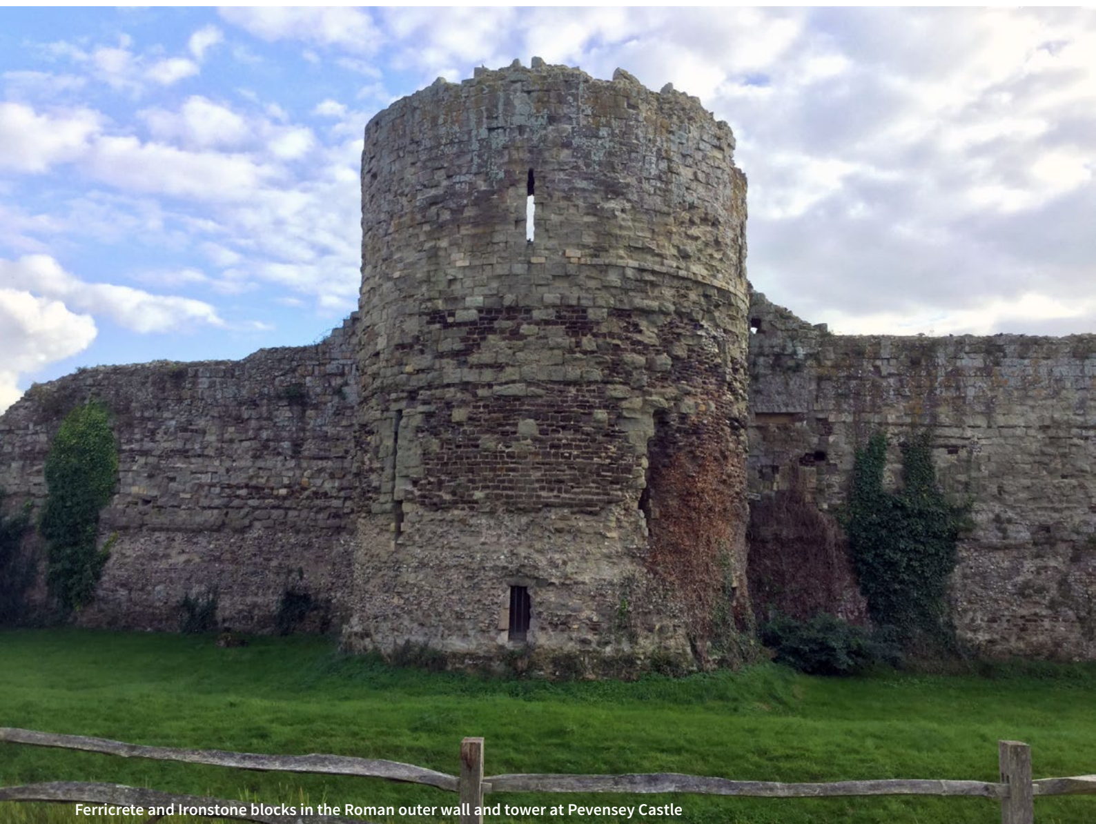
Ferricrete and Ironstone blocks in the Roman outer wall and tower at Pevensey Castle