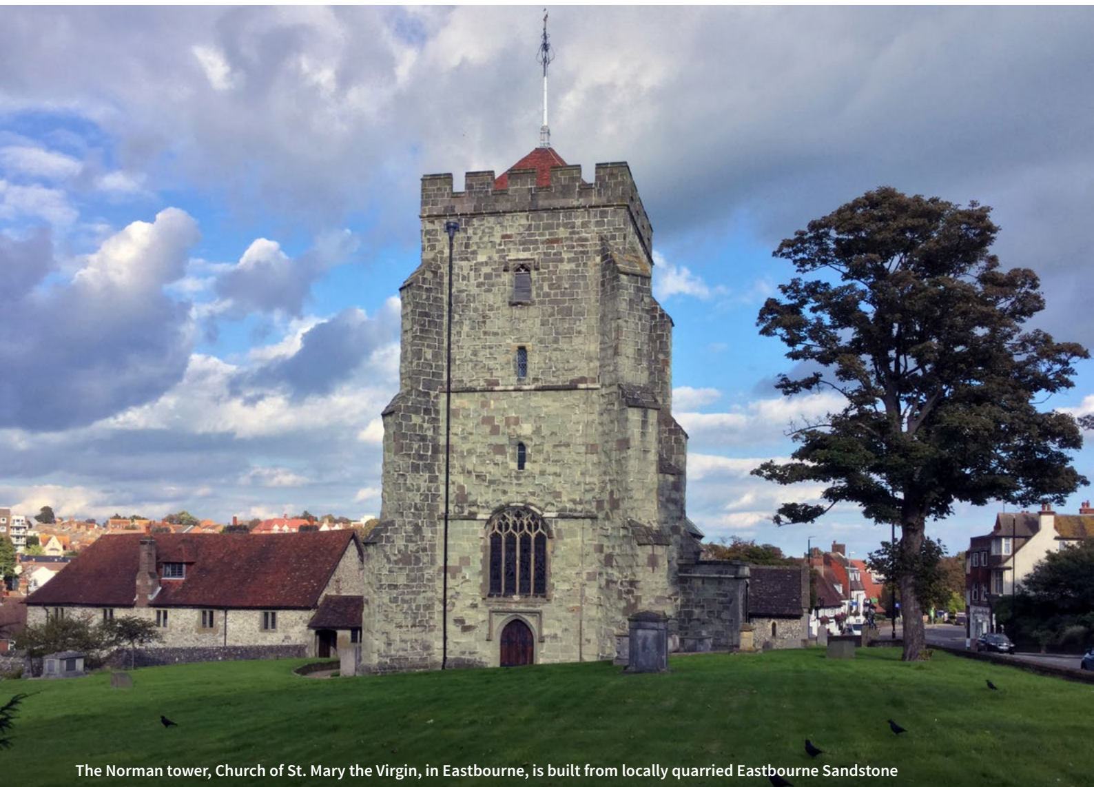
The Norman tower, Church of St. Mary the Virgin, in Eastbourne, is built from locally quarried Eastbourne Sandstone