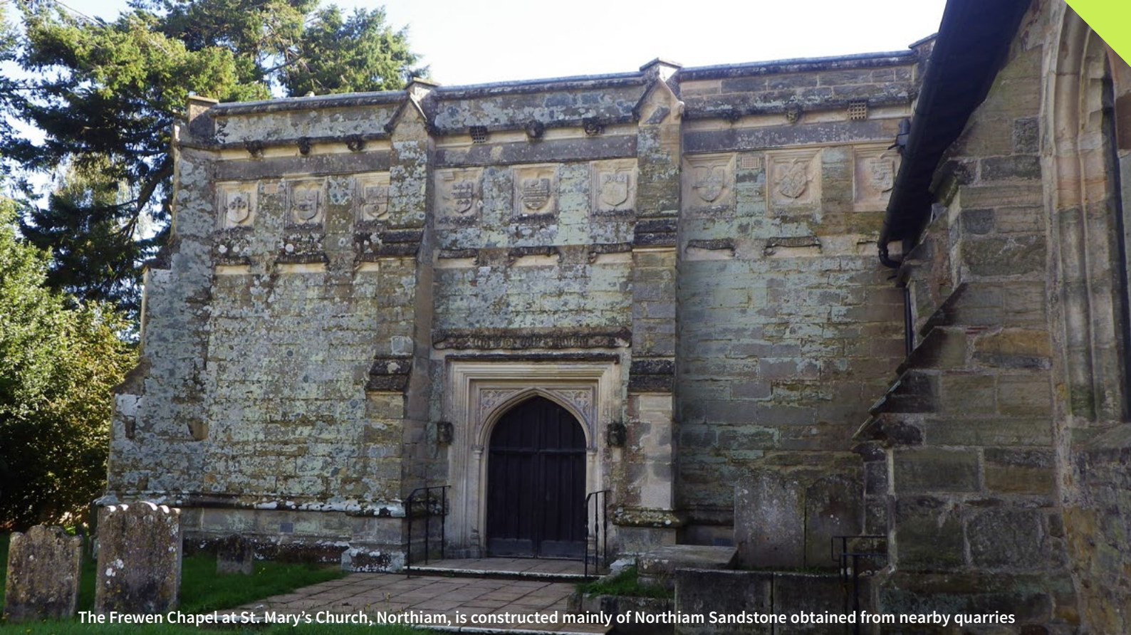
The Frewen Chapel at St. Mary's Church, Northiam, is constructed mainly of Northiam Sandstone obtained from nearby quarries

As with other sandstone units in the Wadhurst Clay Formation, the Hog Hill Sandstone is laterally impersistent, and rapid lateral variations in lithology are common. Where present, it occupies a stratigraphic position approximately in the middle of the Wadhurst Clay Formation. Hog Hill Sandstone has seen only very minor and localised use as a building stone along its outcrop.