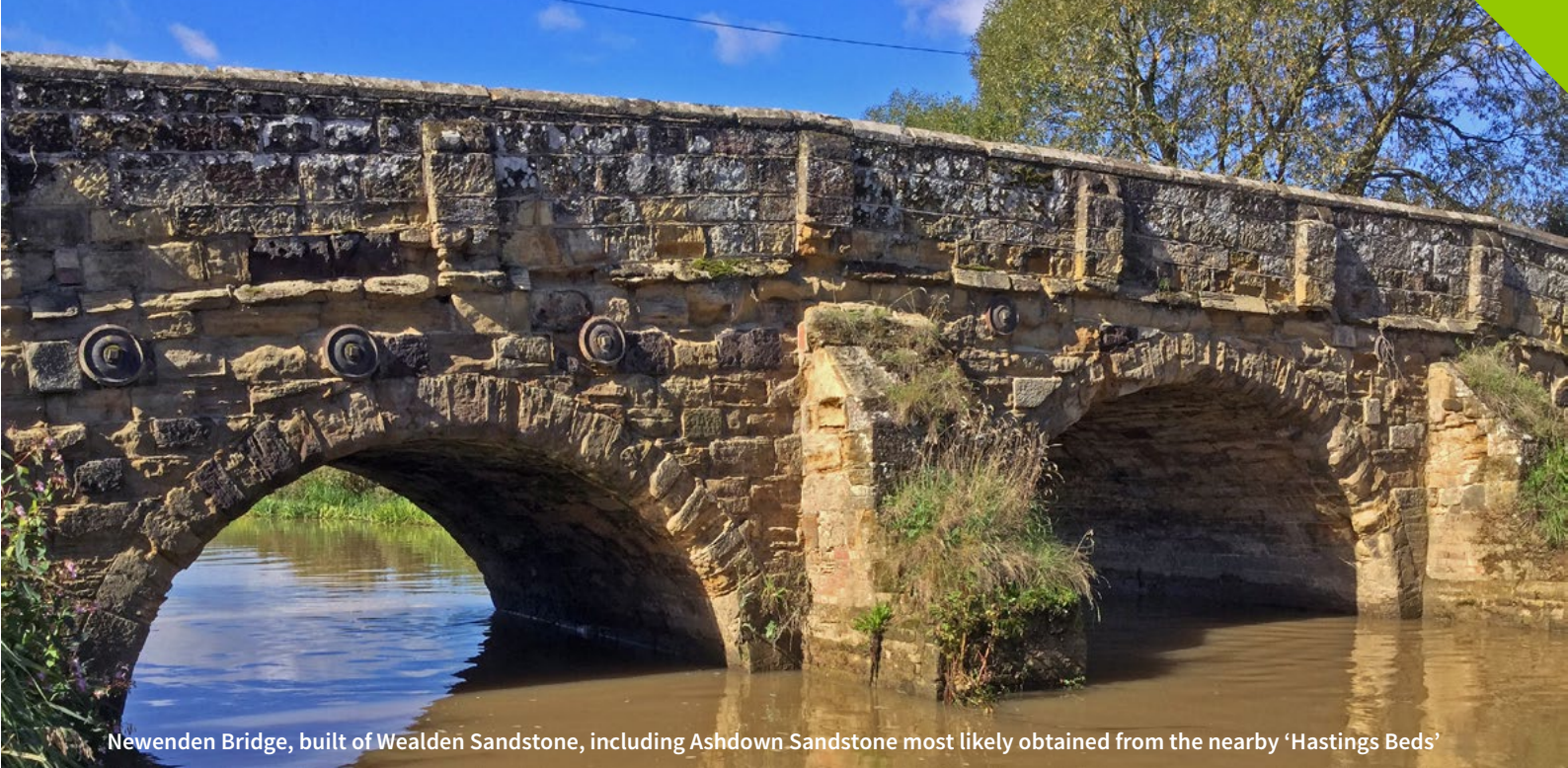
Newenden Bridge, built of Wealden Sandstone, including Ashdown Sandstone most likely obtained from the nearby 'Hastings Beds'