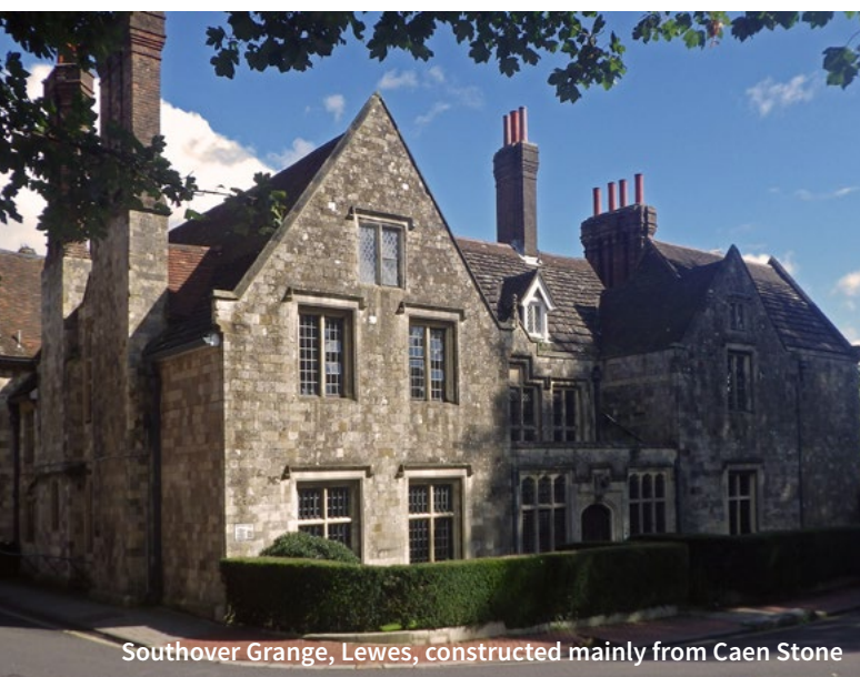
Southover Grange, Lewes, constructed mainly from Caen Stone