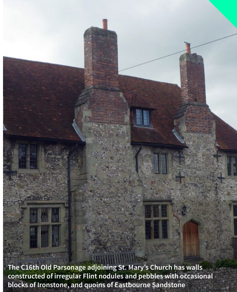
The C16th Old Parsonage adjoining St. Mary's Church has walls constructed of irregular Flint nodules and pebbles with occasional blocks of Ironstone, and quoins of Eastbourne Sandstone

Eastbourne Sandstone weathers badly, and the surface flakes and spalls when exposed to the elements. Historically, however, the stone was quarried on a large scale from the foreshore at Eastbourne and was widely used as a rubble stone and coarse ashlar around Eastbourne (especially in Victorian walling) and in the south-west of the county. It was also employed for window tracery and door jambs. Examples of its use include wall buttresses and dressings of St. Andrew's Church, Beddingham (which also incorporates stone reused from Lewes Priory following the Dissolution during the C16th), blocks in the walls of Pevensey Castle and the impressive Norman tower of the Church of St. Mary the Virgin at Eastbourne. The sandstone for this tower was quarried from a site located near the present day Queens Hotel on Eastbourne seafront.