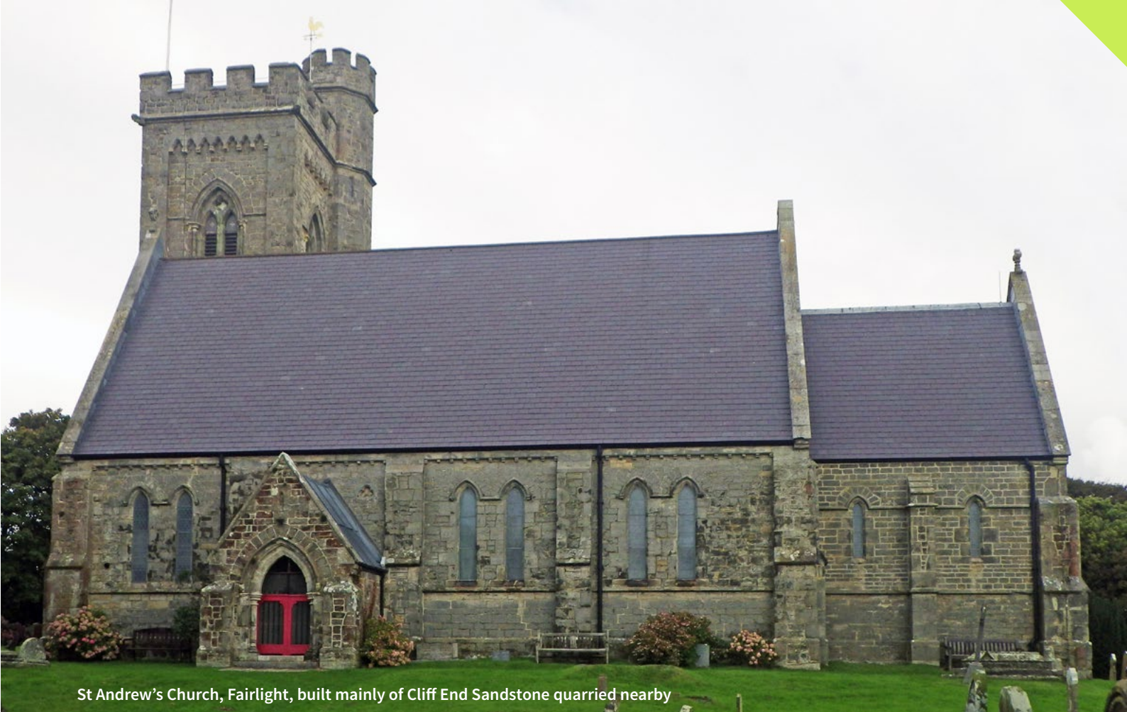
St Andrew's Church, Fairlight, built mainly of Cliff End Sandstone quarried nearby