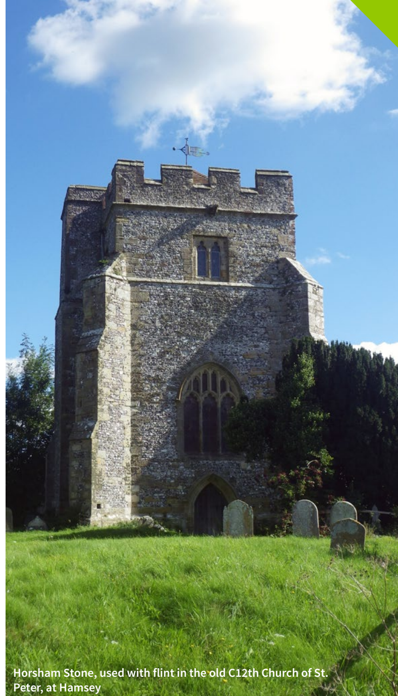
Horsham Stone, used with flint in the old C12th Church of St. Peter, at Hamsey

Horsham Stone crops out in the far west of East Sussex near Wivelsfield, although it is absent from the Tenterden and Lewes areas. It comprises two sandstone horizons varying between 1.0 and 1.5 m in thickness, which sometimes contain ironstone nodules. Horsham Stone is a fine- to very fine-grained, hard, flaggy, calcareous sandstone, typically pale buff to pale grey in colour. Bands of iron-staining are commonplace, and longitudinal ripple structures are often present on the surfaces of fine-grained sandstone paving slabs. Apart from trace fossils and bioturbation features, fossils are uncommon in the Horsham Stone; those that are present include poorly-preserved casts and moulds of freshwater bivalves, wood