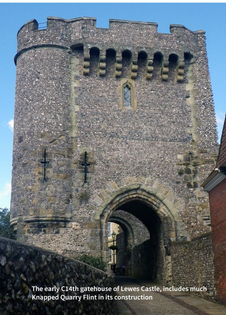
The early C14th gatehouse of Lewes Castle, includes much Knapped Quarry Flint in its construction

burrow-structures being the most commonly encountered types.