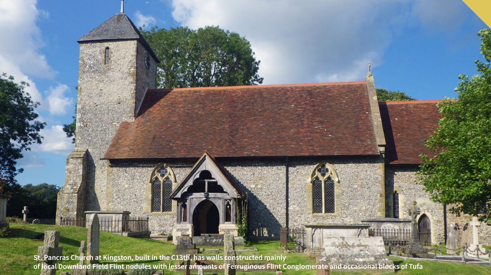
St. Pancras Church at Kingston, built in the C13th, has walls constructed mainly of local Downland Field Flint nodules with lesser amounts of Ferruginous Flint Conglomerate and occasional blocks of Tufa