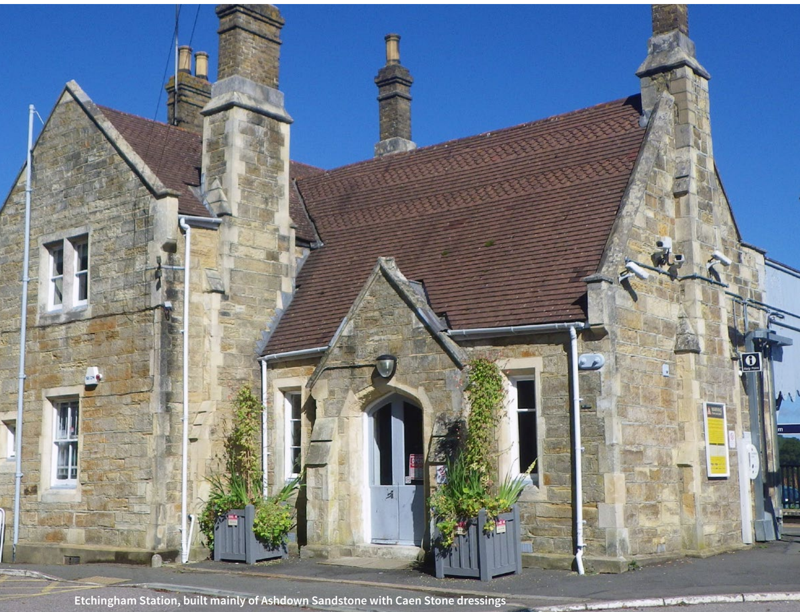
Etchingam Station, built mainly of Ashdown Sandstone with Caen Stone dressings

In common with most of the harder Wealden Sandstones in East Sussex, the Ashdown Sandstone has been employed as a building stone throughout its outcrop area, mainly in walls as a coursed rubble stone, or as roughly cut blocks, and occasionally as ashlar. Particular noteworthy examples of its use are Bateman's (near Burwash), Etchingam Station, the ruins of Bayham Abbey (Lamberhurst) and the churches at Crowborough, Old Heathfield and Rye. It is also used, in combination with Tunbridge Wells Sandstone, at St. Leonards School, Mayfield.