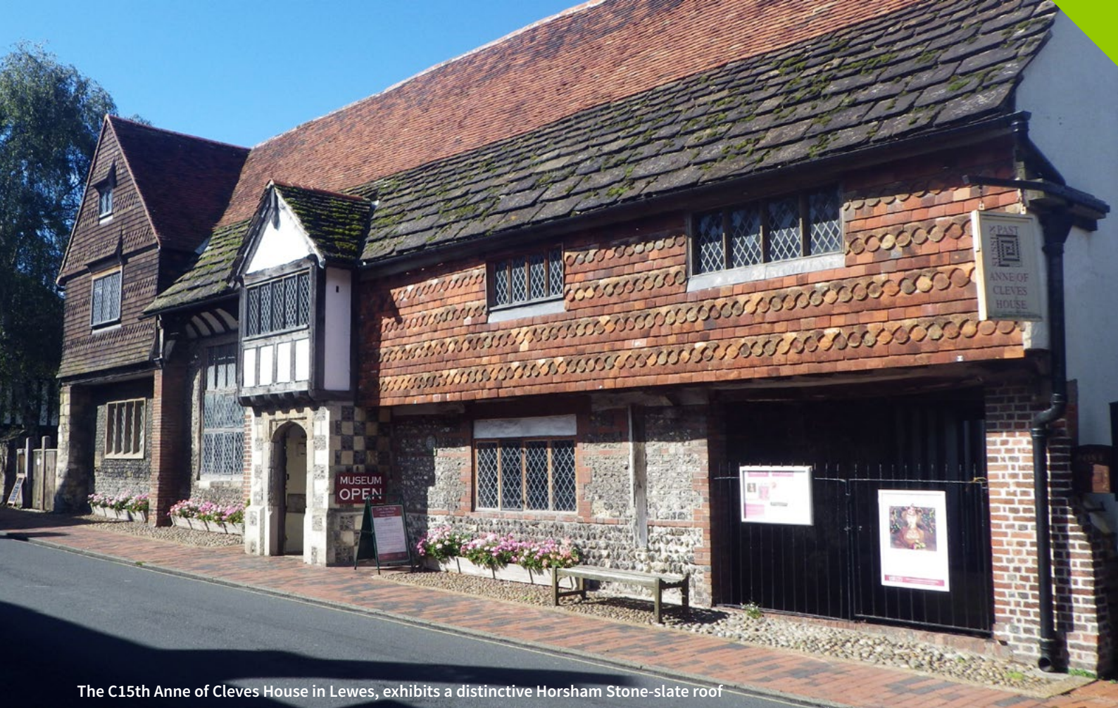
The C15th Anne of Cleves House in Lewes, exhibits a distinctive Horsham Stone-slate roof