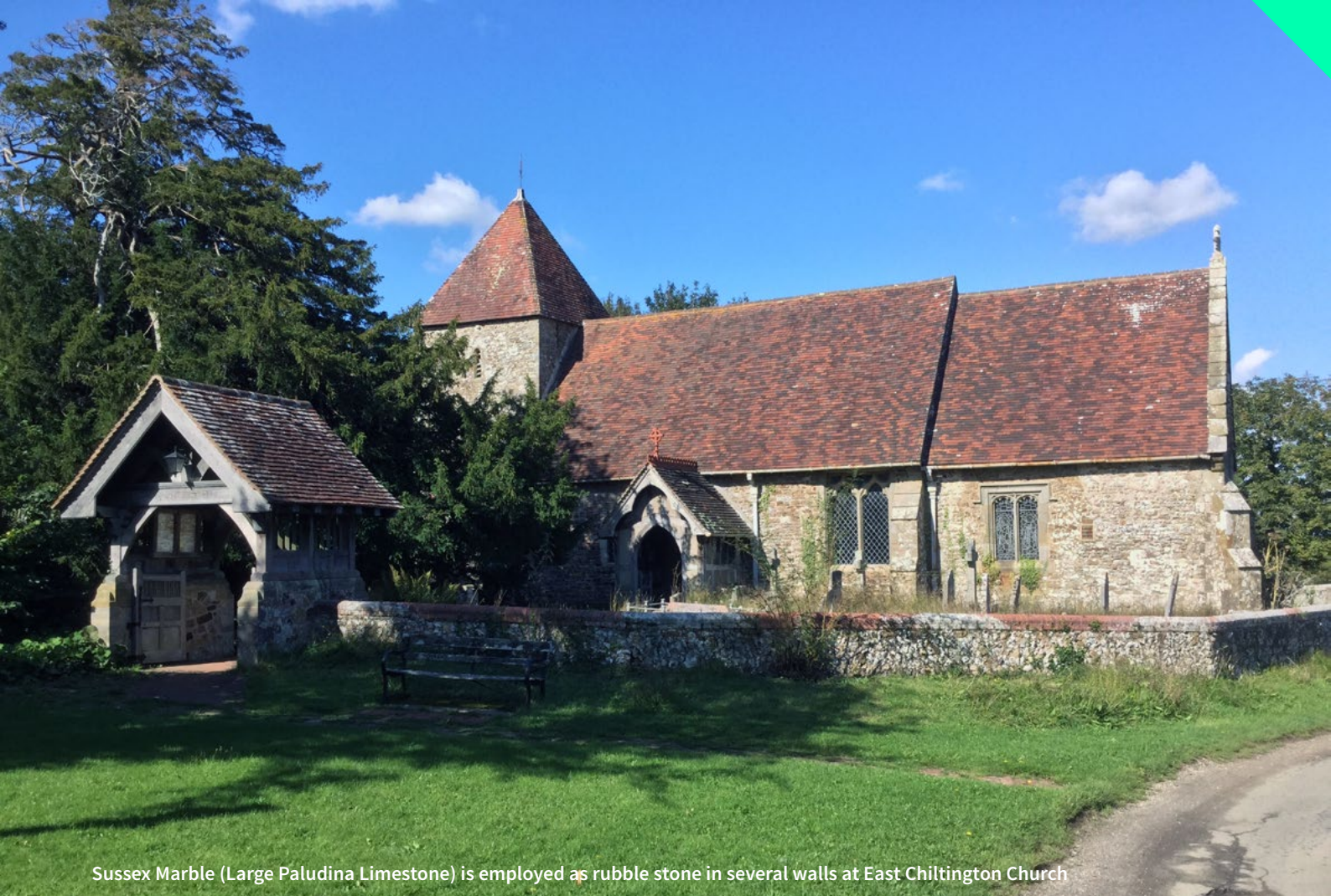
Sussex Marble (Large Paludina Limestone) is employed as rubble stone in several walls at East Chilmington Church

it has been occasionally employed as a rubble stone in barns, farmhouses and cottages along its outcrop, notably in the Laughton area. It can also be seen in church walls at Plumpton, Laughton, Streat, and East Chilmington.