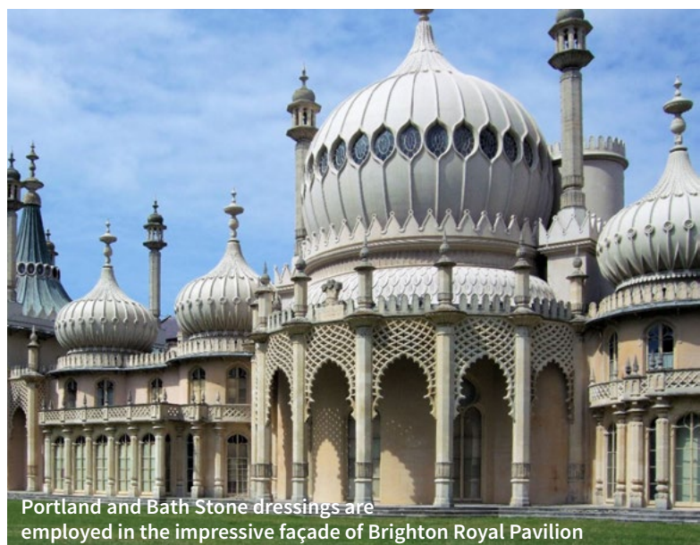
Portland and Bath Stone dressings are employed in the impressive façade of Brighton Royal Pavilion

Further descriptions of imported stones relevant to East Sussex can be found in several of the references listed in the Further Reading section of this Atlas.