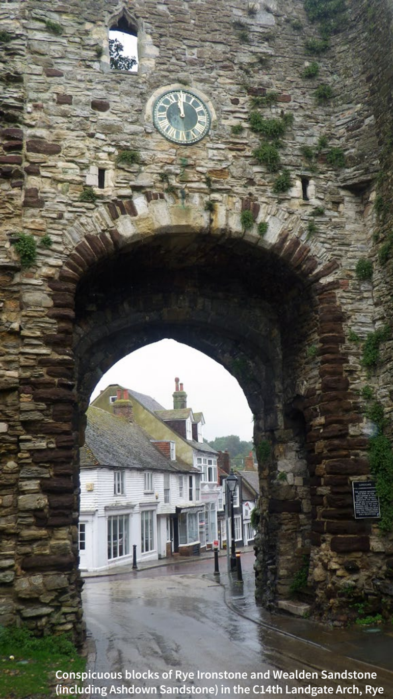
Conspicuous blocks of Rye Ironstone and Wealden Sandstone (including Ashdown Sandstone) in the C14th Landgate Arch, Rye

Hastings Castle's walls (in combination with larger quantities of Ashdown Sandstone, Tilgate Stone and Flint cobbles, the latter being obtained from nearby beaches).