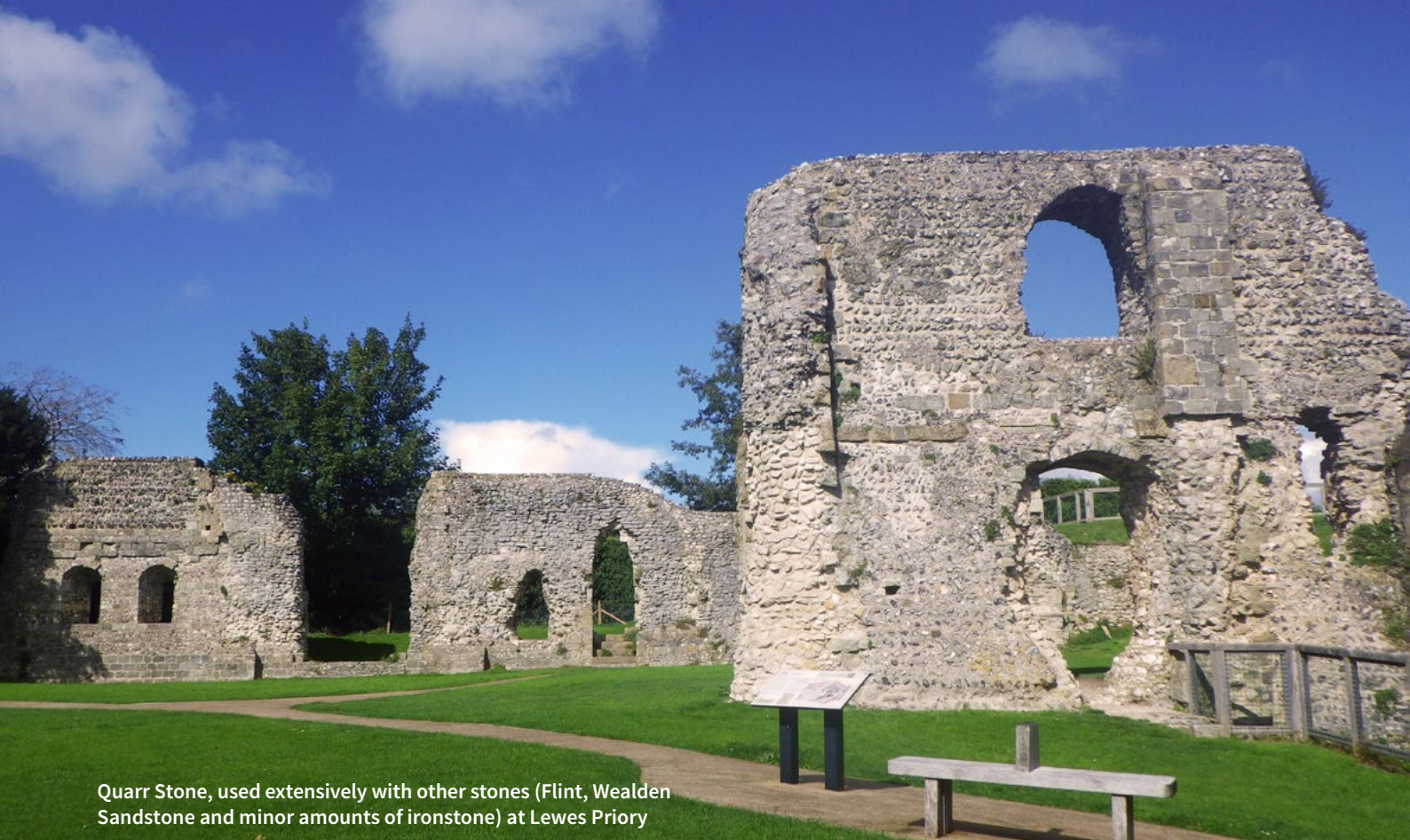
Quarr Stone, used extensively with other stones (Flint, Wealden Sandstone and minor amounts of ironstone) at Lewes Priory