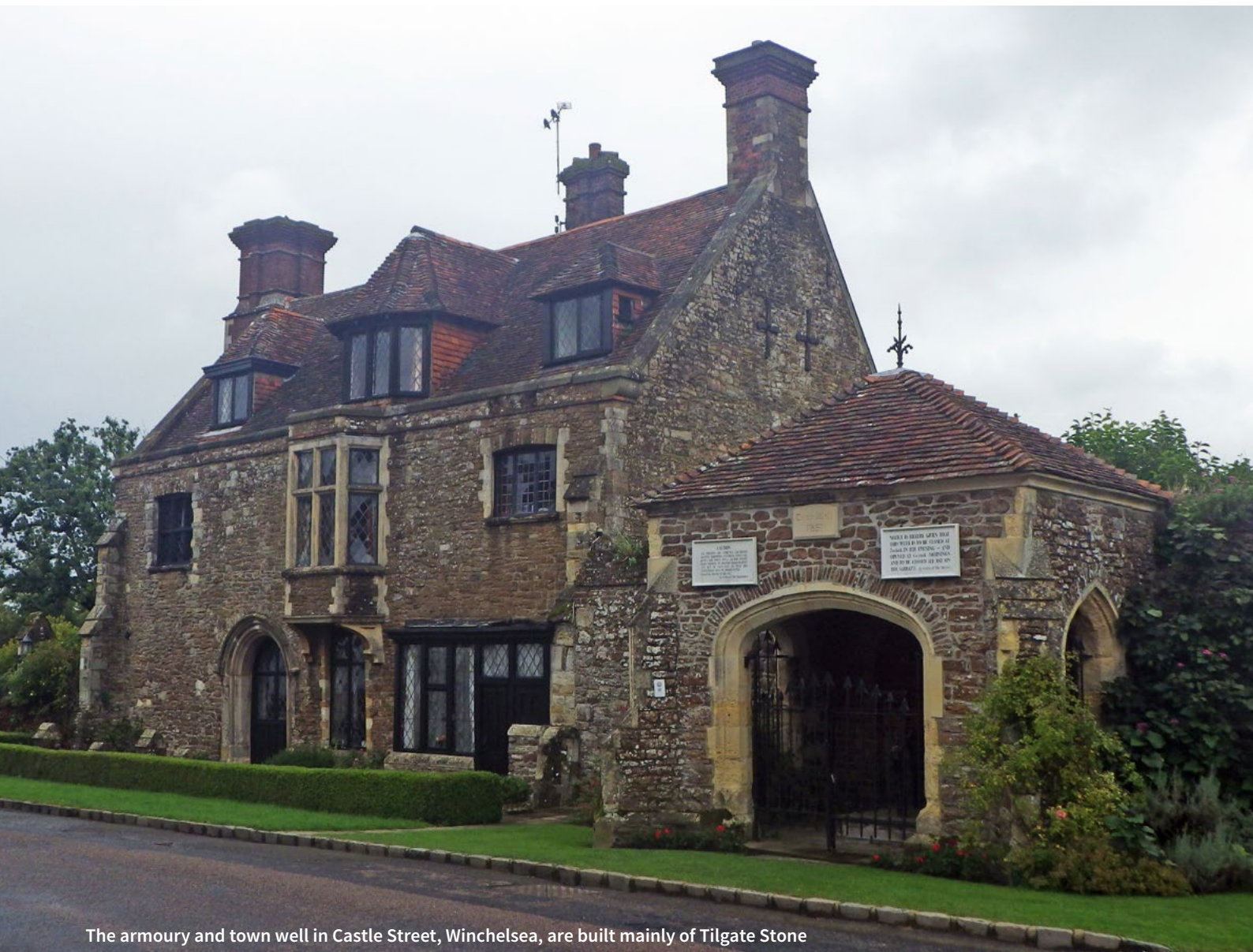
The armoury and town well in Castle Street, Winchelsea, are built mainly of Tilgate Stone

This sandstone is named from Hog Hill, near Icklesham, but it is best known from the Hastings area. The unit is up to 8 m thick, and comprises buff- or khaki-coloured sandstones, typically interbedded with grey and brown clays. The lower boundary is marked by an abrupt change from sandstone into mudstone.