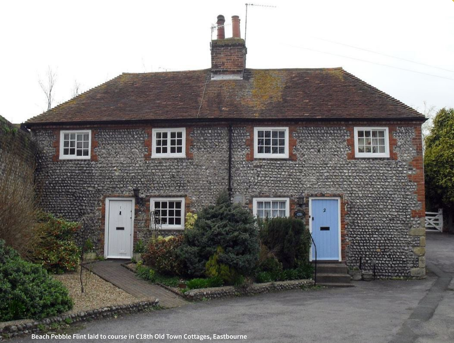
Beach Pebble Flint laid to course in C18th Old Town Cottages, Eastbourne

The collection of Beach Pebble Flint is now prohibited, but it was formerly one of the commonest and most widely used building stones in East Sussex and Brighton & Hove. Typically the stone was employed as and where it was found, in a variety of ways and in a range of structures within coastal towns and villages stretching from Brighton to Eastbourne and Hastings. It was also used in many buildings inland, especially in Lewes, Alfriston and Pevensey, where large flint cobbles form a significant part of the castle walls.