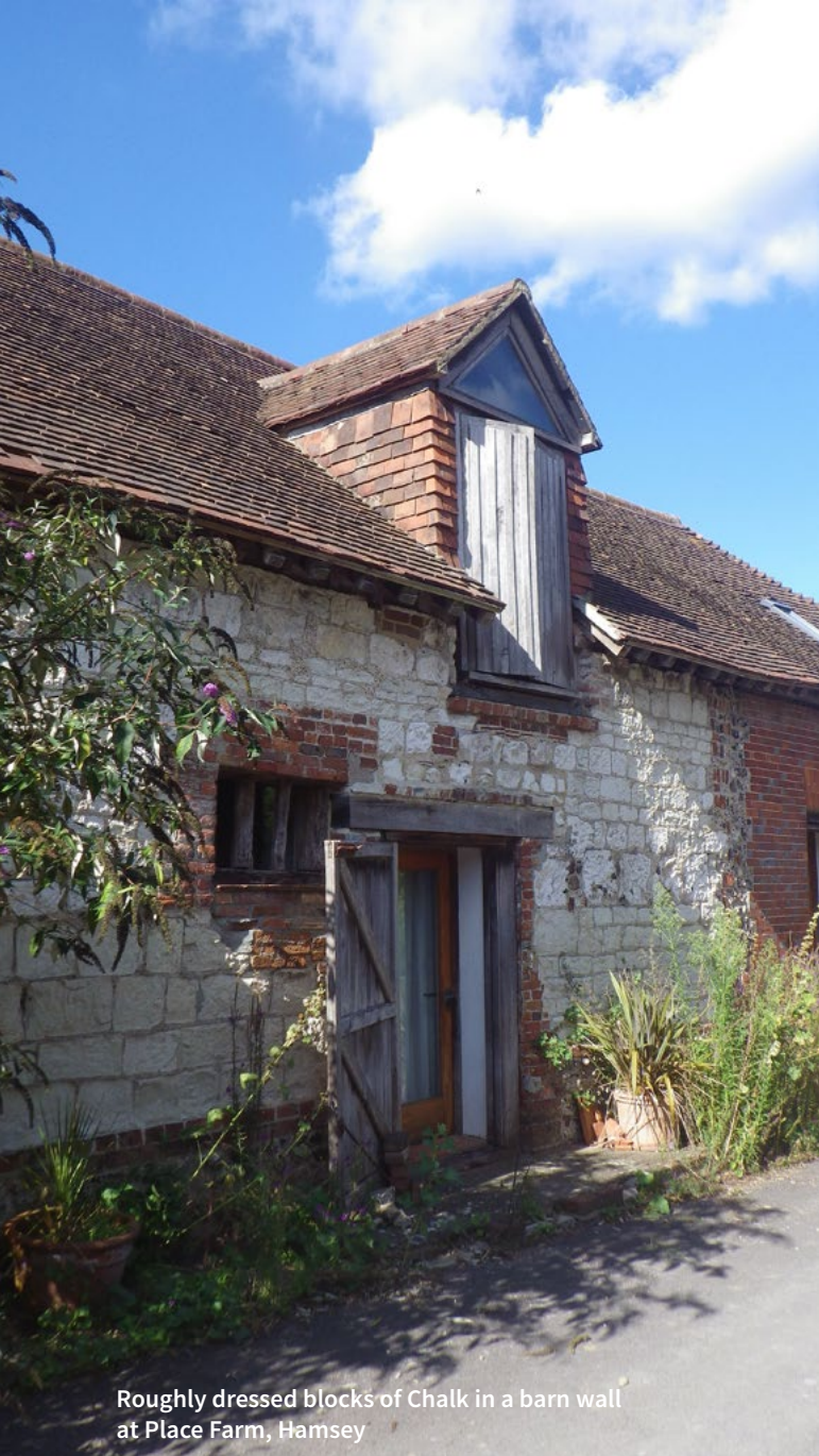
Roughly dressed blocks of Chalk in a barn wall at Place Farm, Hamsey