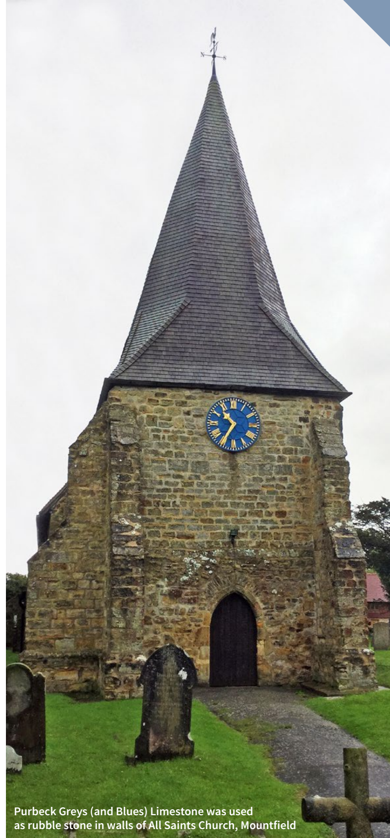
Purbeck Greys (and Blues) Limestone was used as rubble stone in walls of All Saints Church, Mountfield

The Greys Limestone is up to 26 m thick and comprises mainly grey, medium-grained (but occasionally coarser) crystalline