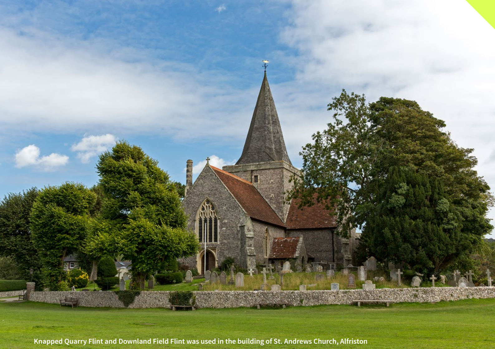
Knapped Quarry Flint and Downland Field Flint was used in the building of St. Andrews Church, Alfriston