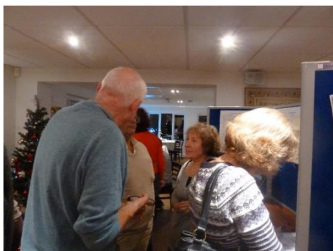
Riverside Tea Rooms