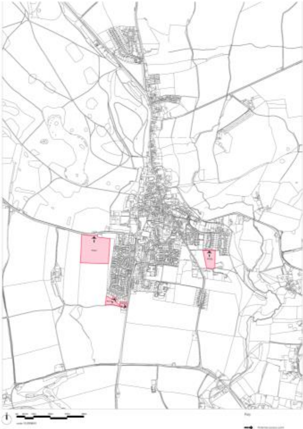
Option 02 - Sites: PW18, PW19, PW21