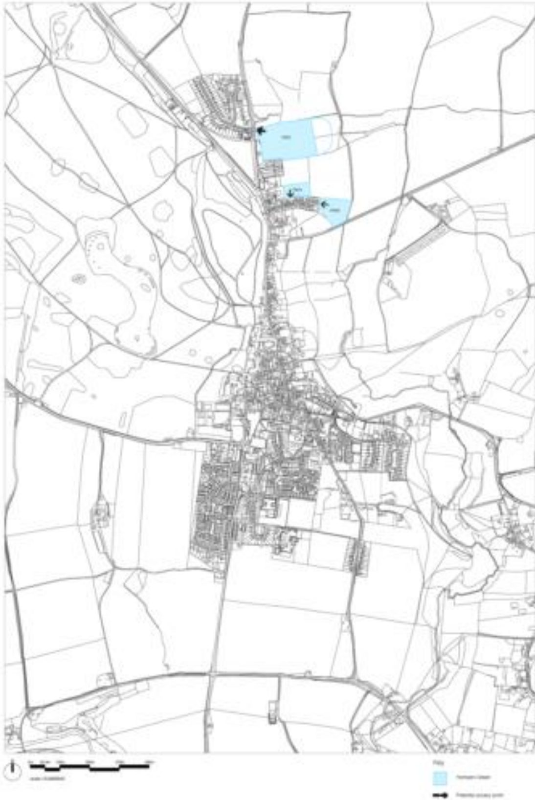
Option 03 - Sites: PNC01, PNC05, PNC06