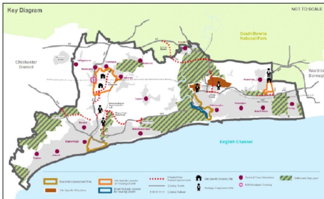
Plan B: Submission Arun Local Plan – Key Diagram

“Arundel will enhance and strengthen its unique special character as a small historic market town. Its many attractions, including improved facilities and wider access to the river from the town centre, enhanced arts and cultural facilities and its location as a natural gateway to the South Downs National Park, will mean that it will continue to act as a significant visitor destination. Arundel will also focus on providing greater opportunities to serve local needs for shopping, employment, housing and leisure facilities in order to underpin its attraction as a tourism venue with a strong vibrant community.” (para. 2.15)