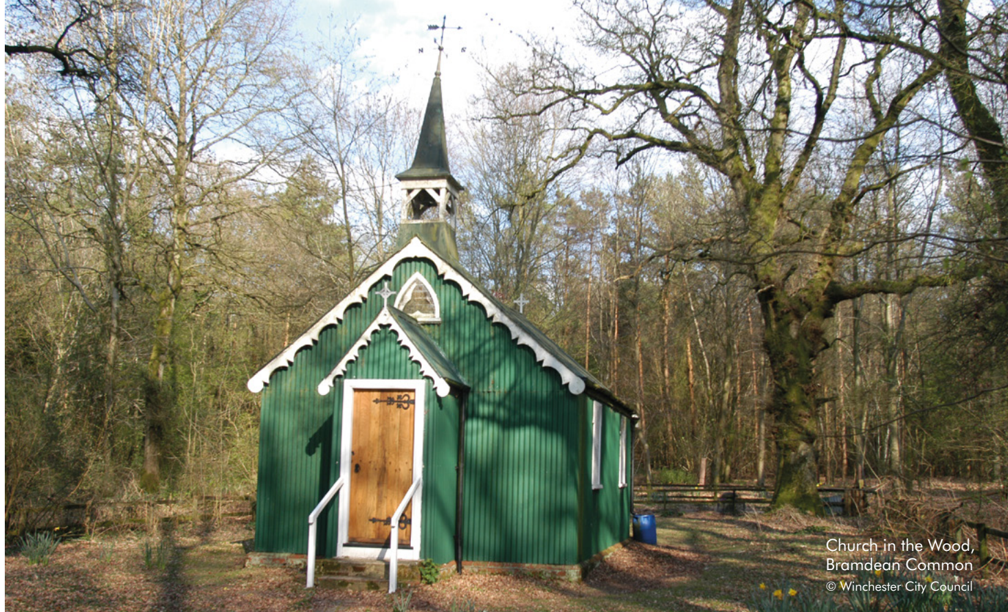
Church in the Wood, Bramdean Common

6 Bear left at the fork in the road signposted 'Woodlands'. Pass Wolfhanger Farm and after 1.5km turn sharp right opposite Stable Cottage. Continue downhill to the A272 and the nearby Circle of Stones.