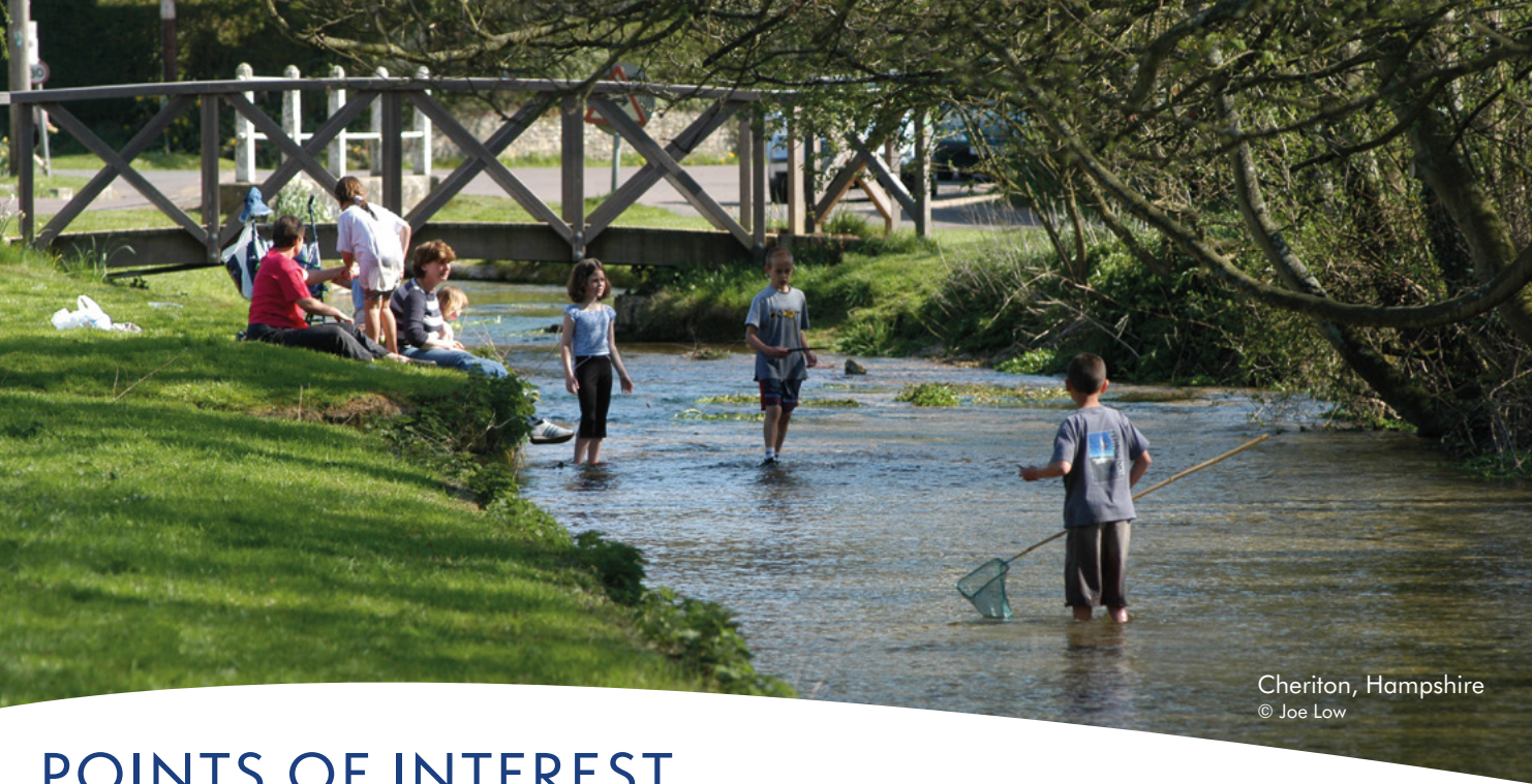
Cheriton, Hampshire