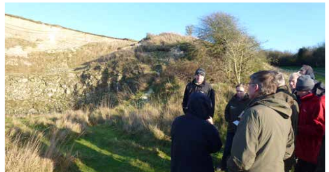
SDLAF members examine a dangerous chalk pit on Access Land in East Sussex.

The SDLAF attended two site visits to look at Access Land restrictions to be made for public safety; one for a bull being present for part of the year and one for a dangerous chalk pit. Forum members assessed the impact of the restrictions on the ground and met the applicants who explained their land management needs. The SDLAF advice was to make the restrictions but to explore long term management options which would reduce the extent of, or remove the need for, restrictions.