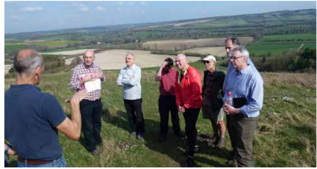
The SDLAF explore access management at Beacon Hill National Nature Reserve.

Network Rail also applied to extinguish a footpath crossing in Buriton, Hampshire. The SDLAF challenged Network Rail's reasons for this as it was not satisfied that the evidence given was either accurate or justification for an extinguishment. Alternatives to closure seemed not to have been investigated and any incidents that had occurred were due to trespass and irresponsible behaviour not connected with the legitimate use