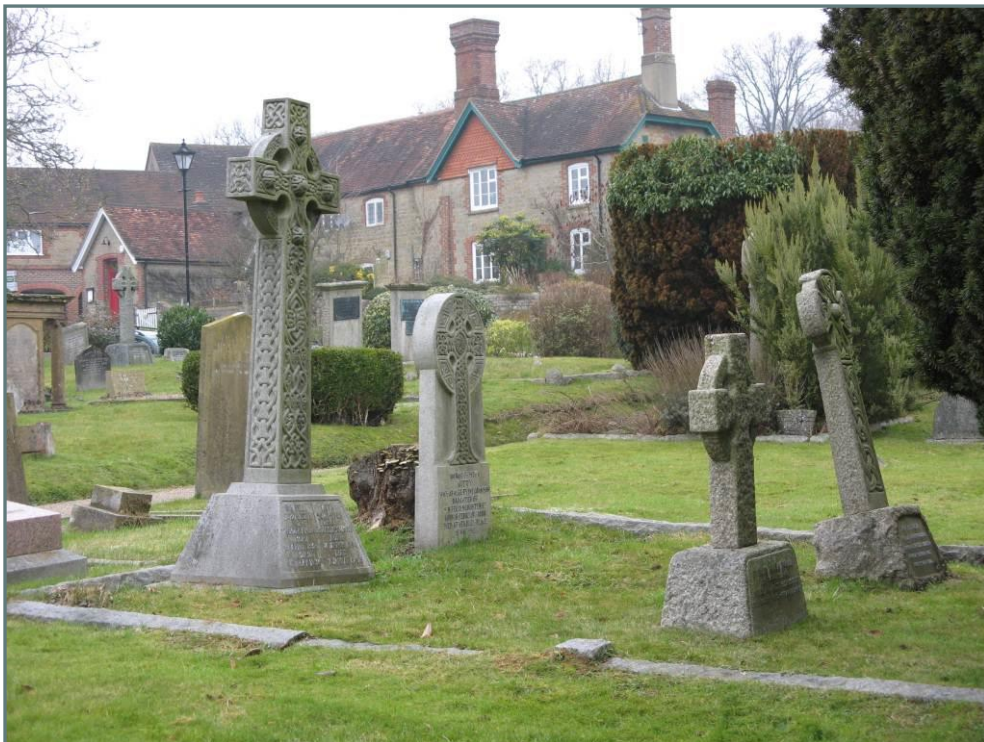
Post Office Row, seen from the cemetery on the south side of Church Lane