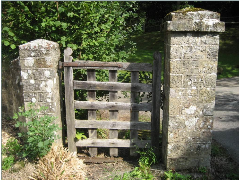
The surviving boundary gates of Ropes and Bollards seem to be significant Arts and Crafts features in their own right