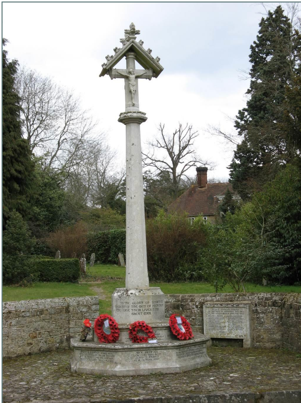
The First World War memorial, now listed, facing Church Lane. The fallen of the Second World War are remembered on the separate stone plaque against the wall