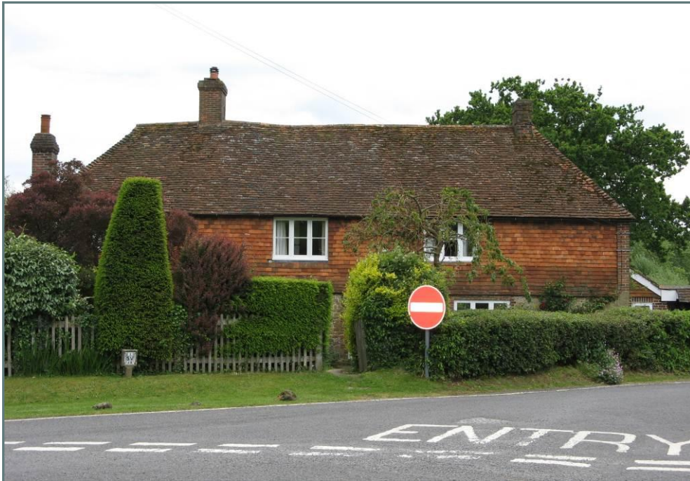
Clay plain tiles, used for both roofs and as a cladding are a characteristic of Wealden vernacular buildings