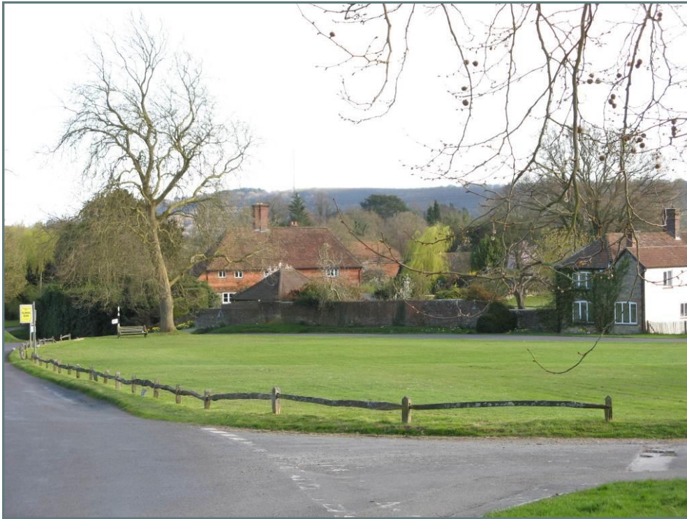
The Green is lined with historic buildings of varied date, material and character. A backdrop of trees and longer views to hills beyond provide a sense of connection to surrounding countryside