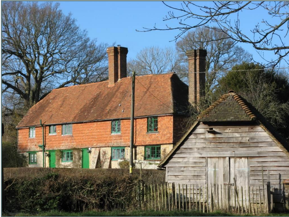
Vanlands is also beyond the current boundary

Ropes and Bollards were designed by CFA Voysey, one of the premier Arts and Craft architects of the early Twentieth Century