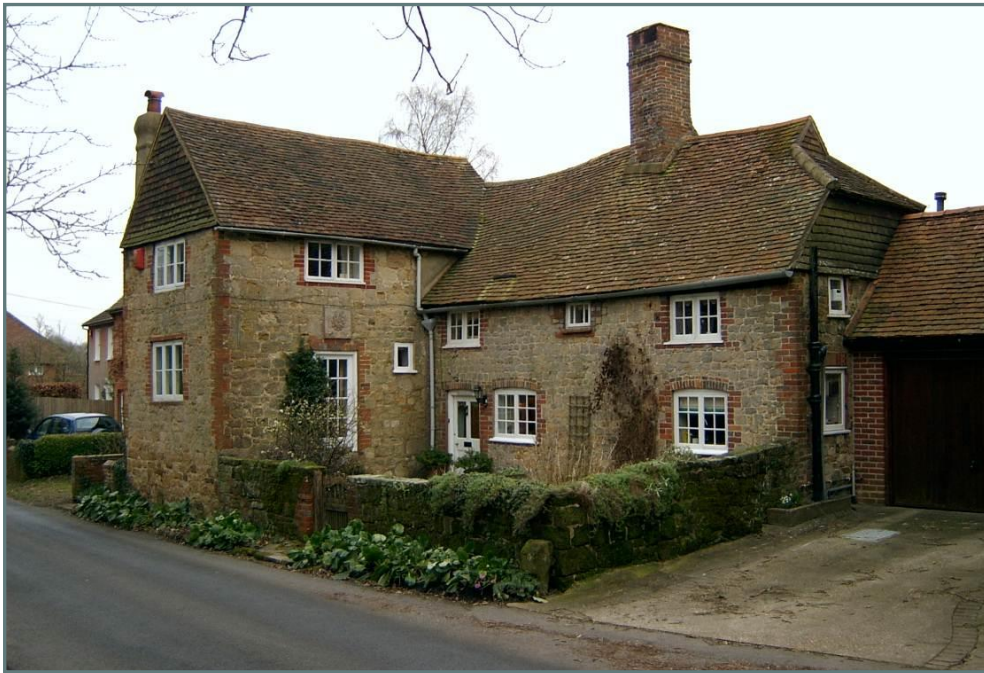
Park View, Church Lane – Greensand rubble with brick dressings