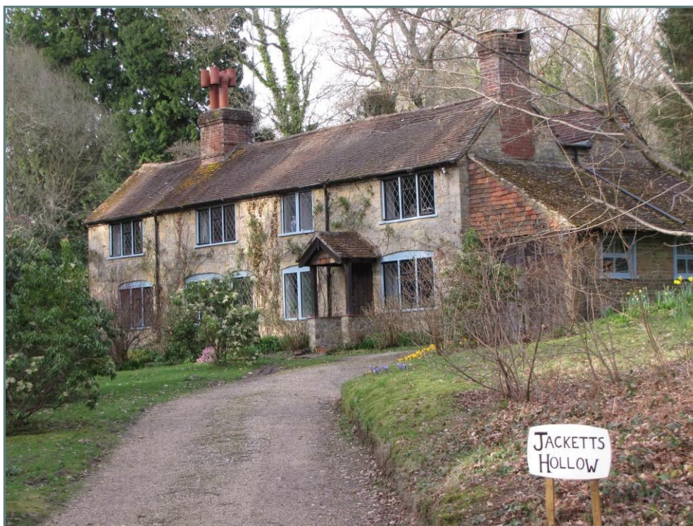
Jackett's Hollow, on the old road south from the Green is not within the current conservation area boundaries but within the potential extension.