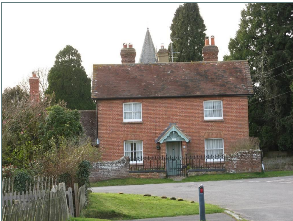
Brickwork became increasingly popular in the Nineteenth and Twentieth Centuries