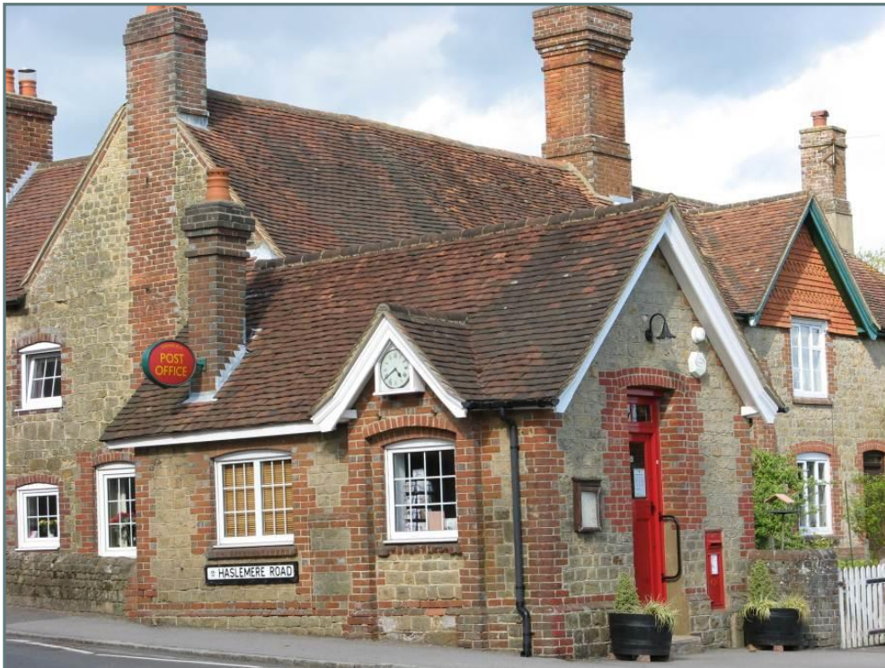
The Post Office

4.2 The Old Post Office at the junction with Church Road is arguably the most prominent landmark when passing through Fernhurst on the modern A286. It clearly marks the point of entry into the conservation area to the east. From the outside, the adjacent cottages appear to date from the Nineteenth or early Twentieth Century but the facades mask timber framed buildings within. Though unlisted, these buildings make a strong positive contribution to the conservation area and would be sensitive to further change.