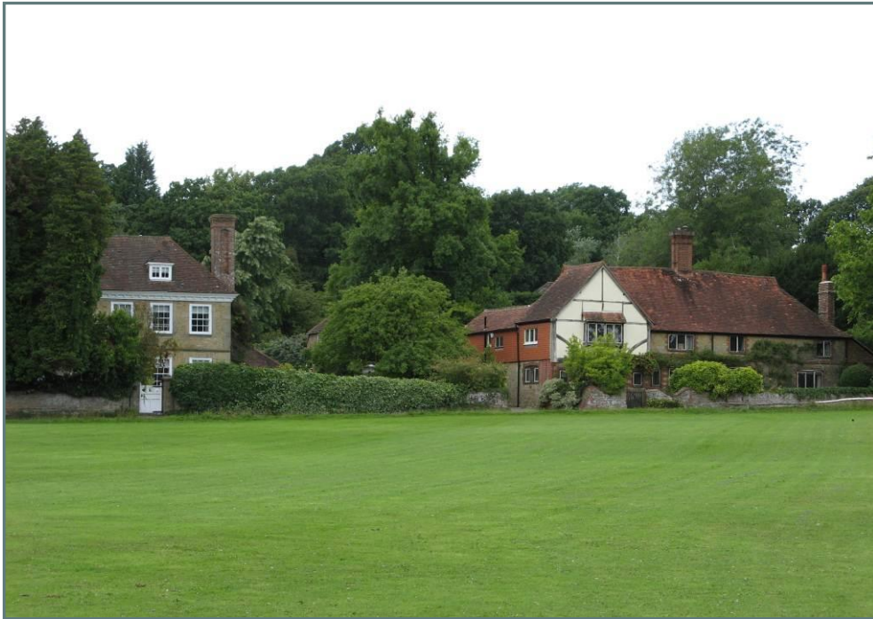
Georgian classicism and traditional vernacular styles stand side by side facing the Green

The White House displays refined use of the local stone – normally only used for rubble walling and more often combined with brick for edges and corners