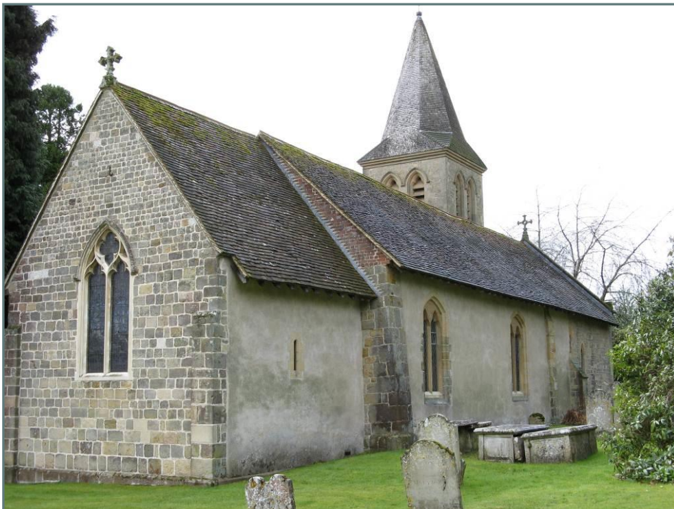
St Margaret's Church as it was in 2008

Recently an extension was added beside the Church with a spill-out area in the churchyard