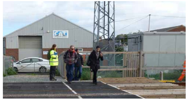
Site visit to Newhaven rail crossing

The potentially controversial subject of fencing of common land has been tackled by the SDLAF on several occasions. The latest proposals from Sussex Wildlife Trust to fence common land at Iping and Stedham Commons, in order to conserve precious heathland sites by grazing, was again well supported by the