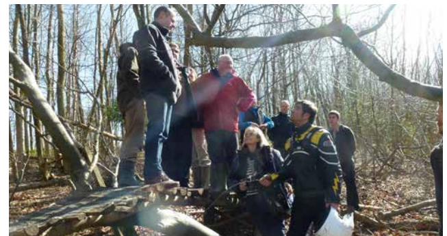
Site visit to mountain biking track at Steyning

SDLAF who offered detailed advice on access and commended Sussex Wildlife Trust on its consultation process.