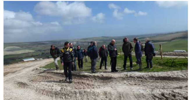
Site visit to South Downs Way at Annington piggery