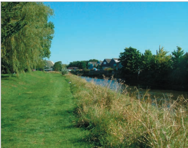
Artificially straightened sections of the river's course are associated with its industrial history.