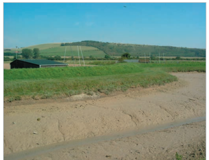
The floodplain includes a network of tidal channels.