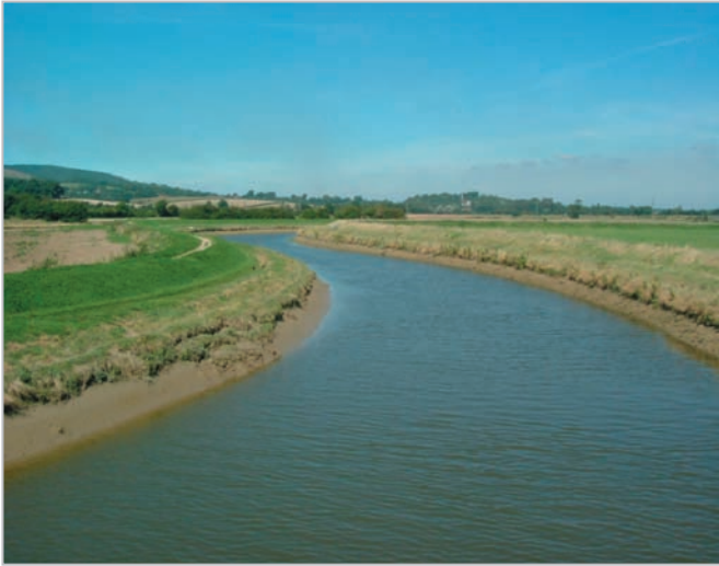
The meandering course of the River Adur.