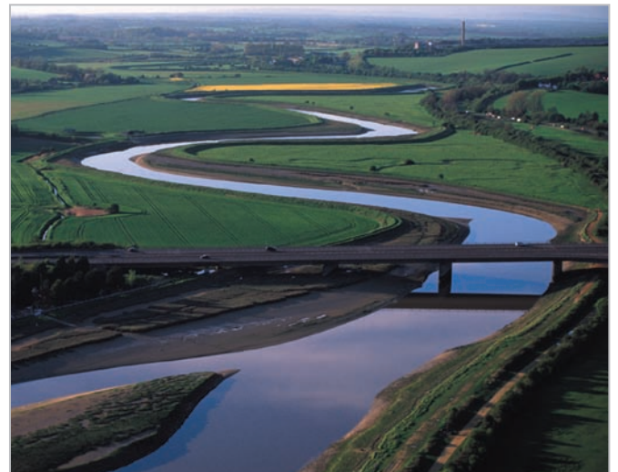
The A283 and A27 both cross the river and detract from the sense of tranquility.