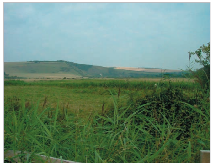
Away from transport corridors the floodplain retains a tranquil, unspoilt character.