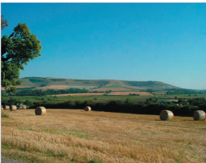
Although the landscape has a generally pastoral character, there are blocks of arable cultivation.