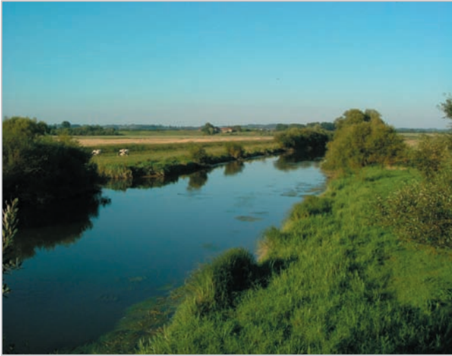
In places, a natural, tranquil, pastoral river floodplain landscape.