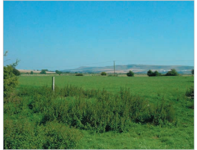
The absence of woodland and generally low incidence of trees, results in a large scale, open landscape.