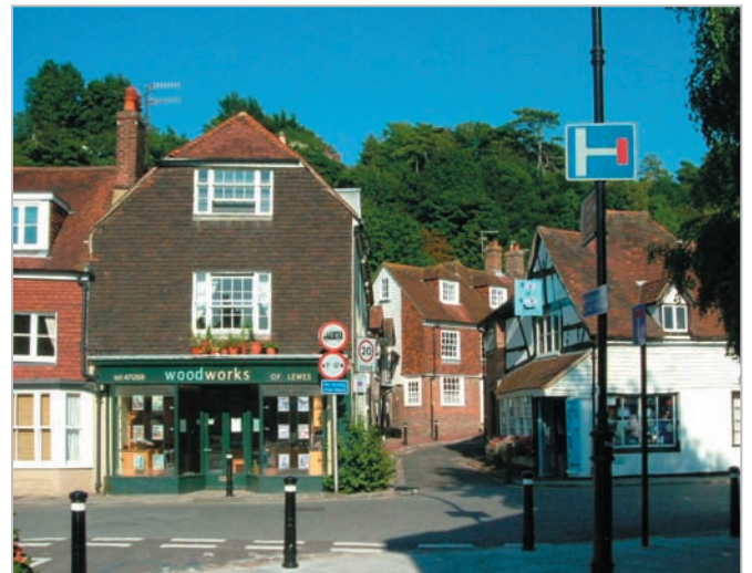
The historic village of Cliffe developed around an ancient ford.