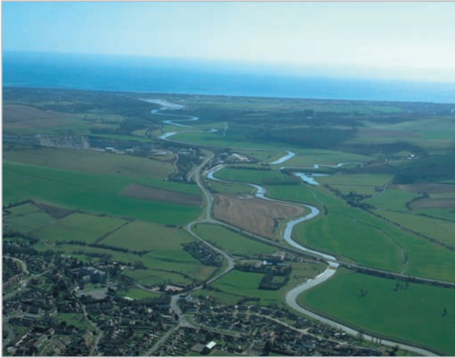
The wide valley of the Ouse cuts through the chalk.