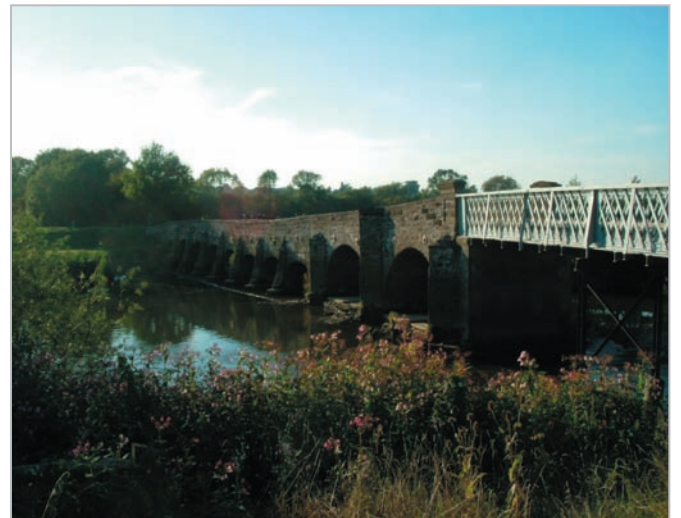
Historic stone and white wood bridges provide river crossing points.