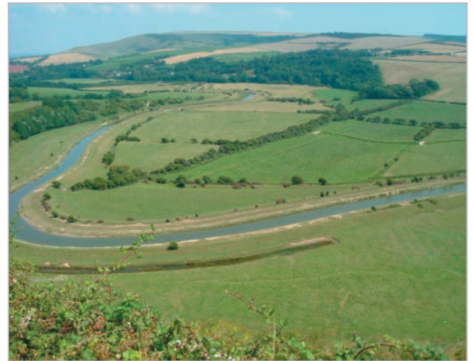
The river meanders across the floodplain in broad loops.