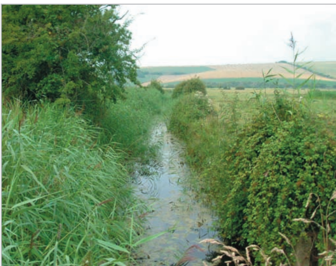
The floodplain is etched by artificial geometric drainage ditches.