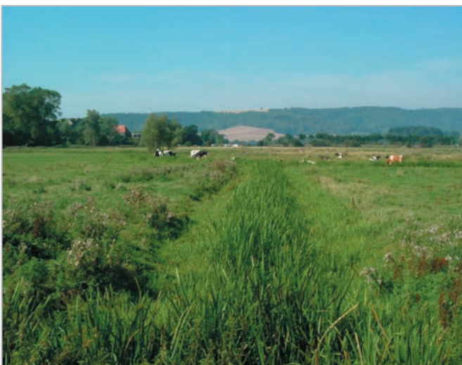
The floodplain is etched by a geometric grid of narrow channels or 'wet fields' which divide pastures.