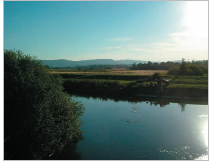
Some sections of the river are artificially straightened.