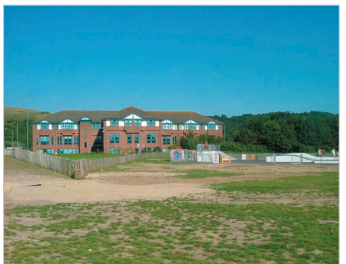
Mallings Industrial Estate is a new area of built development on the floodplain at Lewes.