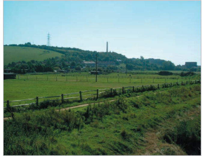
In places, paddocks have subdivided the open floodplain.