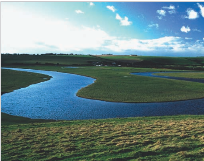
A landscape of apparently large and expansive scale as a result of the flat form and consistent landuse.