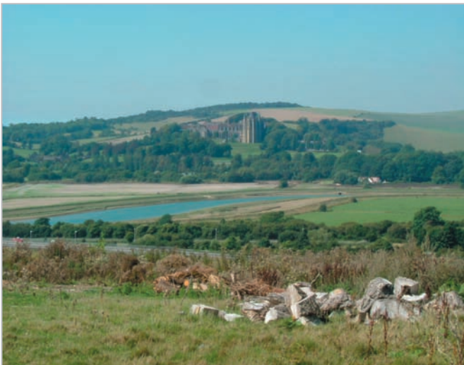
Views to the landmark building of Lancing College forms a distinctive entrance to the Adur Valley.