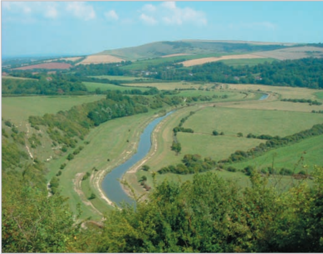
Footpaths along the river banks provide opportunities for recreational use.