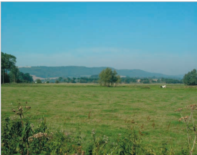
The flat landscape is enclosed by the surrounding valley sides and scarp.