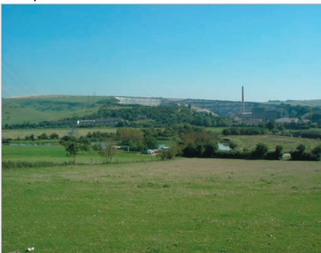
A major chalk quarry and cement works at Shoreham is a highly visible landscape feature.