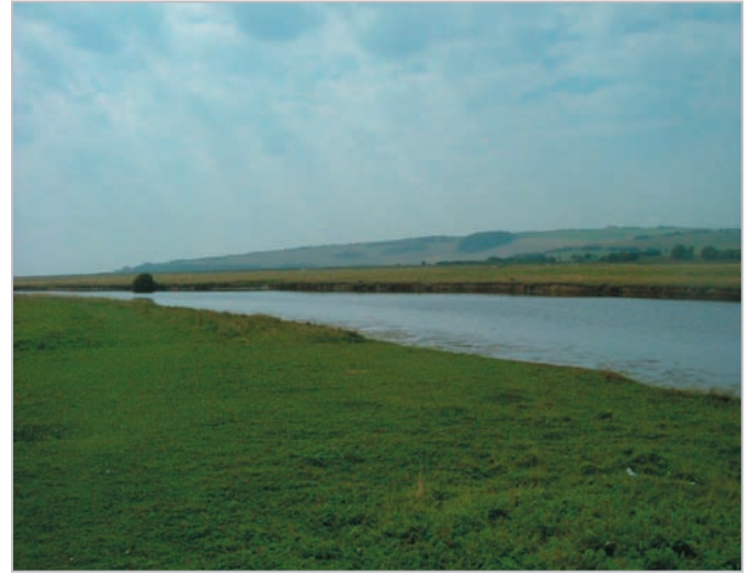
An absence of settlement and built form on the floodplain.