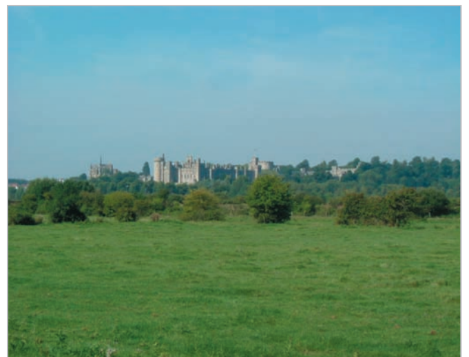
Impressive views to Arun Castle at the mouth of the river.