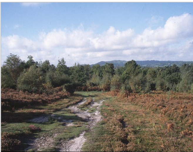
Track cutting through oak and beech woodland and heathland at Longmoor.