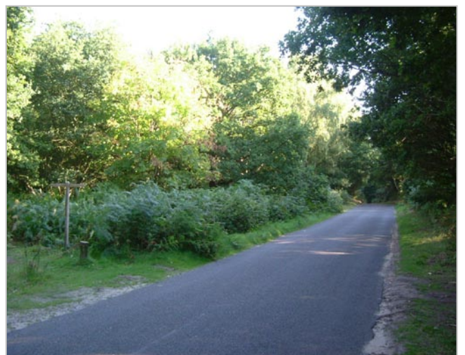
Well wooded, although woodland suffers from the introduction of exotic species.