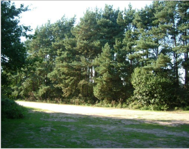
Well drained sandy soils, support a variety of woodland types.