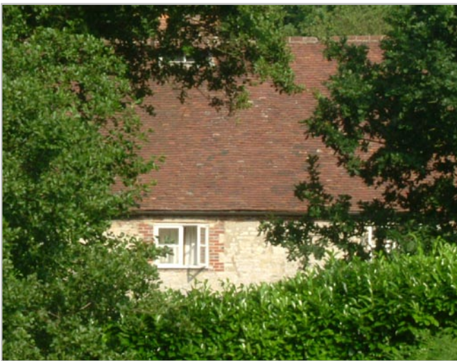
Sandstone, red brick and clay tiles are typical building materials.