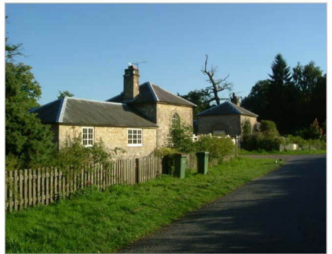
Local sandstone is a traditional building material.