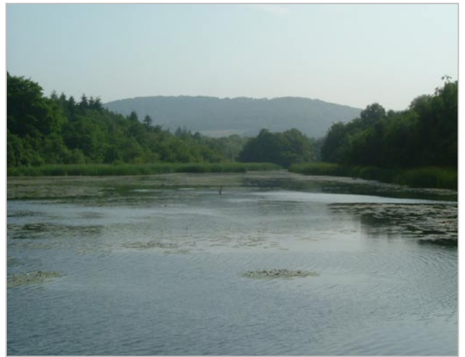
The chalk scarp forms a backdrop to Buriton Mill pond.