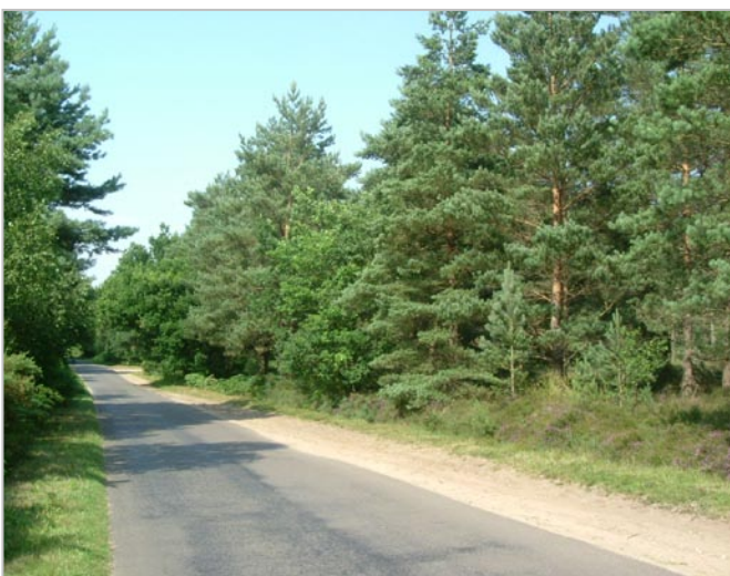
Rural roads are unmarked, with sandy verges. Scots pine is characteristic.