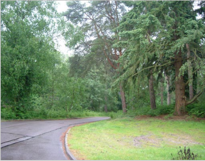
Tall coniferous trees provide a sense of enclosure.