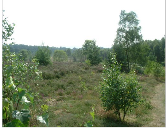
Management of heathland is a key issue in this area.