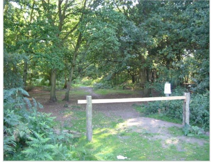
Sandy, narrow tracks cutting through the woodland.