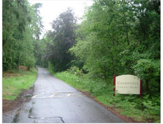
Champney Forest Spa is a recreational use of the area.