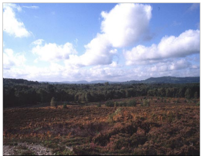
Heathland at Longmoor.