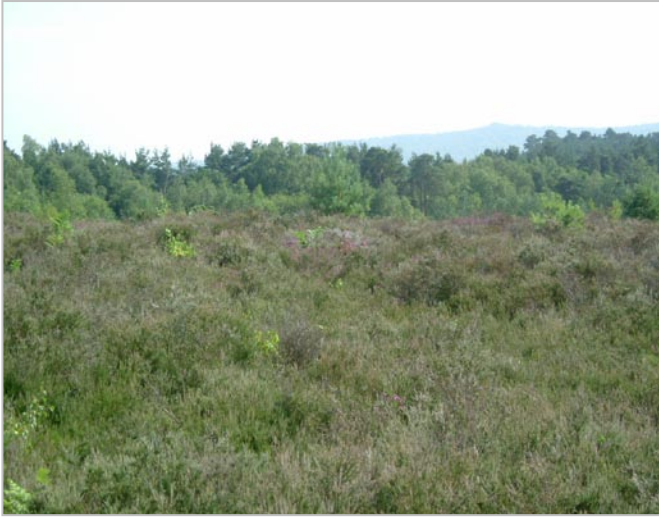
Open heathland at Iping Common.