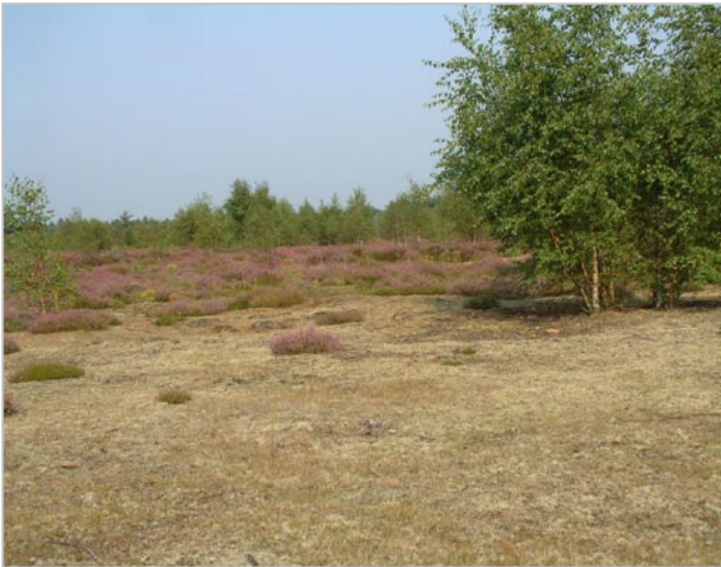
Clearing at Woolmer, containing birch, lowland heath and acidic grassland.