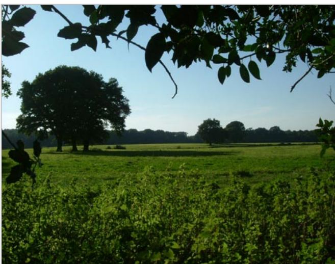
Pastoral fields with individual field trees dotted throughout.