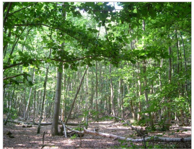
Deciduous woodland forms part of the mosaic.