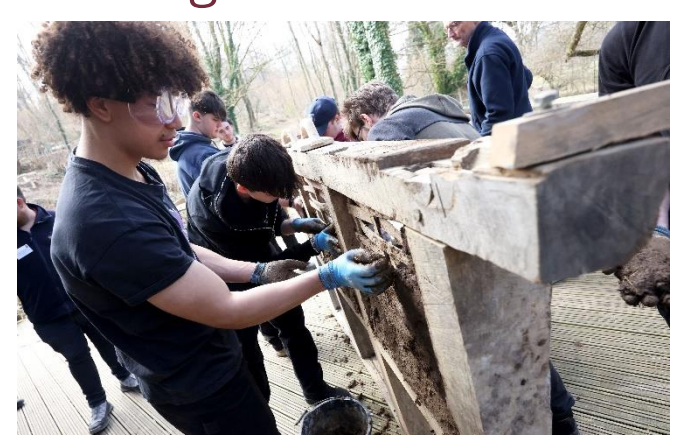
The National Park Authority is helping to support the next generation of building conservationists.

Young people from across Sussex took part in a Heritage Skills Taster Day at Weald & Downland Living Museum, gaining hands-on experience in traditional building crafts vital to the future of conservation.