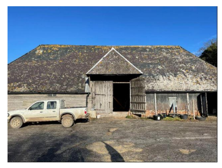
The Threshing Barn that dates back to the 1600s

There will also be a new footpath to run south from the farm to Easton.