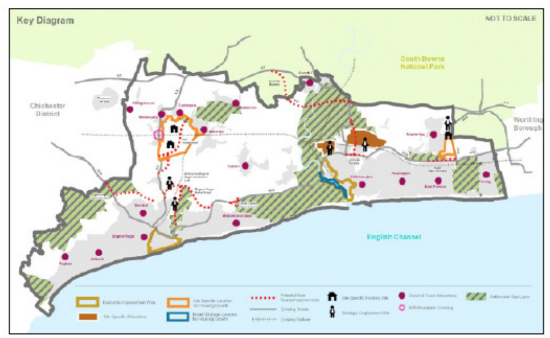
Plan B: Submission Arun Local Plan - Key Diagram

"Arundel will enhance and strengthen its unique special character as a small historic market town. Its many attractions, including improved facilities and wider access to the river from the town centre, enhanced arts and cultural facilities and its location as a natural gateway to the South Downs National Park, will mean that it will continue to act as a significant visitor destination. Arundel will also focus on providing greater opportunities to serve local needs for shopping, employment, housing and leisure facilities in order to underpin its attraction as a tourism venue with a strong vibrant community." (para. 2.15)