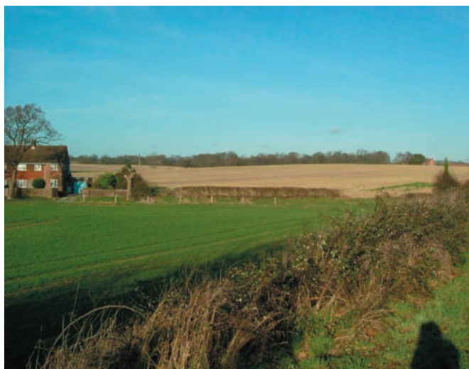
A low lying, undulating, fertile strip of land between the dipslope of the South Downs and the sea.