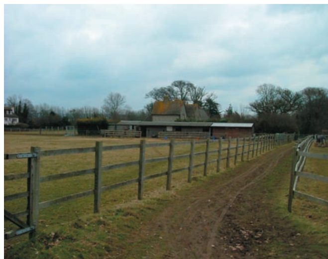
Fencing surrounding paddocks.