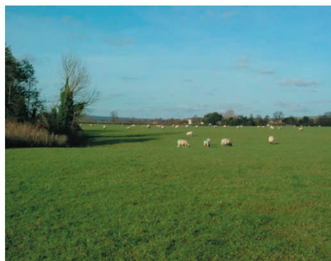
Vast fields between Lavant and Halinaker are reminiscent of the medieval open field landscape that formerly existed here.