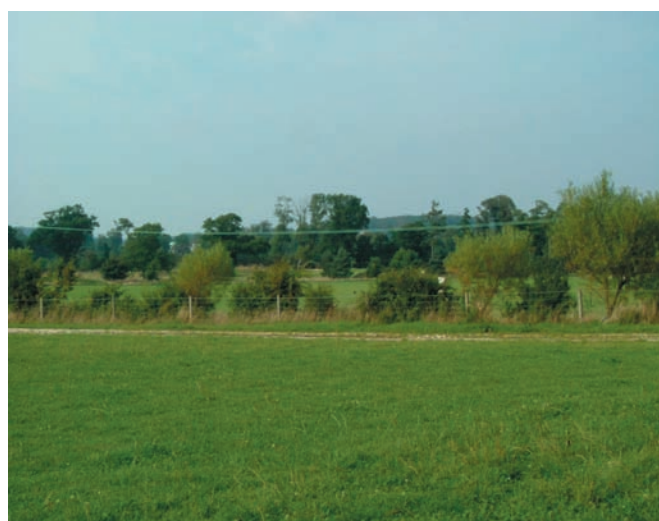
Historic parks contribute landscape features such as parkland trees.