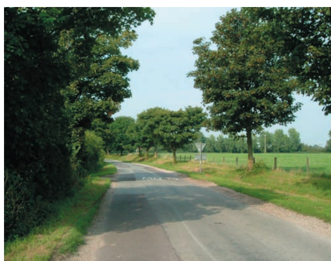
A strong network of hedgerows, hedgerow oaks and small woodlands creates structure.