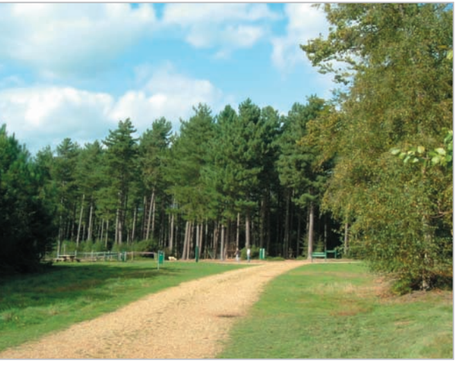
Well drained sandy soils, support coniferous woodland and heath.