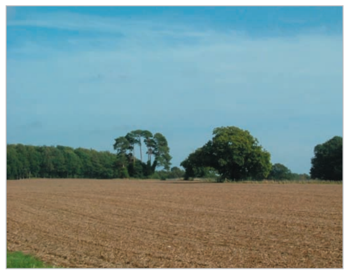
Woodland surrounded by recent (18th and 19th century) enclosure which often forms straight edges and sharp corners.