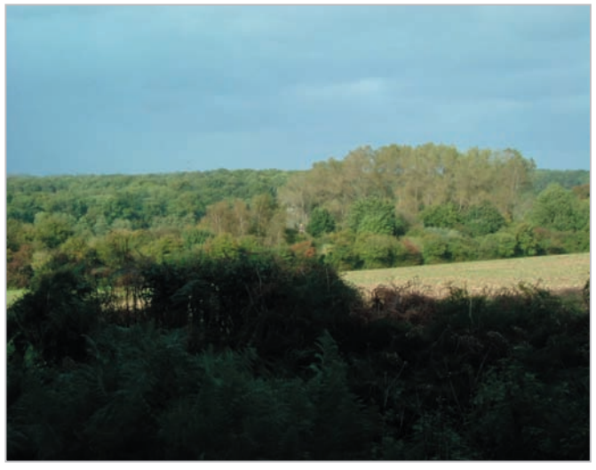
Large woodland blocks, provide important ecological habitats.