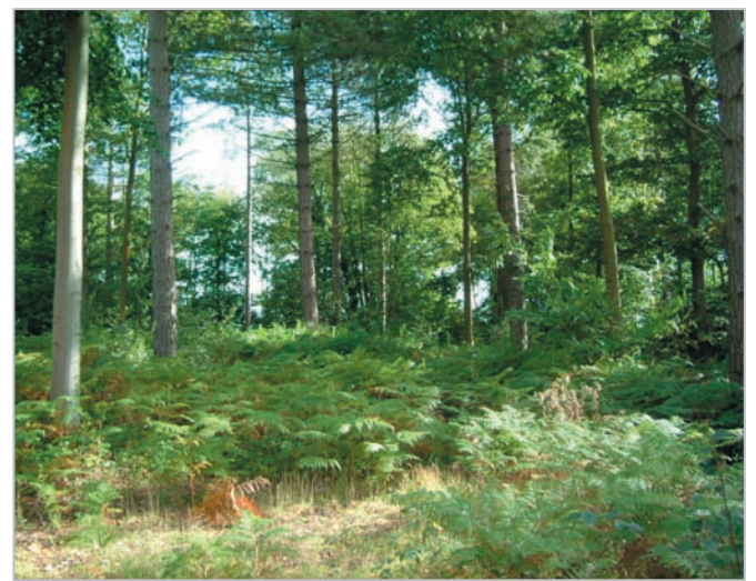
Heathland landscape on sandy soil.

Large areas of woodland are owned by the Forestry Commission and provides good opportunities for recreation.