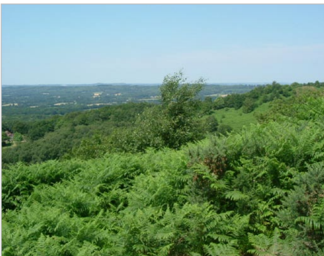
Open hilltops provide extensive, panoramic views across adjacent, lowlying areas.