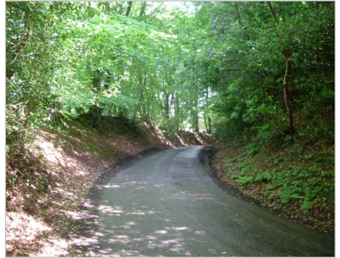
Narrow, deeply sunken lanes wind up hillsides.