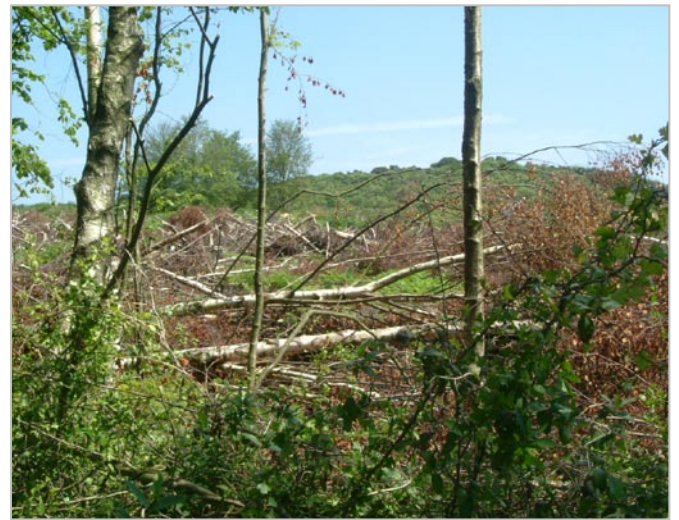
Woodland is interspersed with open heathland.