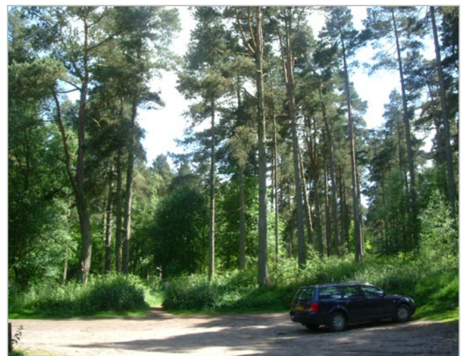
Tall, Scots pine are a feature of the sandy soils, and create a strong sense of dense enclosure.