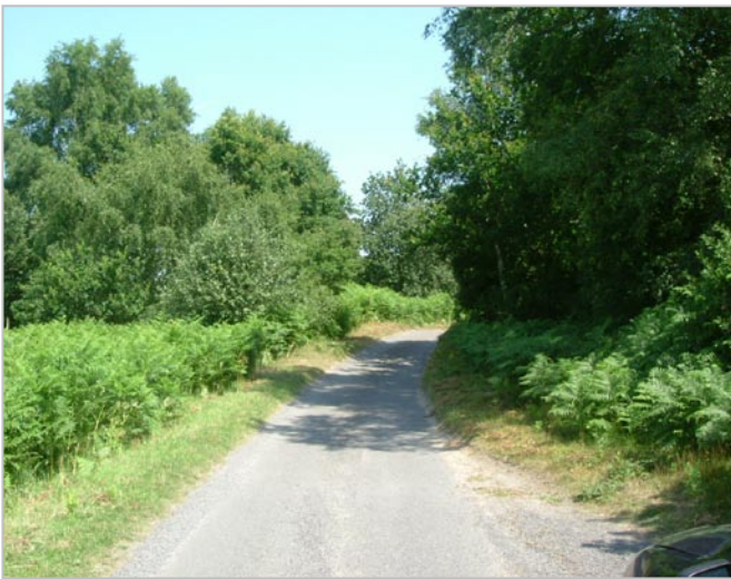
Significant woodland cover contributes to the scale of enclosure, mystery and remoteness of the hills.