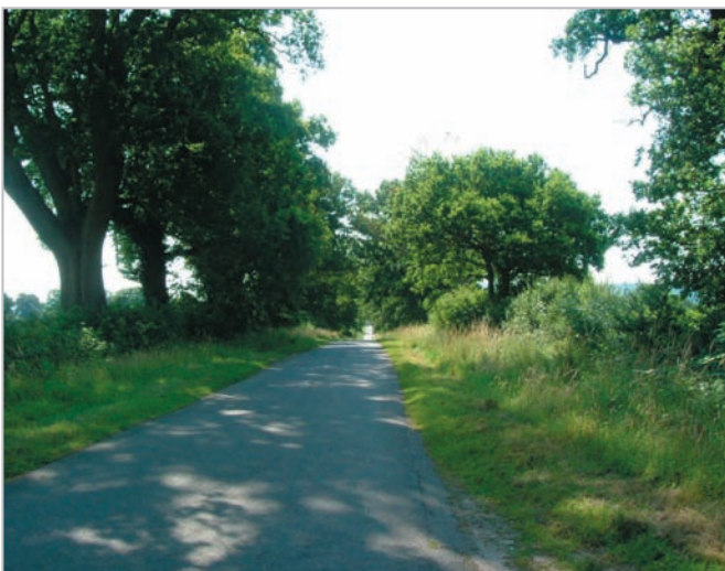
Thick hedgerows and spreading hedgerow oaks provide a sense of enclosure.