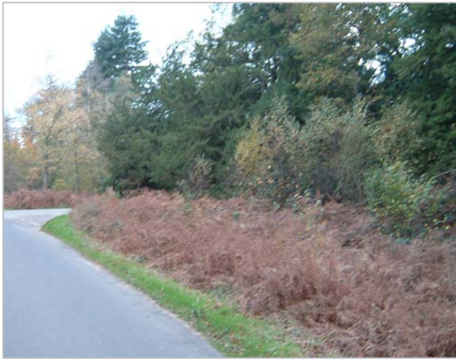
Rural lanes with heathy road side edges.