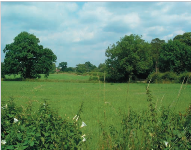
The wet soils are marginal for agriculture.