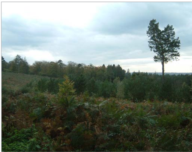
Coniferous plantation forms a component of the heathland/woodland mosaic.