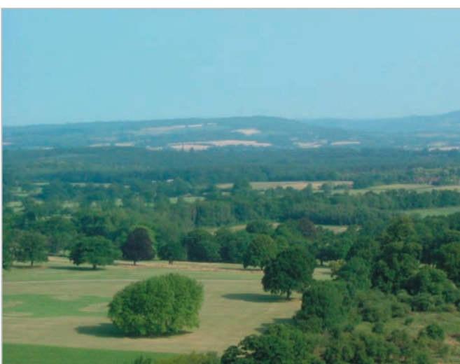
The presence of landscape parks indicates historic recreational use of the poor soils by wealthy land-owners.