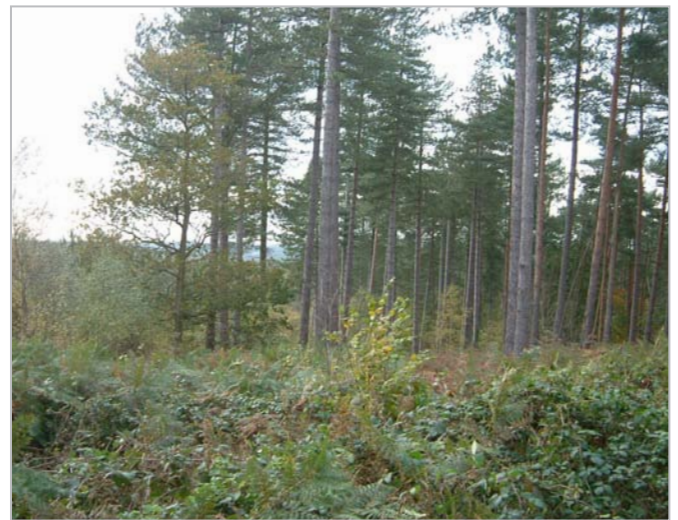
Densely vegetated landscape. Woodland/trees provide vertical accent.