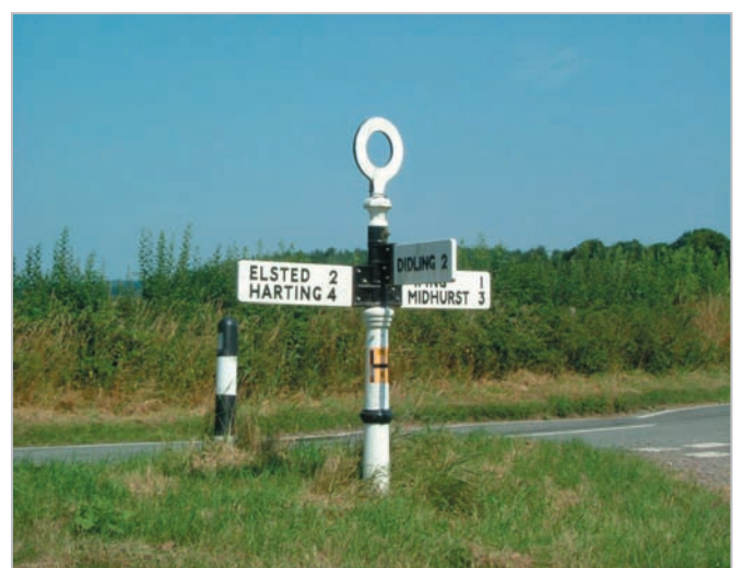
A traditional road sign on a rural road.