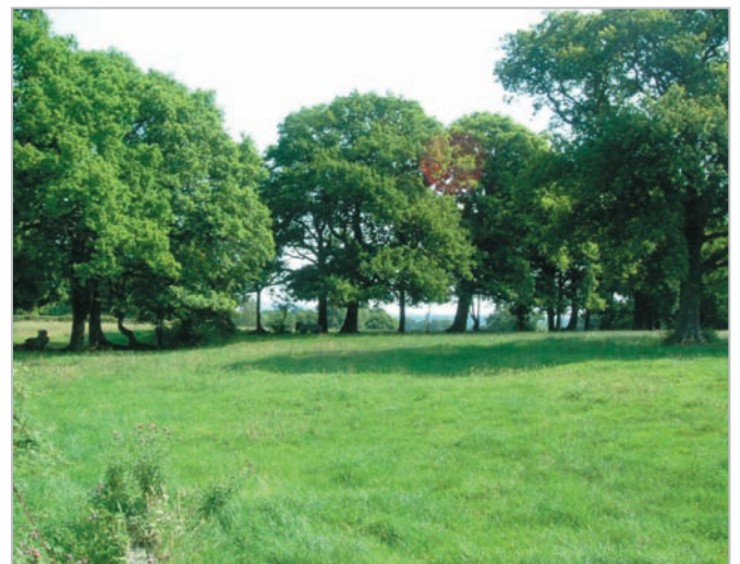
View across farmland showing pasture, field oaks, and hedgerow trees.