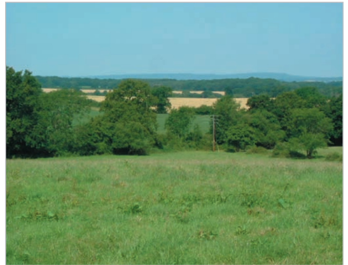
Areas of unimproved grassland.