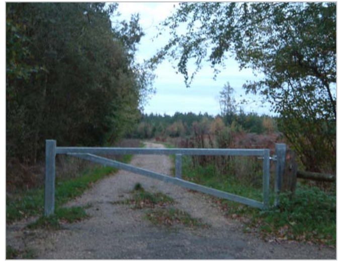
Small tracks leading to woodland plantations, which create a strong sense of enclosure.