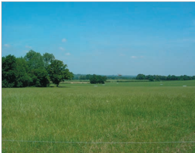
A low lying clay 'vale' at the foot of the greensand 'terrace' in East Hampshire.