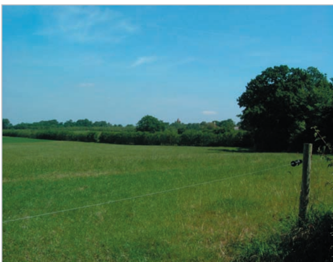
This landscape is tranquil and remote.